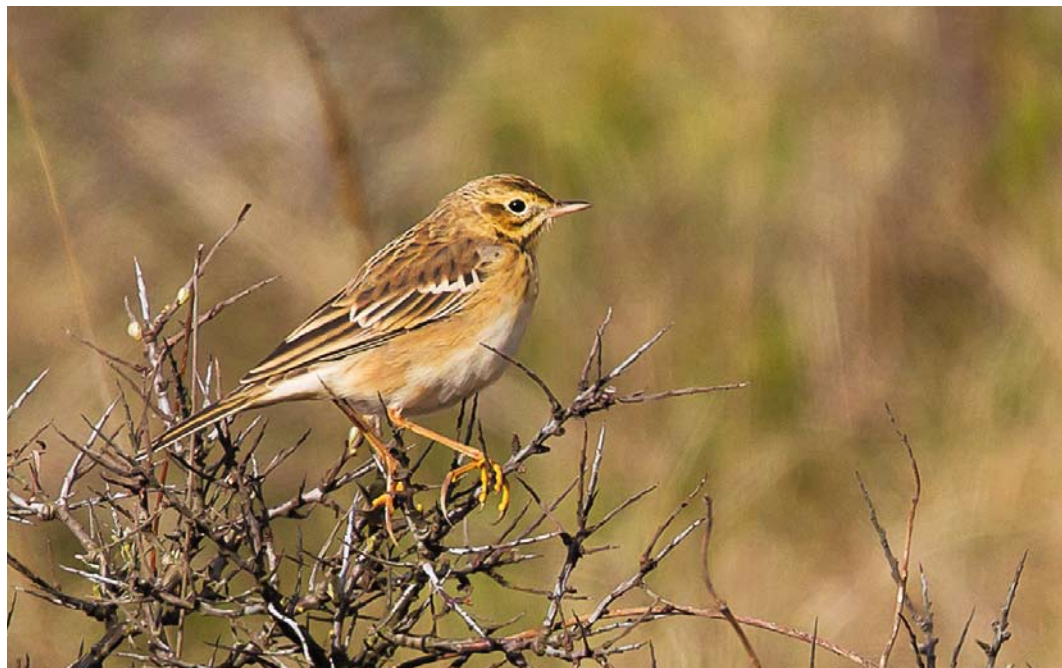
279 Grote Pieper / Richard's Pipit Anthus richardi , Texel, Noord-Holland, 18 april 2014 (Jos van den Berg)