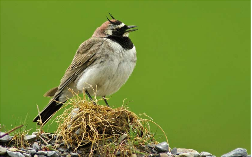
236 Caucasian Horned Lark / Kaukasische Strandleeuwerik Eremophila penicillata , Kazbegi, Georgia, 26 June 2005