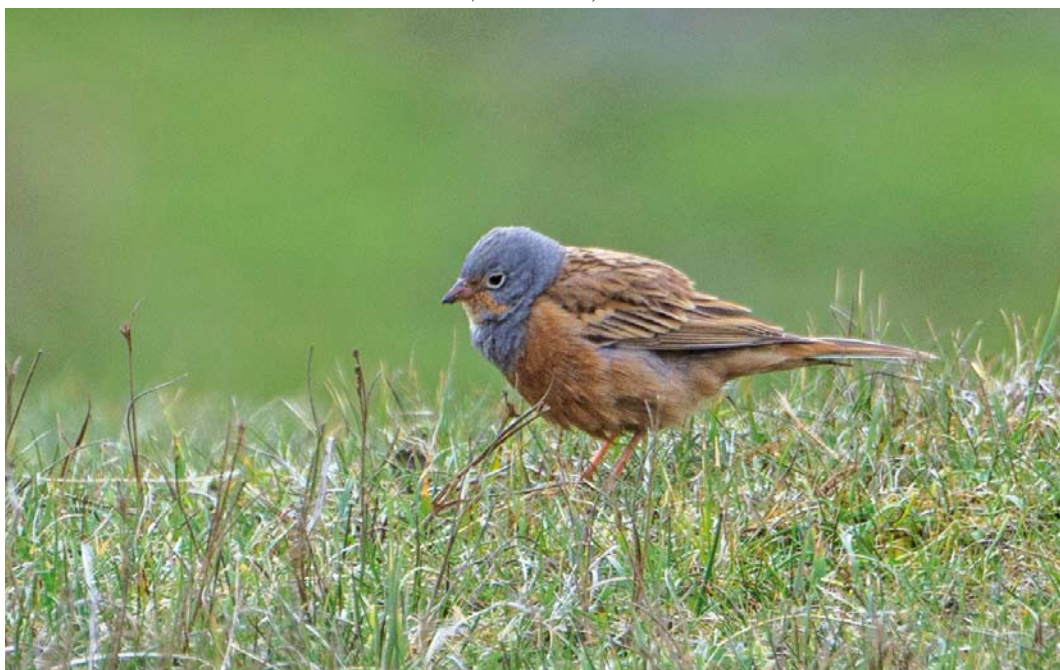
251 Cretzschmar's Bunting / Bruinkeelortolaan Emberiza caesia , male, Fair Isle, Shetland, Scotland, 2 May 2014