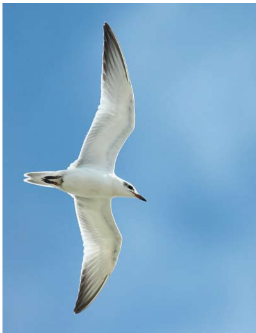
183 Gull-billed Tern / Lachstern Gelochelidon nilotica , juvenile, Waarland, Noord-Holland, Netherlands, 12 August 2013. Note colour-rings.