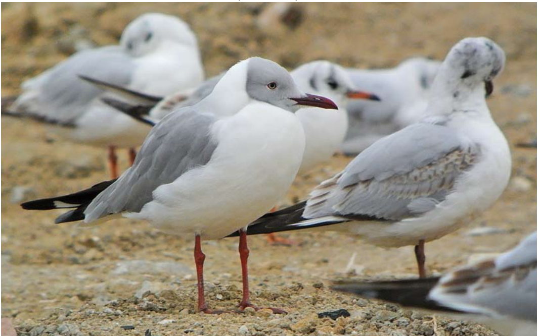
249 Grey-headed Gull / Grijskopmeeuw Chroicocephalus cirrocephalus , adult, with Black-headed Gulls / Kokmeeuwen C. ridibundus , Pinto dump, Madrid, Spain, 29 March 2014 ( Delfín González )