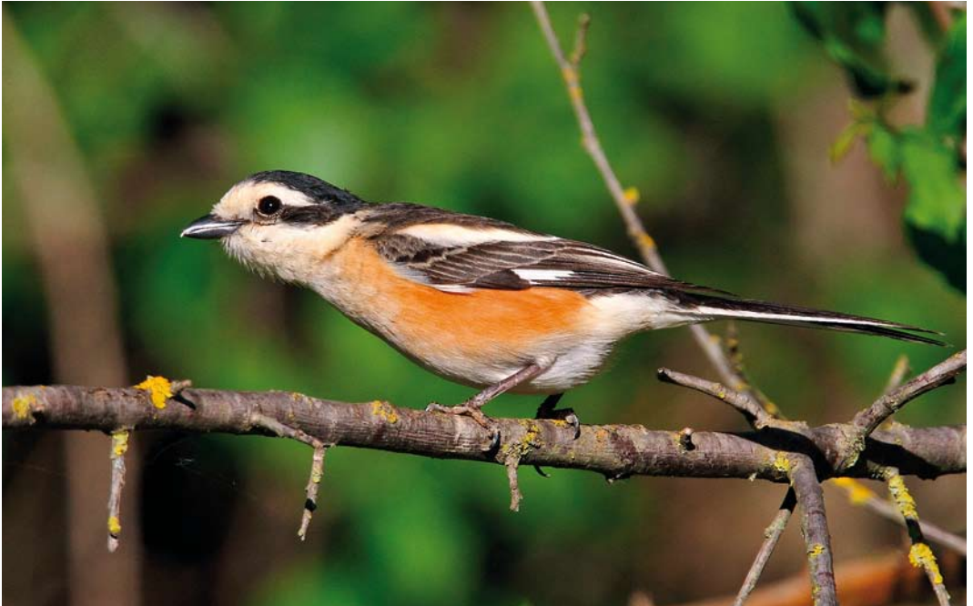
264 Masked Shrike / Maskerklauwier Lanius nubicus , adult female, Mérida, Navarra, Spain, 13 April 2014 (Juan Sagardía)