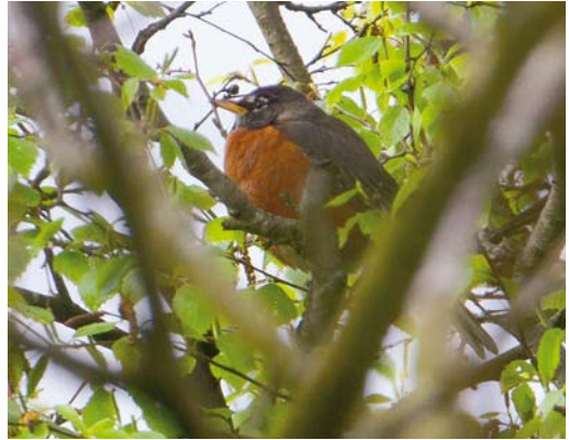
287 Roodborstlijster / American Robin Turdus migratorius , eerste-zomer mannetje, Noordhollands Duinreservaat, Heemskerk, Noord-Holland, 27 april 2014 (Jaap Denee)

dan een zuivere Azuurmees ligt er een zware bewijslast om Pleskes uit te sluiten (voor een compleet overzicht van gevallen van Azuurmees en Pleskes in Europa, zie Dutch Birding 34: 219-231, 2012). Op basis van de foto's en beschrijving lijken alle kenmerken te kloppen voor Azuurmees maar het verschil kan erg lastig zijn en daarom zal de Commissie Dwaalgasten Nederlandse Avifauna (CDNA) het definitieve oordeel moeten vellen. Indien aanvaard zou het de eerste Azuurmees voor Nederland betreffen. Er zijn wel drie gevallen van Pleskes (november 1968 en twee in november 2007).