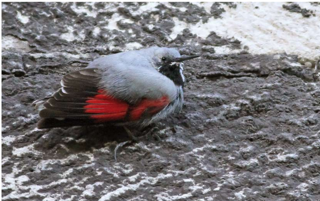
250 Wallcreeper / Rotskruiper Tichodroma muraria , male, Basilique de Cointe, Liège, Liège, Belgium, 21 March 2014 ( Robin Gailly )