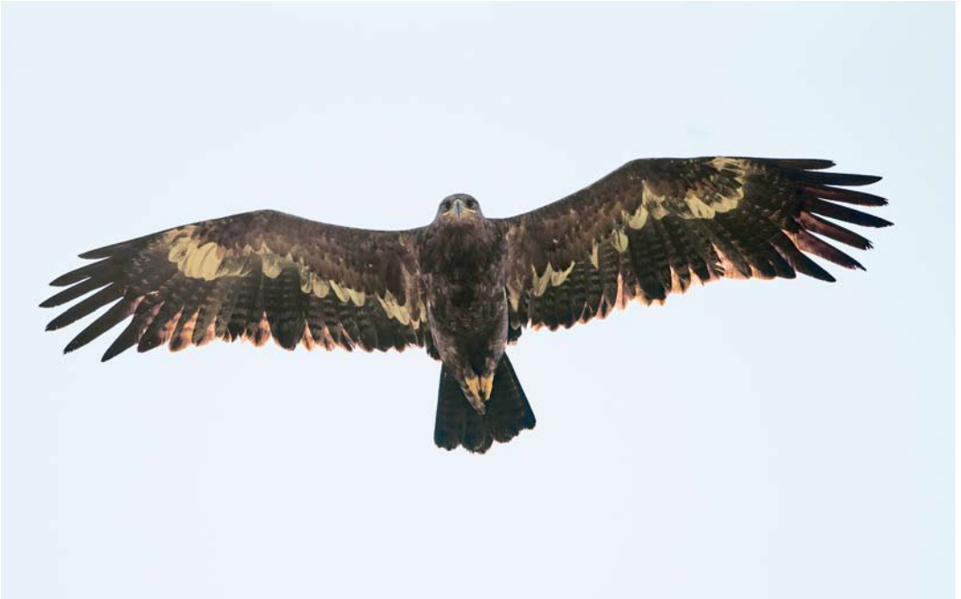
239 Steppe Eagle / Steppearend Aquila nipalensis, third calendar-year, Großkrut, Niederösterreich, Austria, 6 May 2014