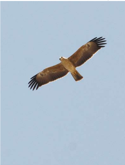
240-241 Wahlberg's Eagle / Wahlbergs Arend Aquila wahlbergi , juvenile, Ras Shuqeir, Eastern Desert, Egypt, 3 May 2013 (Ahmed Waheed)