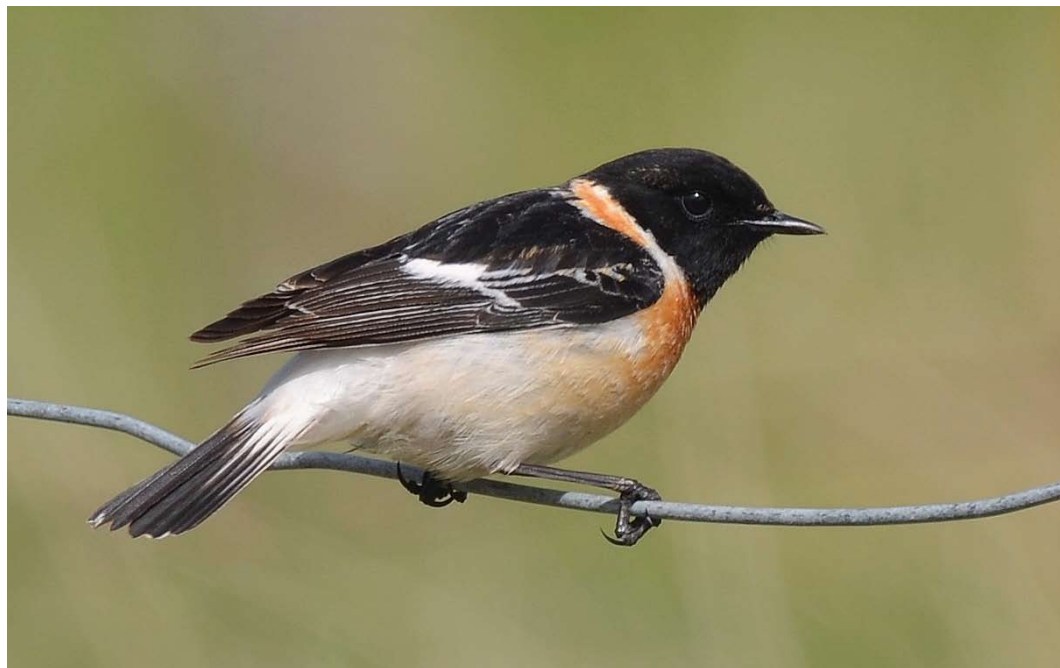
262 Caspian Stonechat / Kaspische Roodborsttapuit Saxicola maurus hemprichii , adult male, Fair Isle, Shetland, Scotland, 30 April 2014