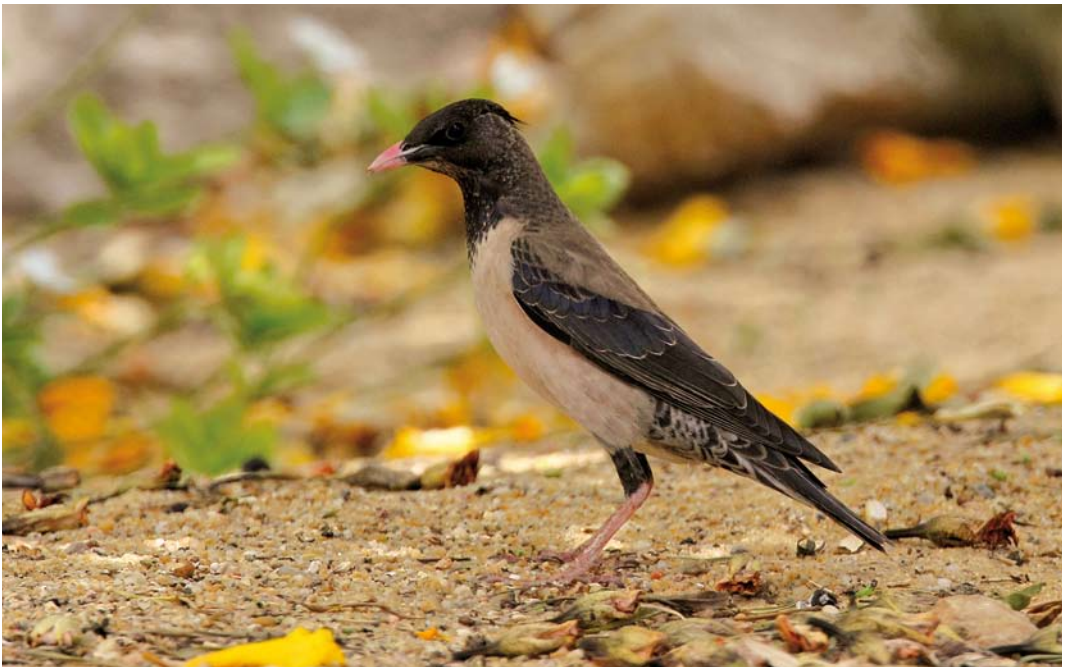
265 Rosy Starling / Roze Spreeuw Pastor roseus , second calendar-year male, El Gouna, Egypt, 7 May 2014 (Edwin Winkel)