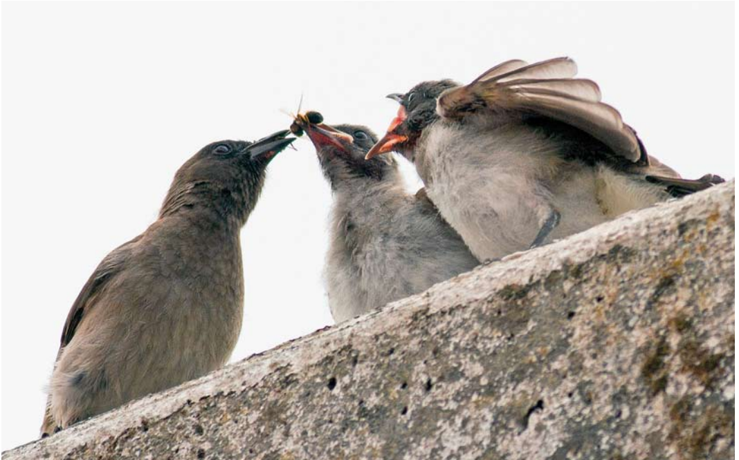
248 Common Bulbuls / Grauwe Buulbuuls Pycnonotus barbatus , adult and three young, Tarifa, Cádiz, Spain, 20 April 2014