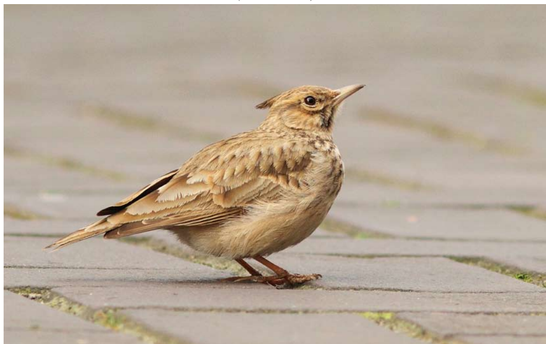
280 Kuifleeuwerik / Crested Lark Galerida cristata , Haverleij, 's-Hertogenbosch, Noord-Brabant, 5 april 2014 (Roland Wantia)