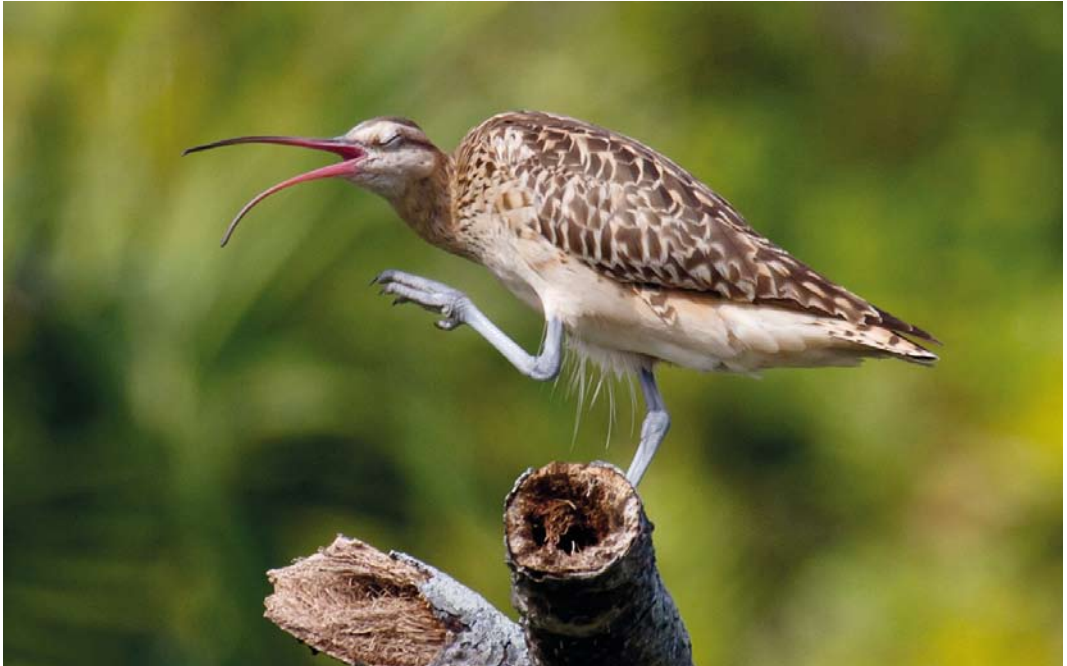
221 Bristle-thighed Curlew / Zuidzeewulp Numenius tahitiensis , second calendar-year, Henderson Island, Pitcairn Islands, 7 September 2013 (Steve N G Howell). Note overall fresh plumage (cf plate 215-216 showing adult-type birds) but retained juvenile outermost primary.

to see in the field but surprisingly easy on photographs.