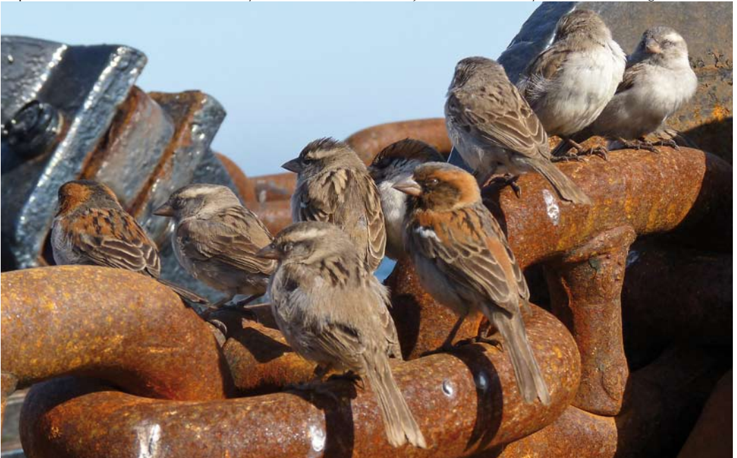
199 Iago Sparrows / Kaapverdische Mussen Passer iagoensis , on board of MV Plancius , Atlantic Ocean between Cape Verde Islands and Desertas, 8 May 2013. Note aberrantly coloured male right of centre.