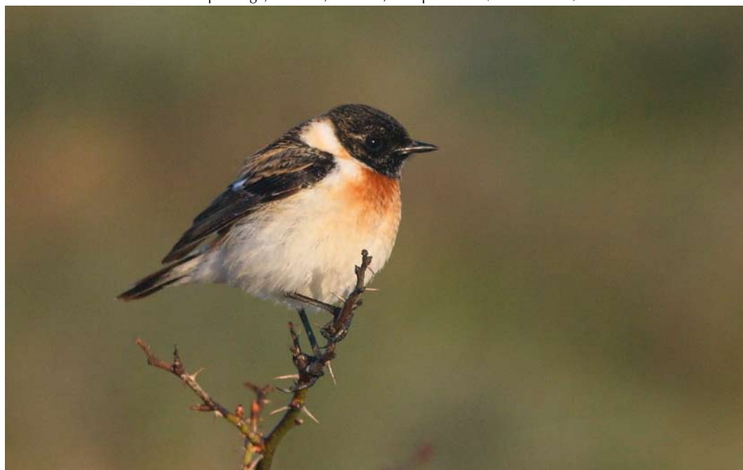
263 Caspian Stonechat / Kaspische Roodborsttapuit Saxicola maurus hemprichii , second calendar-year male, Morups Tånge, Halland, Sweden, 16 April 2014