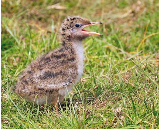
180 Gull-billed Tern / Lachstern Gelochelidon nilotica , chick, Neufelderkoog, Schleswig-Holstein, Germany, 28 June 2012 (Sebastian Conradt)