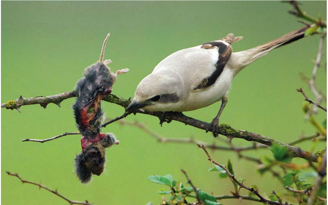
211 Steppeklapekster / Steppe Grey Shrike Lanius lahtora pallidirostris , Stuifdijk, Maasvlakte, Zuid-Holland, 30 april 2014 (Maurits Martens)

lange snavel, het zichtbare wit in de dekveren en de relatief lange snavel (korter en hoger bij Kleine). Het wit op de vleugel strekte zich niet (zichtbaar) uit tot op de armpennen, waarmee ook Homeyers Klapekster L. e. homeyeri kan worden uitgesloten. Op foto's van de vogel van de Maasvlakte is te zien zijn dat de vier buitenste armpennen een kleine langwerpige witte vlek op de binnenvlag hadden; dit was echter alleen bij een volledig gespreide vleugel te zien. Het wit is in deze veren bij Homeyers veel uitgebreider. Daarnaast bleken alle handpennen, grote dekveren en de meeste tertials oud en sterk verbleekt, waardoor er geen wit meer in deze veren zichtbaar was. Homeyers heeft bovendien een 'volledig' zwart masker, met donkere teugel en doorgaans een smalle witte wenkbrauwstreep.