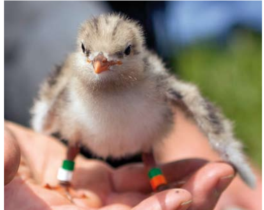
181 Gull-billed Tern / Lachstern Gelochelidon nilotica , chick ringed with colour-rings, Neufelderkoog, Schleswig-Holstein, Germany, 28 June 2012

koog-Vorland in Schleswig-Holstein. The c 40 breeding pairs prefer places grazed in spring by migrating Barnacle Goose Branta leucopsis . These short, open salt meadows are also traditionally grazed by sheep. The birds nest amidst c 2000 nests of Common Terns. The Gull-billed Terns are protected from intruders thanks to the aggressive behaviour of the Common Terns. In May, Gull-billed lay two to three eggs in a flat, bare scrape nest. After about three weeks the eggs hatch. The chicks fledge around mid-July. Usually, they start to breed when they are four to five years old (Bauer et al 2012). The breeding success in 1995-2012 strongly varied for each year but showed a strong overall decline (figure 3-4).