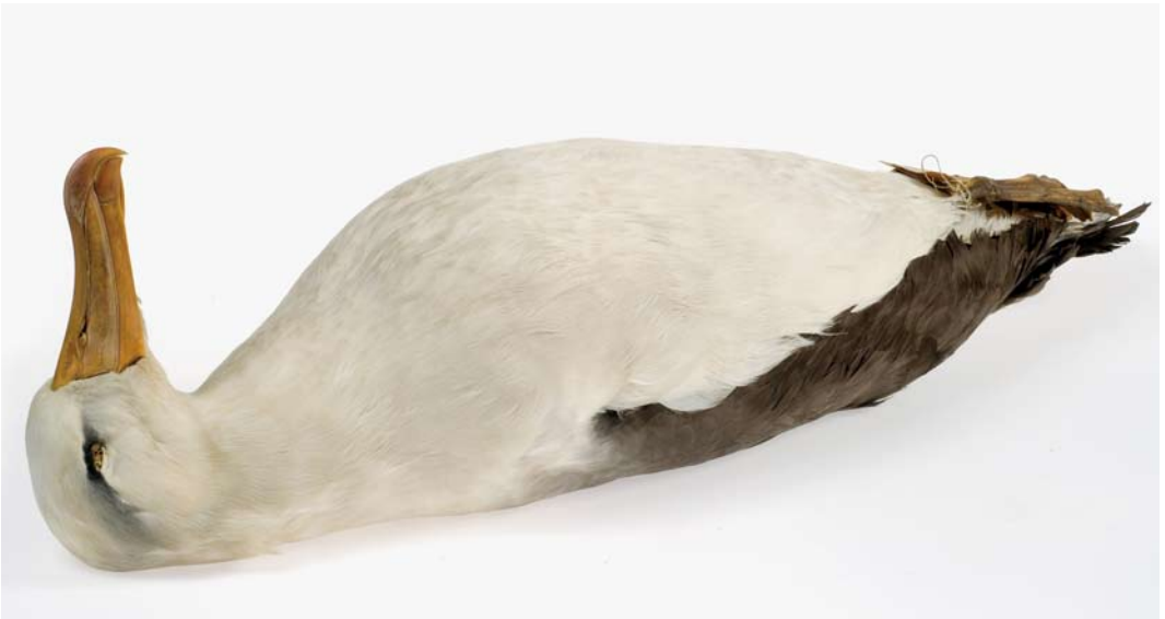
307 Black-browed Albatross / Wenkbrouwalbatros Thalassarche melanophris , adult female (collected on Mykines-hólmi, Mykines, Faeroes, on 11 May 1894), Zoological Museum, København, Denmark, 21 May 2008

Apart from Black-browed Albatross, three other albatross species have been recorded in the WP, but in much smaller numbers (cf Haas 2012). Atlantic Yellow-nosed Albatross T chlororhynchos has been recorded in England (June-July 2007), Faeroes (July 2012), Norway (April 1994 and June-July 2007) and Sweden (July 2007, considered same individual as in England; Gantlett & Pym 2007). Shy Albatross T cauta has been recorded once, in February-March 1981 (bird staying off the coast of Sinai,