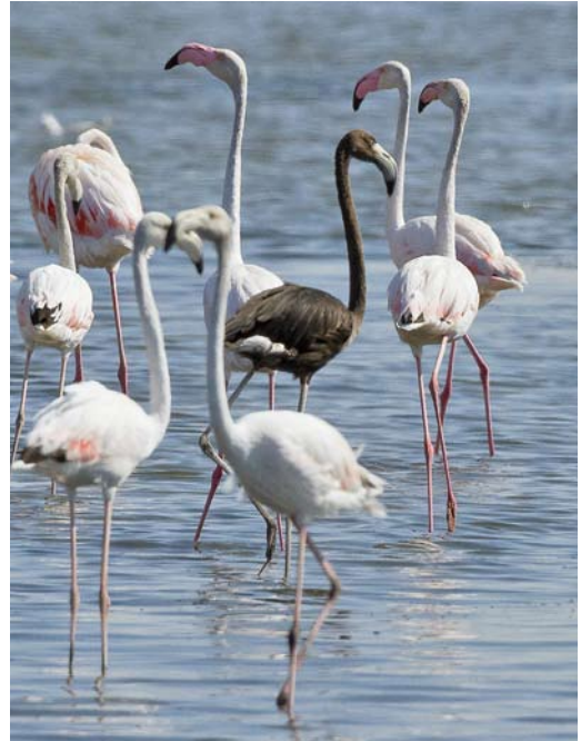
310 Melanistic Greater Flamingo / melanistische Flamingo Phoenicopterus roseus , with normally coloured individuals, Eilat, Israel, 8 August 2013

case much less dark and less extensive than in this bird. Between October 2012 and early 2014, the bird underwent moult but its features hardly changed (if at all). This indicates that the dark plumage was not caused by external factors, such as staining (dirt or oil), but was an intrinsic character of this individual. The dark colour was therefore probably caused by melanism (cf van Grouw 2006, 2013). Whether it was a hereditary type of melanism (by mutation) is hard to tell. This is most likely the case but melanism can also be caused by a shortage of vitamin D or other physical deformities (Hein van Grouw in litt).