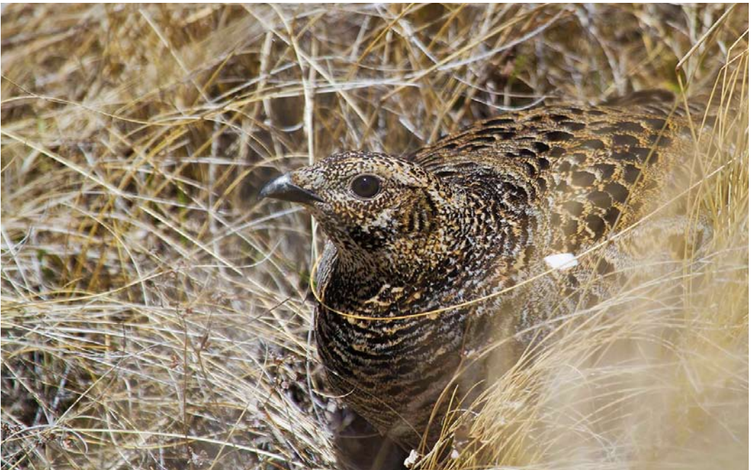
343 Caucasian Grouse / Kaukasisch Korhoen Tetrao mlokosiewiczi, female, Kazbegi, Georgia, 30 April 2014