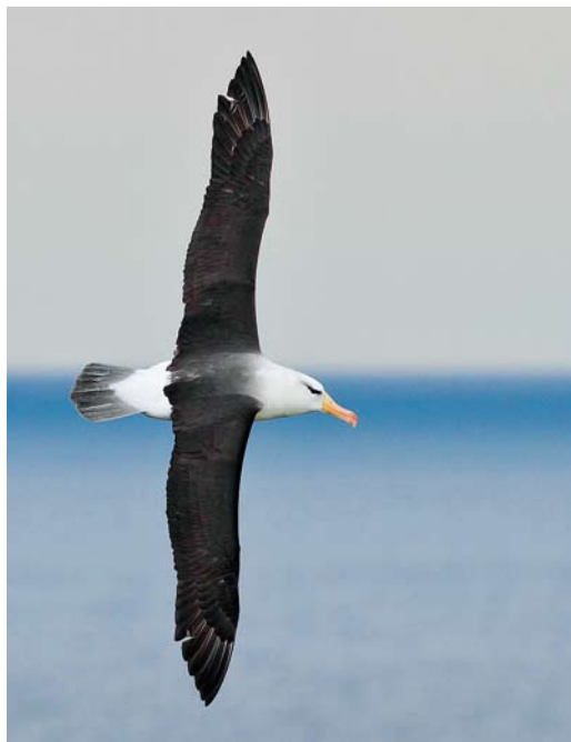
295 Black-browed Albatross / Wenkbrauwalbatros Thalassarche melanophris , adult, Helgoland, Schleswig-Holstein, Germany, 28 May 2014 296 Black-browed Albatross / Wenkbrauwalbatros Thalassarche melanophris , adult, Helgoland, Schleswig-Holstein, Germany, 5 June 2014 297 Black-browed Albatross / Wenkbrauwalbatros Thalassarche melanophris , adult, Helgoland, Schleswig-Holstein, Germany, 12 June 2014