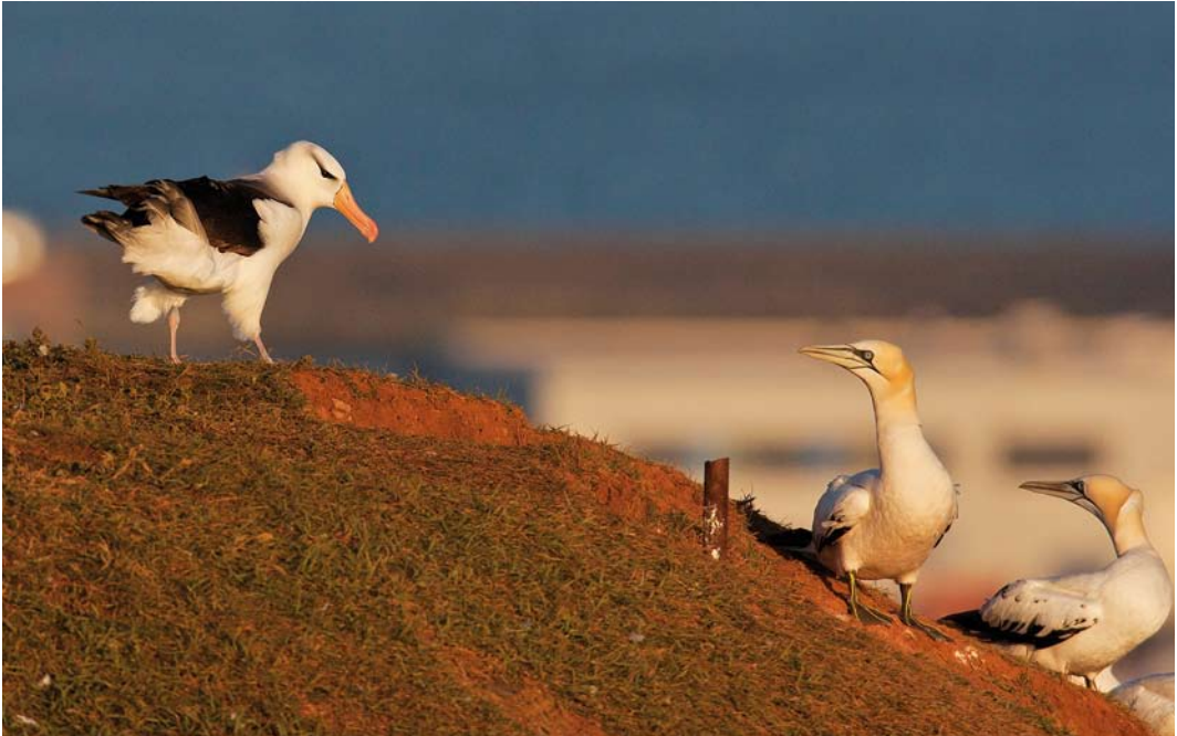
341 Black-browed Albatross / Wenkbrauwalbatros Thalassarche melanophris , adult, with Northern Gannets / Jan-van-gegenten Morus bassanus , Helgoland, Schleswig-Holstein, Germany, 12 June 2014

there was also a rapid increase to 21-24 pairs, raising 15 young in 2013 (Dansk Ornithol Foren Tidsskr 108: 157-163, 2014). The first nesting of the species for England was in 1979 in Norfolk, where the numbers gradually increased since, while recent nesting in western England relates to (re)introductions. In the Netherlands, where the species bred for the first time in 2001, 44 wild-origin individuals were present since March at Fochteloërveen, Drenthe/Friesland, including nine pairs of which six successfully raised young.