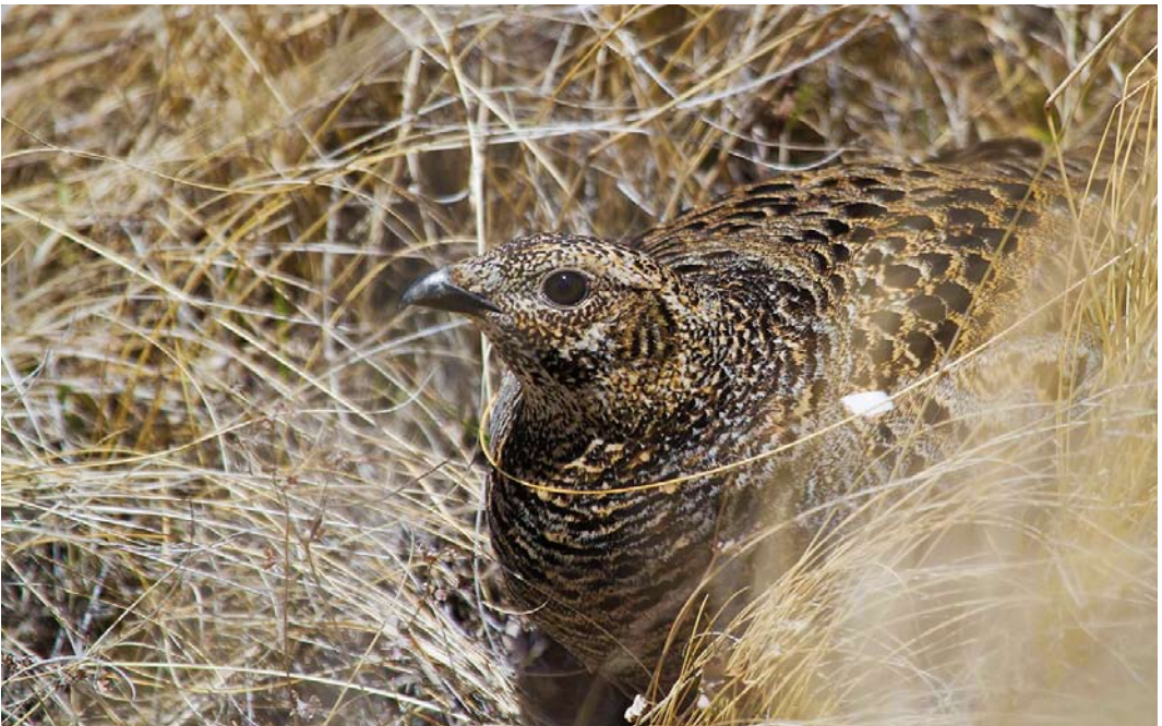
343 Caucasian Grouse / Kaukasisch Korhoen Tetrao mlokosiewiczi, female, Kazbegi, Georgia, 30 April 2014