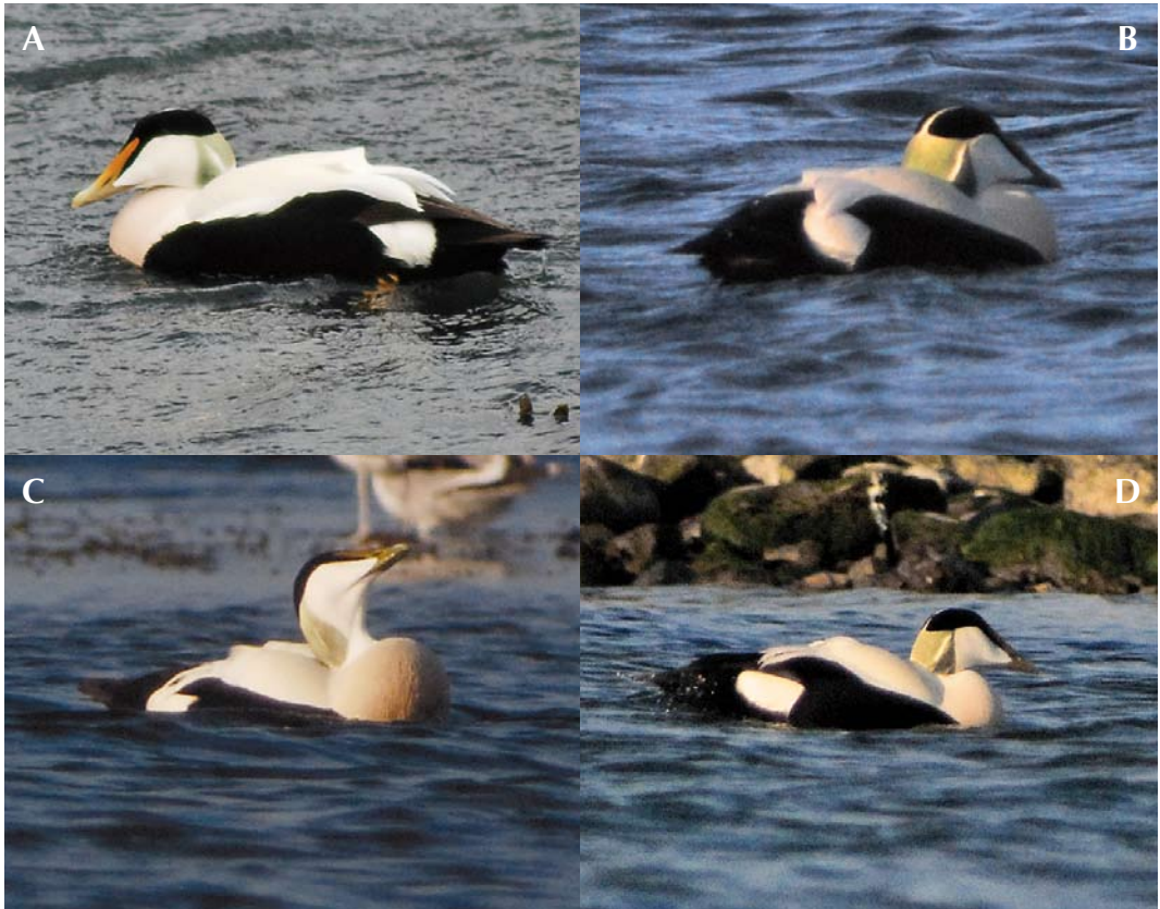
FIGURE 4 Common Eiders / Eiders Somateria mollissima , males. A S m borealis , Iceland, 29 April 2007 (Alexander Hellquist); B-D three different displaying S m mollissima , Gotland, Sweden, 17 April 2012 ( B ) and 28 April 2012 ( C-D ), respectively (Alexander Hellquist). As birds in 4B and 4C show, sails of mollissima may be similar to those of borealis . However, normally they appear as subtle rounded protrusions, as in 4D. Note differences in head shape and straight demarcation between cap and face in borealis .

figure 4). Among Baltic birds, this mostly happens during display but sometimes also in other times of the year, perhaps with a slightly higher frequency in early autumn when the scapulars are newly moulted. Borealis normally show prominent sails throughout the whole year.