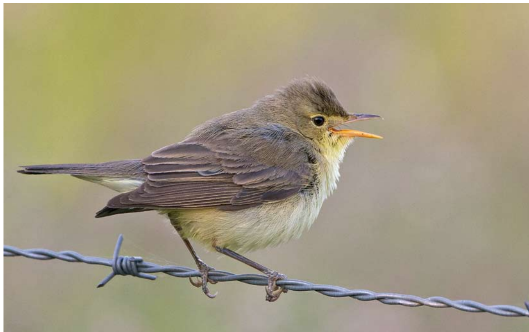
382 Orpheusspotvogel / Melodious Warbler Hippolais polyglotta , Ospel, Limburg, 30 mei 2014 (Co van der Wardt)