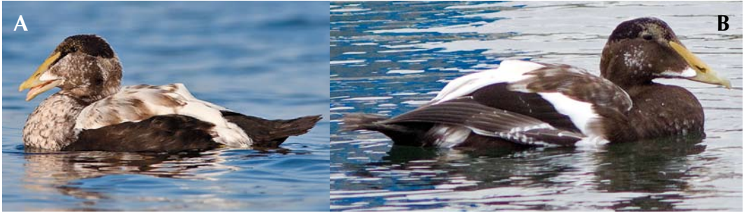
FIGURE 6 Common Eiders / Eiders Somateria mollissima . A presumed S m mollissima , second calendar-year male, east coast, Sweden, 20 October 2009; B presumed mollissima , adult male, west coast, Sweden, 12 September 2013. Sails and to some extent bill colour bring borealis to mind but are within variation of mollissima . Position of nostril fits mollissima better, as does forehead shape. Bird in 6A is in eclipse plumage, not uncommon in males that linger along Swedish coasts in late October. Bird in 6B illustrates how challenging identification can be. It held its sails erect most of the time over period of several weeks. Furthermore, in some photographs, outer webs appear to have pointed tips.

when looking at forehead shape, with birds from the Baltic/Wadden Sea flyway population being most distinct from borealis in this respect. Depending on which features are more important as isolating factors, the definition of the subspecies might deserve further exploration, given also that the genetic relationships need clarification.