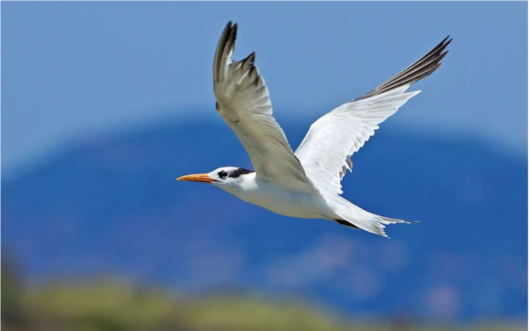
335 Royal Tern / Koningsstern Sterna maxima , second-year, Hyères, Var, France, 3 June 2014