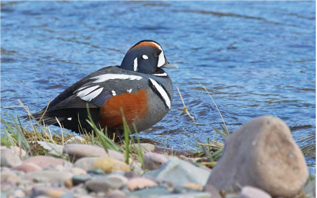
342 Harlequin Duck / Harlekijneend Histrionicus histrionicus , adult male, Sandfjord, Varanger, Finnmark, Norway, 16 June 2014