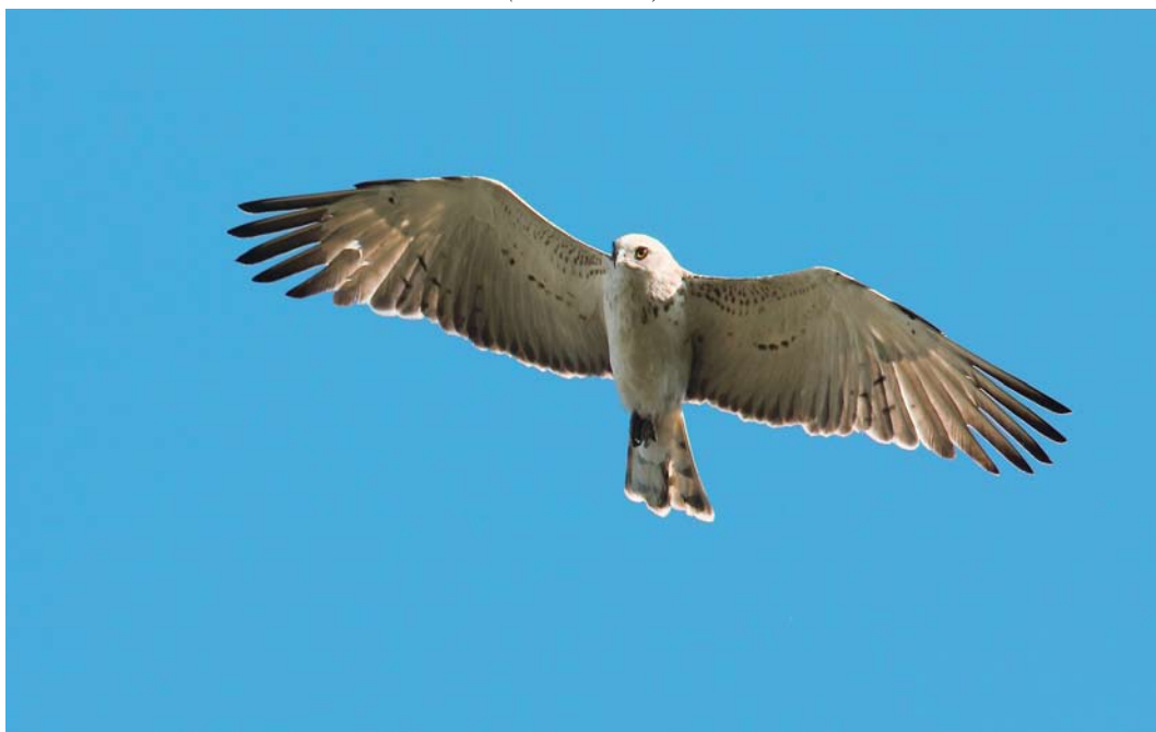
364 Slangenarend / Short-toed Snake Eagle Circaetus gallicus , Holterberg, Overijssel, 8 juni 2014 ( Edwin Winkel )