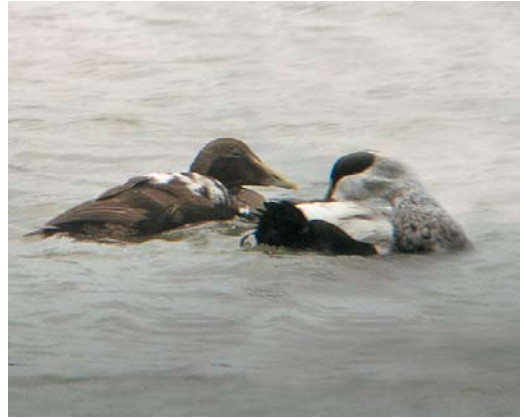
291 Common Eiders / Eiders Somateria mollissima , males. Top: S m borealis , collected in Svalbard; bottom: S m mollissima , collected in Sweden. Upper specimen has 2 mm overlap between nostril and bill base feathering. Any bird showing less overlap is outside range of nominate mollissima in samples studied and likely to be borealis . Lower specimen has 7 mm overlap. Any bird with same or larger overlap is outside range of borealis in samples studied and most likely to be nominate mollissima . 292 Common Eiders / Eiders Somateria mollissima mollissima , first calendar-year male (left) and older male, southern Sweden, 24 December 2012. Note small sails in first calendar-year male. Older male still shows traces of eclipse plumage.

Birds from mainland Scotland and Hebrides have slightly smaller measurements than other mollissima , and in Orkney and Shetland the measurement is clearly smaller. The pattern can be interpreted as gradual introgression between mollissima and faeroeensis , given also that birds from Shetland and Orkney are intermediate in size (see below). It is, however, conceivable that the shorter measurements in birds from mainland Scotland and the Hebrides are caused by the presence of pure faeroeensis (or borealis ) specimens in the sample, or (perhaps less likely) geographical variation in British mollissima . Larger samples would be needed for safe conclusions.