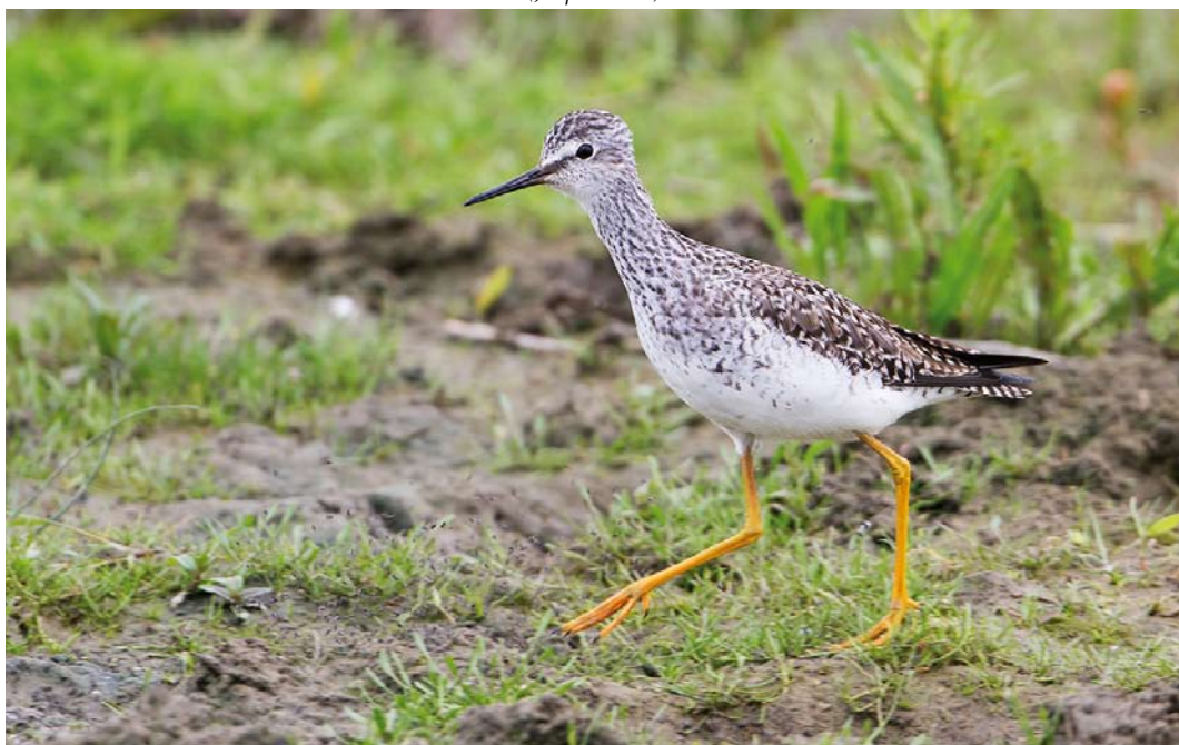
369 Kleine Geelpootruiter / Lesser Yellowlegs Tringa flavipes , zomerkleed, Ezumakeeg, Friesland, 9 juni 2014 (Jaap Denee)