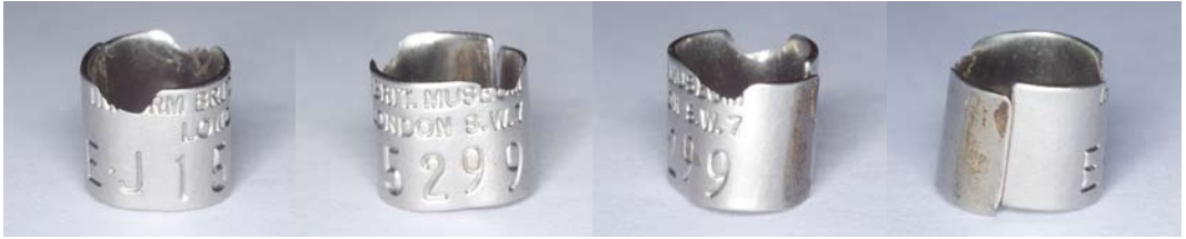
FIGURE 1 Incoloy ring London EJ15299 of Black-headed Gull Larus ridibundus , 32 years, 4 months and 9 days after ringing on tarsus (Date Lutterlo). Found dead on Griend, Friesland, Netherlands, on 21 May 2012.

1980. It was thus born in 1979 but the place of birth and the precise date of birth are unknown. The bird had reached an age of 33 years when it died. Currently, this individual is the oldest known Black-headed Gull (cf van Dijk et al 2012).