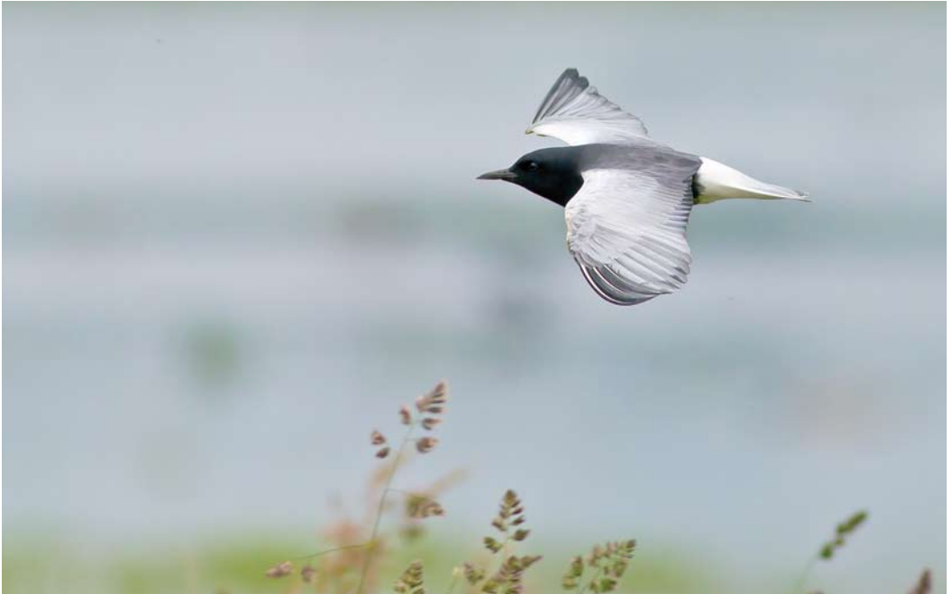
379 Witvleugelstern / White-winged Tern Chlidonias leucopterus , adult, Zuidlaardermeer-Oostpolder, Groningen, 1 juni 2014 ( Sander Bot ) 380 Zwarte Ooievaar / Black Stork Ciconia nigra , tweede-kalenderjaar, De Cocksdorp, Texel, Noord-Holland, 17 mei 2014 ( René Pop ) 381 Witvleugelsterns / White-winged Terns Chlidonias leucopterus , adult en twee jongen, Zuidlaardermeer-Oostpolder, Groningen, 12 juli 2014 ( Jan den Hertog )