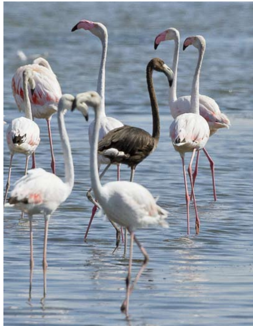
310 Melanistic Greater Flamingo / melanistische Flamingo Phoenicopterus roseus , with normally coloured individuals, Eilat, Israel, 8 August 2013

case much less dark and less extensive than in this bird. Between October 2012 and early 2014, the bird underwent moult but its features hardly changed (if at all). This indicates that the dark plumage was not caused by external factors, such as staining (dirt or oil), but was an intrinsic character of this individual. The dark colour was therefore probably caused by melanism (cf van Grouw 2006, 2013). Whether it was a hereditary type of melanism (by mutation) is hard to tell. This is most likely the case but melanism can also be caused by a shortage of vitamin D or other physical deformities (Hein van Grouw in litt).