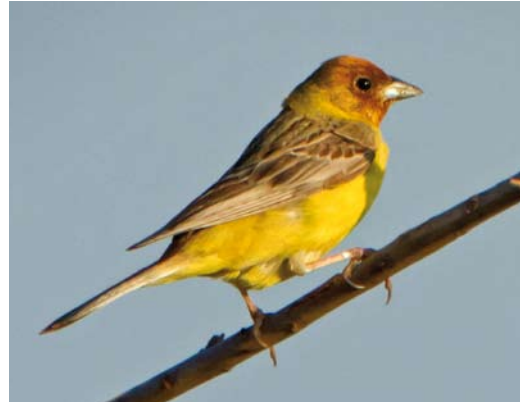
356 Red-headed Bunting / Bruinkopgors Emberiza bruniceps , male, Westkapelle, Zeeland, Netherlands, 24 July 2014

354, plate 454, 2013). A Sardinian Warbler S melanocephala turned up on Rott, Rogaland, Norway, on 11 July. An Asian Common Whitethroat S communis icterops/rubicola was trapped on Blåvand, Ribe, Denmark, on 4 June. Between 28 June and 21 July, at least 10 Lanceolated Warblers Locustella lanceolata were singing in Finland. A Saharan Olivaceous Warbler Iduna pallida reiseri photographed at Barranco de la Torre on 14 June was the first for the Canary Islands. From mid-May, an influx of Blyth's Reed Warbler A dumetorum occurred in north-western Europe, with record numbers of singing males in, eg, Britain (c 20), Denmark (16), Germany and the Netherlands (five; the earliest ever) and also one in France (in Meurthe-et-Moselle on 8-15 June). The first for Romania was trapped at Sfântu Gheorghe, Danube delta, on 23 May. DNA analyses of 348 Eurasian Reed Warblers A scirpaceus trapped for ringing in Germany showed that one was a Caspian Reed Warbler A s fuscus , the first evidence of this Asian subspecies in Central Europe (see Arabi et al 2014, Ibis Early Online: http://tinyurl.com/not5np9 ); moreover, DNA sequences demonstrated that no less than 6.8% of Eurasian Reed were misidentified at the species level, Marsh Warbler A palustris accounting for most of the misidentified birds.