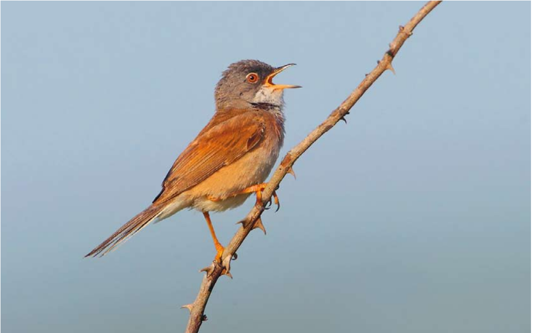
352 Spectacled Warbler / Brilgrasmus Sylvia perspicillata , male, Burnham Overy, Norfolk, England, 8 June 2014