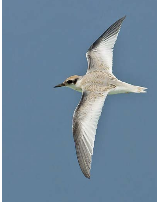
344 Saunders's Tern / Saunders' Dwergstern Sternula saundersi , adult, Ras Sudr, Sinai, Egypt, 5 July 2014 ( Kris De Rouck ) 345 Saunders's Tern / Saunders' Dwergstern Sternula saundersi , juvenile, Ras Sudr, Sinai, Egypt, 6 July 2014 ( Kris De Rouck ) 346 White-backed Vulture / Witruggier Gyps africanus (left), Rüppell's Vulture / Rüppells Gier G. rueppelli (centre) and Griffon Vulture / Vale Gier G. fulvus , Tétouan, High Rif, Morocco, 25 May 2014 ( Rachid El Khamlichi ) cf Dutch Birding 36: 200, 2014