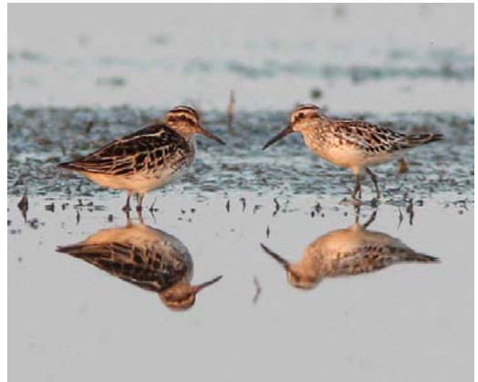
370-371 Dunbekmeeuw / Slender-billed Gull Chroicocephalus genei , De Kreupel, Noord-Holland, 25 mei 2014 372 IJseenden / Long-tailed Ducks Clangula hyemalis , Klinkenbergerplas, Oegstgeest, Zuid-Holland, 21 juni 2014 373 Breedbekstrandlopers / Broad-billed Sandpipers Calidris falcinellus , zomerkleed, Eemnes, Utrecht, 19 mei 2014

Zoutkamp, Groningen, en Meeden, Groningen; op 17 mei op Ameland; en op 6 juni bij Wilhelminadorp, Zeeland. Daarnaast was er een vondst van een verkeersslachtoffer op 18 mei bij Sellingen, Groningen, en was op ten minste één plaats een zingende vogel voor langere tijd aanwezig. Er werden weer volop Bijeneters Merops apiaster gemeld. In mei ging het om c 70 vogels, met als grootste groep acht op 16 mei langs Katwijk, Zuid-Holland. In juni volgden er nog eens 13. Een mannetje Amerikaanse Torenavalk F sparverius trok op 19 mei in noordoostelijke richting over de noordpunt van Texel; indien aanvaard betreft dit een nieuwe soort voor Nederland. Een valk die op 26 maart dood werd gevonden bij Dirksland, Zuid-Holland, werd aan de hand van de ring (Reykjavík 577085) gedetermineerd als IJslands Smelleken F c subaeson ; hij bleek op 16 juli 2012 als nestjong te zijn geringd bij Hundastapi, Vesturland, IJsland.