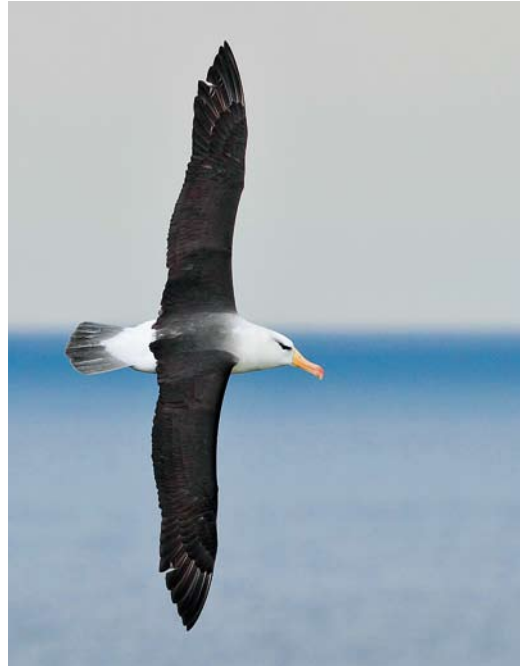
295 Black-browed Albatross / Wenkbrauwalbatros Thalassarche melanophris , adult, Helgoland, Schleswig-Holstein, Germany, 28 May 2014 296 Black-browed Albatross / Wenkbrauwalbatros Thalassarche melanophris , adult, Helgoland, Schleswig-Holstein, Germany, 5 June 2014 297 Black-browed Albatross / Wenkbrauwalbatros Thalassarche melanophris , adult, Helgoland, Schleswig-Holstein, Germany, 12 June 2014