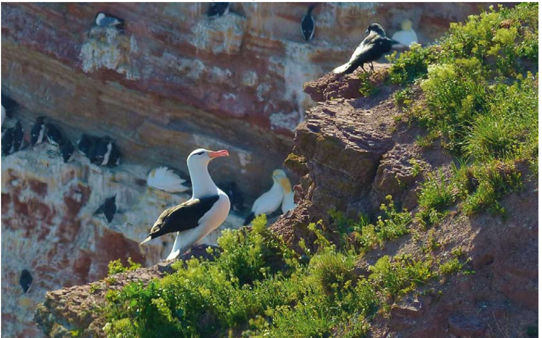
299 Black-browed Albatross / Wenkbrauwalbatros Thalassarche melanophris , adult, Helgoland, Schleswig-Holstein, Germany, 29 May 2014 (Felix Jachmann)