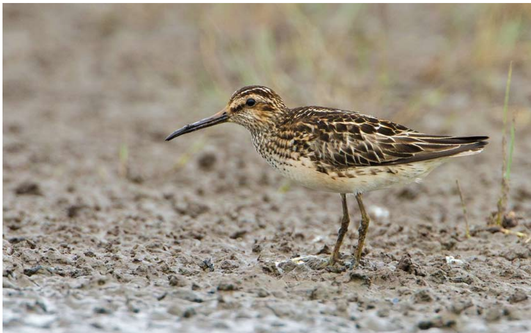
368 Breedbekstrandloper / Broad-billed Sandpiper Calidris falcinellus , zomerkleed, Terschellinger Polder, Terschelling, Friesland, 22 juni 2014