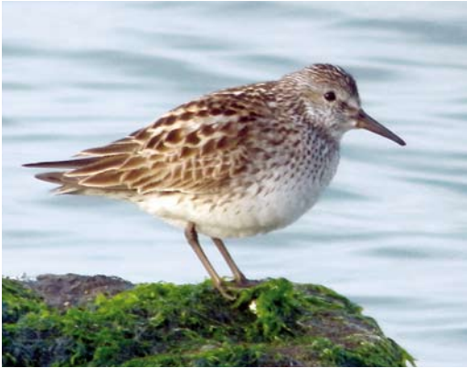
355 White-rumped Sandpiper / Bonapartes Strandloper Calidris fuscicollis , summer plumage, Świnoujście, Cispomerania, Poland, 14 July 2014 (Zbigniew Kajzer)