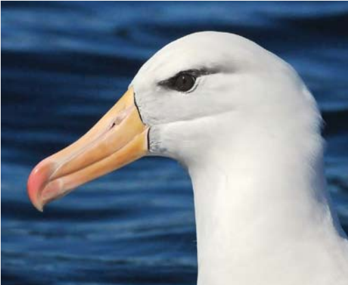
303 Black-browed Albatross / Wenkbrowwalbatros Thalassarche melanophris , adult, off Wollongong, New South Wales, Australia, 25 August 2013 (Roef Mulder)