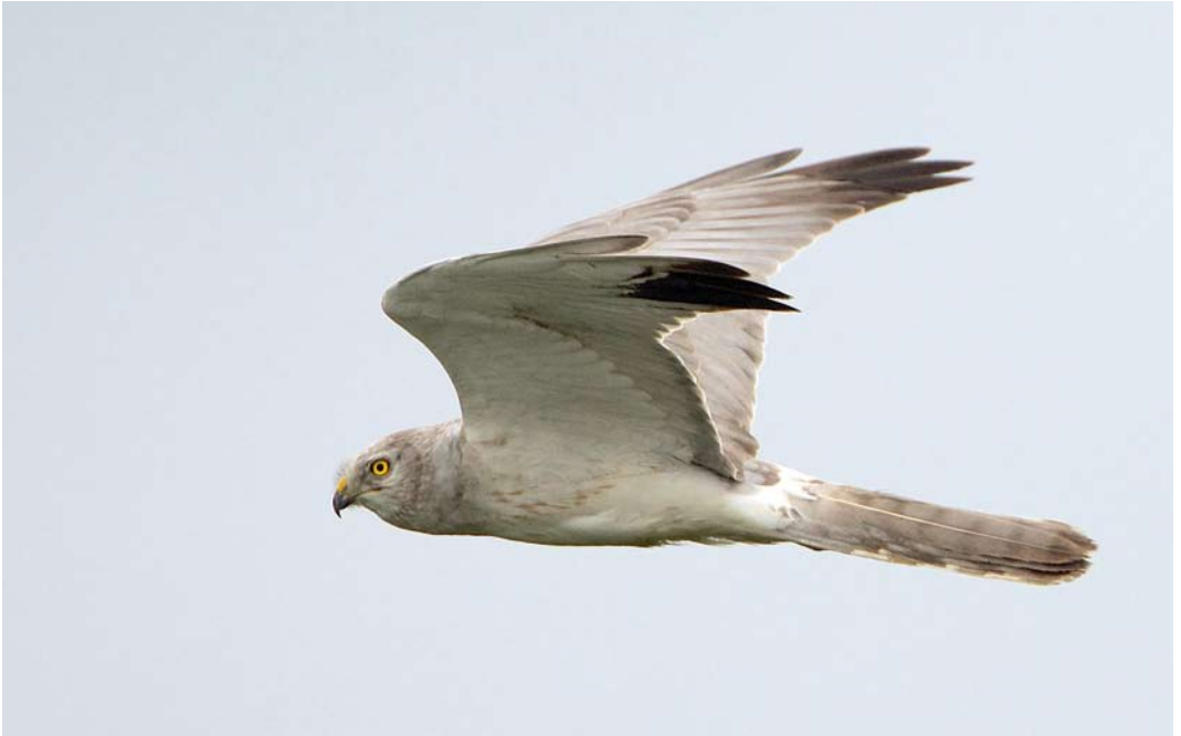
361-362 Stepekiekendief / Pallid Harrier Circus macrourus , subadult mannetje, Finsterwolde, Groningen, 9 mei 2014 ( Martin van der Schalk )