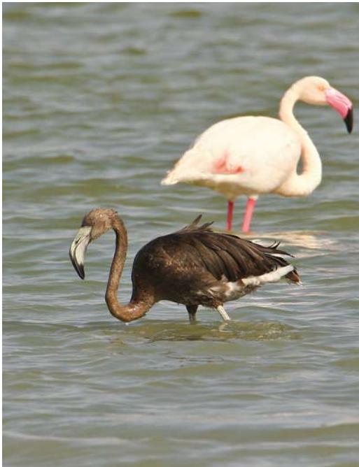
309 Melanistic Greater Flamingo / melanistische Flamingo Phoenicopterus roseus , with normally coloured individual, Eilat, Israel, 26 March 2013