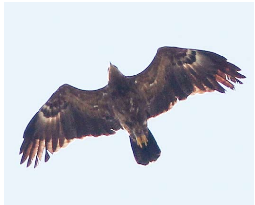
374 Vale Gieren / Griffon Vultures Gyps fulvus , Korendijkse Slikken, Zuid-Holland, 7 juni 2014 ( Martin van der Schalk ) 375 Amerikaanse Torenvalk / American Kestrel Falco sparverius , mannetje, Texel, Noord-Holland, 19 mei 2014 ( Willem Hartholt ) 376 Schreeuwardend / Lesser Spotted Eagle Aquila pomarina , vierde kalenderjaar, Losser, Overijssel, 8 juni 2014 ( Wim van der Woning )

duinen bij Bloemendaal; op 10 mei nabij de Punt van Reide, Groningen; op 13 mei langs telpost Noordkaap; op 19 mei bij Raamsdonk, Noord-Brabant; en op 28 juni bij Amerongen, Utrecht. Grauwe Fitissen Phylloscopus trochiloides zongen op 28 mei bij het dorp en 30 mei bij Lange Paal op Vlieland; van 8 tot 26 juni op Schiermonnikoog, Friesland; op 12 juni bij Hargen, Noord-Holland; en op 13 en 14 juni in het dorp op Vlieland. Een roepende Bergfluiter P. bonelli bevond zich van 7 tot 10 juni op Schiermonnikoog. Een late Siberische Tjiftjaf P. tristis zong op 29 mei bij IJmuiden. Een Zwartkop Sylvia atricapilla die op 25 augustus 2013 bij Overdinkel, Overijssel, werd geringd werd op 18 en 19 mei teruggevangen bij Jeruzalem in Israël: een hoogst opmerkelijke trekrichting voor deze soort. Krekelzangers Locustella fluviatilis zongen op 17 mei en op 12 juni in de Millingerwaard bij Kekerdom, Gelderland; van 22 mei tot 4 juni bij Biddinghuizen, Flevoland; van 25 tot 31 mei bij Dordrecht; van 30 mei tot ten minste