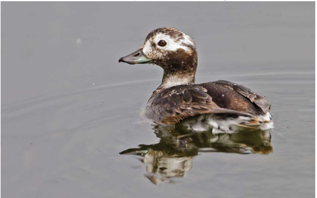
358 IJseend / Long-tailed Duck Clangula hyemalis , onvolwassen vrouwtje, Klinkenbergerplas, Oegstgeest, Zuid-Holland, 21 juni 2014