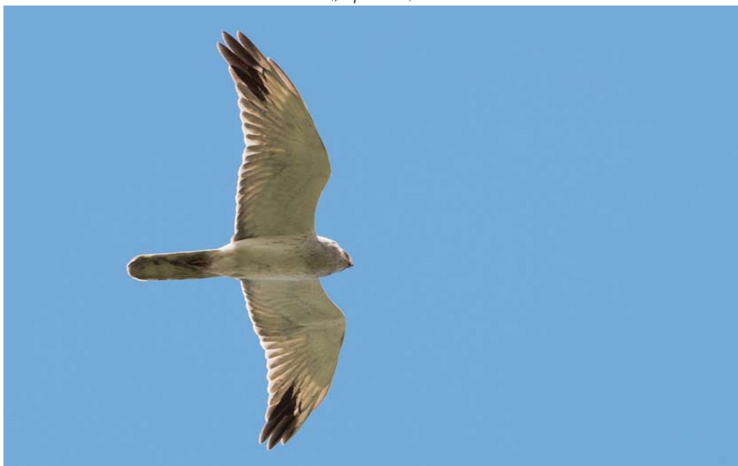
360 Steppekiekendief / Pallid Harrier Circus macrourus , subadult mannetje, Finsterwolde, Groningen, 16 mei 2014