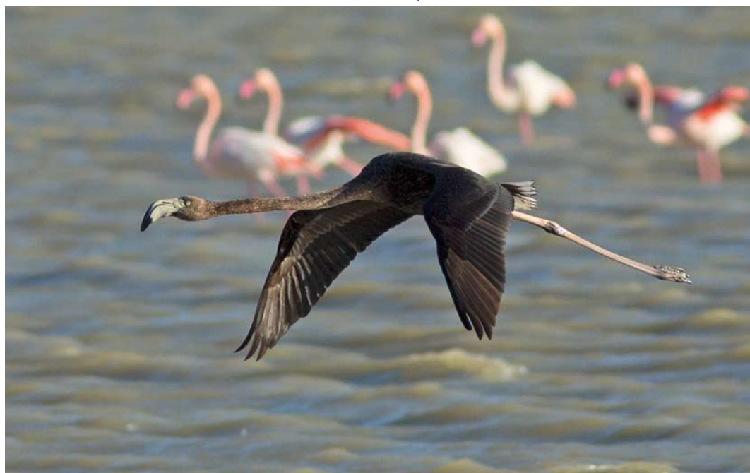
308 Melanistic Greater Flamingo / melanistische Flamingo Phoenicopterus roseus , with normally coloured individuals, Eilat, Israel, 12 February 2014 (Amir Ben Dov)

The greyish colour of the bill and legs suggests that it was an immature bird but some features, like the yellowish brown eyes, do not concur with that (Cramp 1977). When first seen (October 2012), the eyes appeared brown, so the bird was most likely an immature then. Normally at this age, Greater Flamingos show darker plumage than adult birds, until approximately three years of age (del Hoyo et al 1992). However, in immature flamingos, the darker parts of the plumage are usually restricted to the flight-feathers, and in any