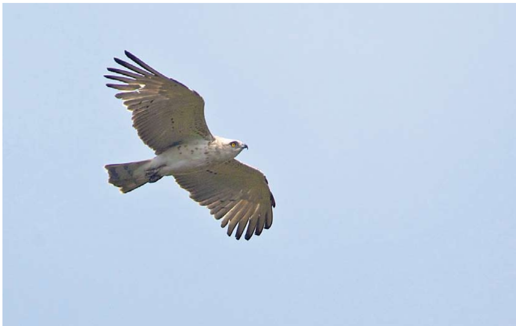
363 Slangenarend / Short-toed Snake Eagle Circaetus gallicus , Holterberg, Overijssel, 9 juni 2014 ( Martin van der Schalk )