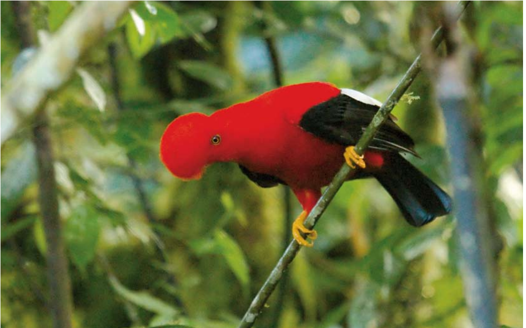
331-332 Andean Cock-of-the-rock / Rode Rotshaan Rupicola peruviana sanguinolentus male, Refugio Paz de las Aves, Pichincha, Ecuador, 13 July 2013 (Dušan M Brinkhuizen) 333 Andean Cock-of-the-rock / Rode Rotshaan Rupicola peruviana aequatorialis , female, Paquisha, Zamora-Chinchipe, Ecuador, 2 August 2013 (Dušan M Brinkhuizen)