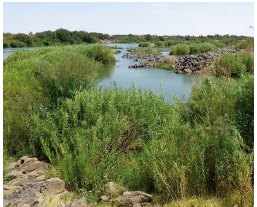
318 Phragmites islands at Third Cataract near Sabu, Sudan, 17 April 2013 ( Jens Hering ) 319 Phragmites islands at Third Cataract near Sabu, Sudan, 17 April 2013 ( Jens Hering ) 320-321 Clamorous Reed Warbler / Indische Karekiet Acrocephalus stentoreus stentoreus , Third Cataract near Sabu, Sudan, 17 April 2013 ( Jens Hering ) 322 Phragmites islands at Merowe dam, Sudan, 22 April 2013 ( Jens Hering )