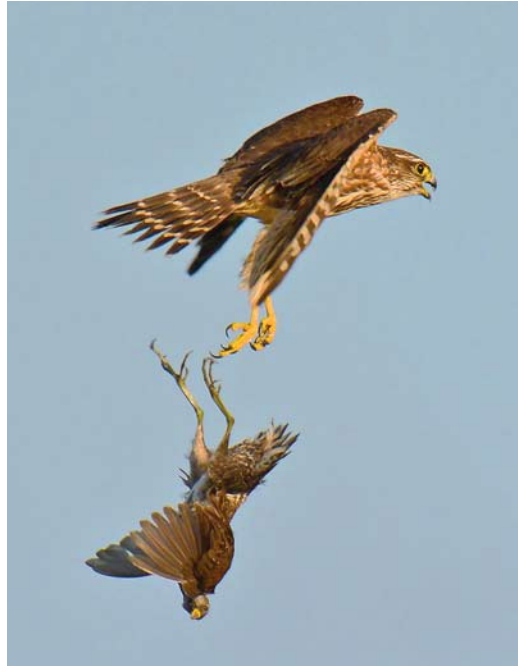
311 Least Bittern / Amerikaanse Woudaap Ixobrychus exilis , Bubali Bird Sanctuary, Aruba, 23 October 2013 ( Arnold Klaren ) 312 Merlin / Smelleken Falco columbarius , female, dropping Sora / Soraraal Porzana carolina , Bubali Bird Sanctuary, Aruba, 23 October 2013 ( Arnold Klaren ) 313 Wilson's Phalarope / Grote Franjepoot Phalaropus tricolor , Saliña Cerca, Aruba, 24 October 2013 ( Arnold Klaren )