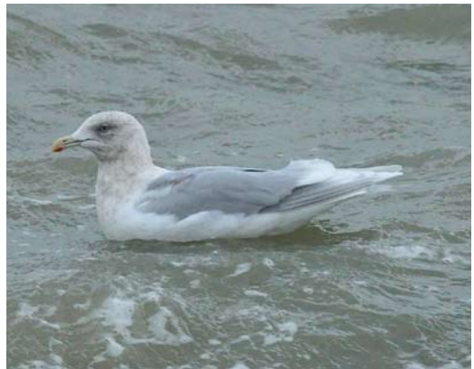
314-317 Kumliens Meeuw / Kumlien's Gull Larus glaucooides kumlieni , adult, Scheveningen, Den Haag, Zuid-Holland, 24 december 2013