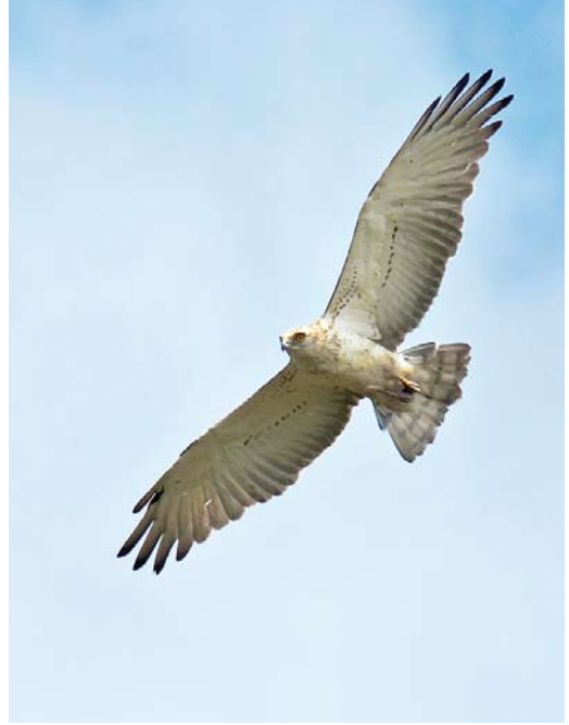
347 Short-toed Snake Eagle / Slangenarend Circaetus gallicus , Kalkense Meersen, Oost-Vlaanderen, Belgium, 19 July 2014 ( Kris De Rouck ) 348 Short-toed Snake Eagle / Slangenarend Circaetus gallicus , third calendar-year, Ashdown Forest, East Sussex, England, 18 June 2014 ( Steve Ashton ) 349 Short-toed Snake Eagle / Slangenarend Circaetus gallicus , third calendar-year, Pig Bush area, Hampshire, England, 1 July 2014 ( Alan Lewis )