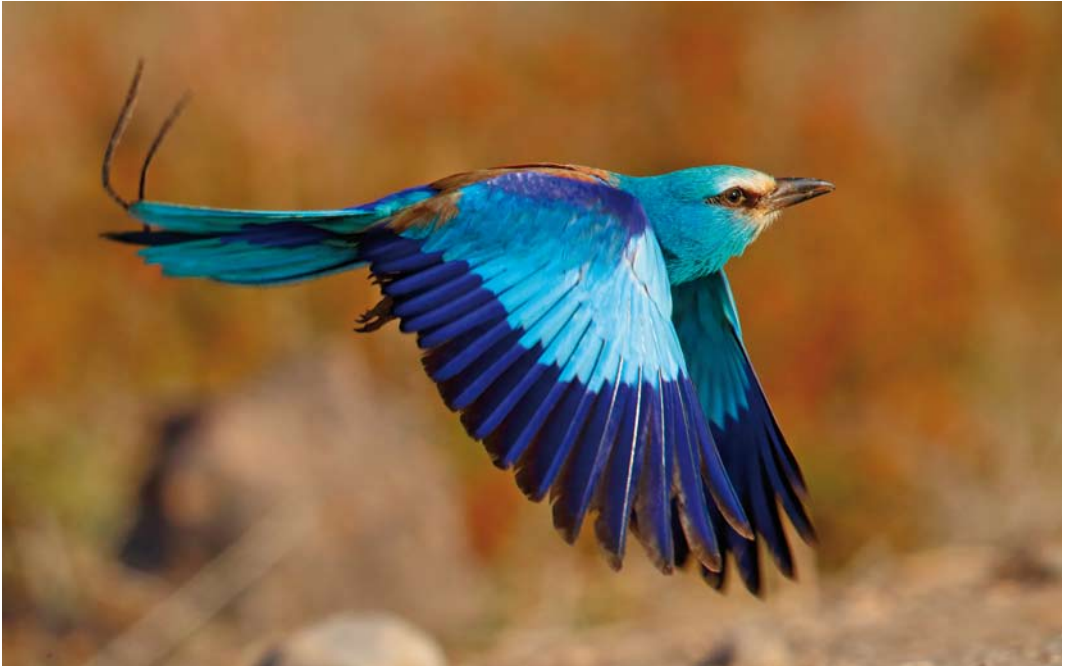
350 Abyssinian Roller / Sahelscharrelaar Coracias abyssinica , adult, Barranco de la Torre, Antigua, Fuerteventura, Canary Islands, 14 June 2014 ( Juan Sagardía )