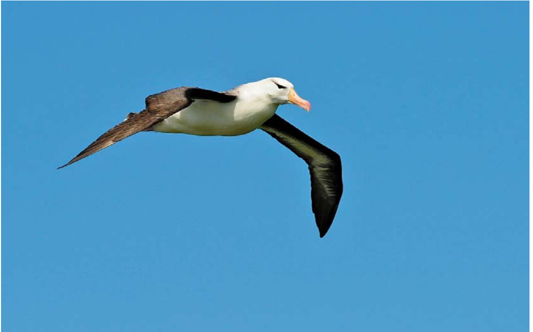
298 Black-browed Albatross / Wenkbrauwalbatros Thalassarche melanophris , adult, Helgoland, Schleswig-Holstein, Germany, 29 May 2014 (Roef Mulder)