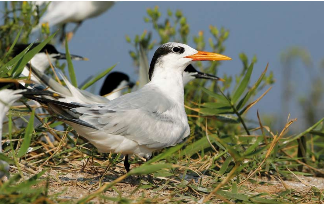
336 Royal Tern / Koningsstern Sterna maxima , second-year, Hyères, Var, France, 14 June 2014