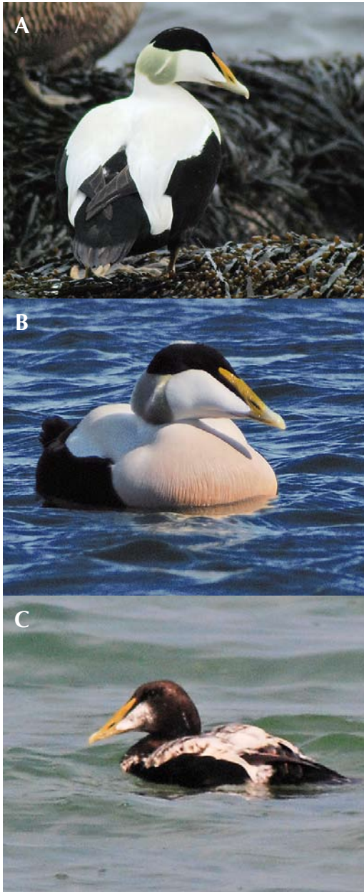
FIGURE 2 Common Eiders / Eiders Somateria mollissima , males. A S m borealis , Iceland, 29 April 2007 (Alexander Hellquist); B S m mollissima , Gotland, Sweden, 14 April 2012 (Alexander Hellquist); C presumed S m mollissima , Skåne, Sweden, 11 August 2007 (Alexander Hellquist). Note slightly more marked forehead in borealis . Bill colour of 2A and 2B is typical, whereas bird in 2C is on extreme yellow end for nominate mollissima .

Swedish birds could be explained by the fact that the former live in saltier water and therefore have larger salt glands – a difference that he could see also when studying skulls. The different forehead shape was a main reason why Brehm (1831) defined the Norwegian population as ' norvegica '. Based on photographs, Norwegian birds from the Oslo Fiord in the south, where the salinity is low, show a head shape similar to that of Baltic and Danish birds but, northwards along the North Sea coast, the forehead becomes increasingly prominent. British birds seem to be similar to birds of northern Norway but there is considerable individual variation and similar-looking birds occur in all populations.