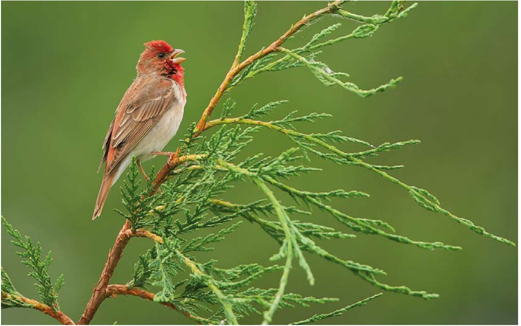
385 Roodmus / Common Rosefinch Erythrina erythrina , adult mannetje, Katwijk, Zuid-Holland, 26 mei 2014 386 Kleine Vliegenvanger / Red-breasted Flycatcher Ficedula parva , adult mannetje, Castricum, Noord-Holland, 2 juni 2014 387 Roodmus / Common Rosefinch Erythrina erythrina , adult mannetje, Dishoek, Zeeland, 30 mei 2014