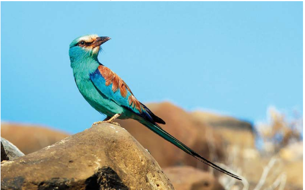
351 Abyssinian Roller / Sahelscharrelaar Coracias abyssinica , adult, Barranco de la Torre, Antigua, Fuerteventura, Canary Islands, 16 June 2014 ( David Pérez )