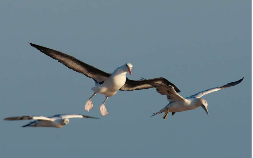
300 Black-browed Albatross / Wenkbrauwalbatros Thalassarche melanophris , adult, with Northern Gannets / Jan-vangenten Morus bassanus , Helgoland, Schleswig-Holstein, Germany, 12 June 2014 ( Felix Timmermann ) 301 Black-browed Albatross / Wenkbrauwalbatros Thalassarche melanophris , adult, Helgoland, Schleswig-Holstein, Germany, 12 June 2014 ( Felix Timmermann ) 302 Black-browed Albatross / Wenkbrauwalbatros Thalassarche melanophris , adult, Hirtshals, Nordjylland, Denmark, 18 July 2014 ( Søren Kristoffersen )