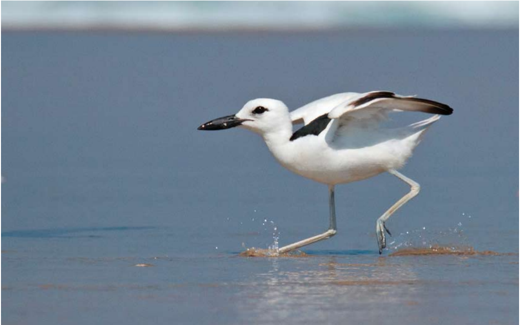
337-338 Crab Plover / Krabplevier Dromas ardeola , adult, Ma'agan Michael, Israel, 26 June 2014