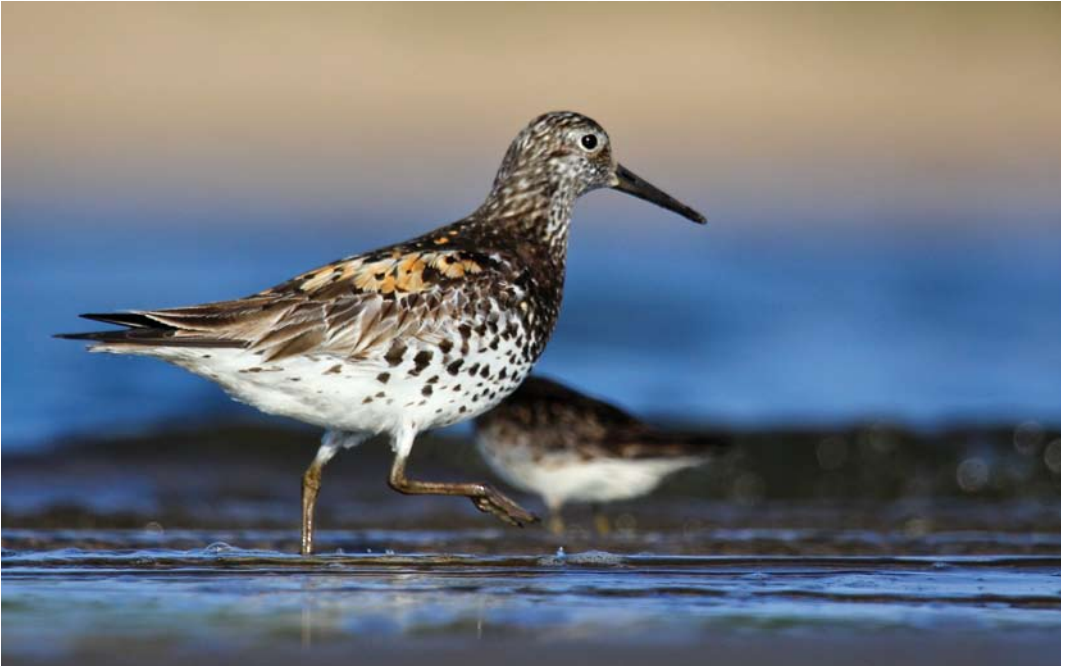
339 Great Knot / Grote Kanoet Calidris tenuirostris , adult summer, Vistula mouth, Pomerania, Poland, 17 July 2014