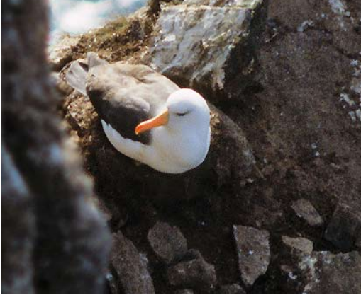
306 Black-browed Albatross / Wenkbrauwalbatros Thalassarche melanophris , adult, Hermaness, Unst, Shetland, Scotland, 8 April 1985

regularly recorded so there must be a steady influx of new birds. It is unknown if any of the birds have successfully found their way back to the Southern Hemisphere.