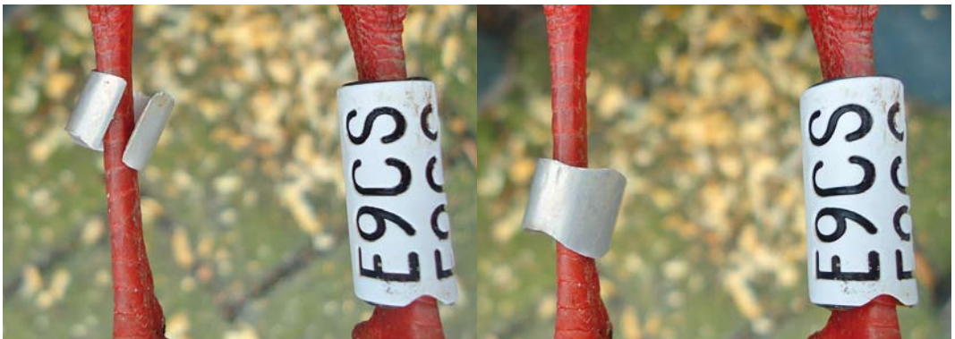
FIGURE 2 Aluminium ring Helgoland 5308939 of Black-headed Gull Larus ridibundus , 7 years, 11 months and 26 days after ringing on right tarsus (Henri Zomer). Photographs taken during retrap in Groningen, Groningen, Netherlands, on 17 January 2014; bird had been ringed as second calendar-year in Hamburg, Hamburg, Germany, on 22 January 2006.

On 9 February 1985, the late Klaas Visser ringed an adult (older than second calendar-year) Black-headed Gull with ring Arnhem 3.398.919 along Hilversumsch Kanaal east of Kortenhoef, Noord-Holland, the Netherlands (52°13'N, 05°07'E). The bird was not reported for the next 23 years. On 27 March 2008, KvD observed the bird in the city of Groningen, where he saw it again on 24-27 June 2010, and it was trapped there by Rob Voesten on 28 June 2010. The ring was gaping and the second digit of the ring number was difficult to read (figure 3). Based on biometrics, he identified it as a male (cf Palomares et al 1997). The ring was replaced by a stainless steel ring Arnhem 3.693.294 on the tarsus and a colour-ring white E6EM was