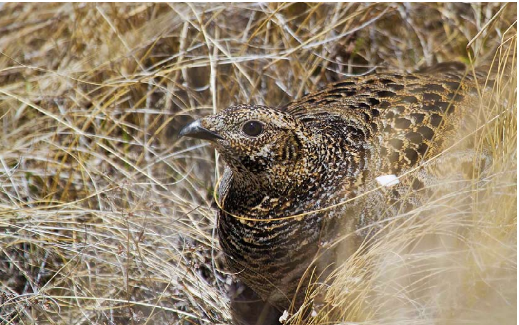
343 Caucasian Grouse / Kaukasisch Korhoen Tetrao mlokosiewiczzi, female, Kazbegi, Georgia, 30 April 2014