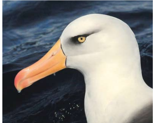
304 Campbell Albatross / Campbellalbatros Thalassarche impavida , adult, off Wollongong, New South Wales, Australia, 24 August 2013 (Roef Mulder)

caused by the fact that many records may relate to long-staying and returning individuals and because individuals may live for several 10s of years.