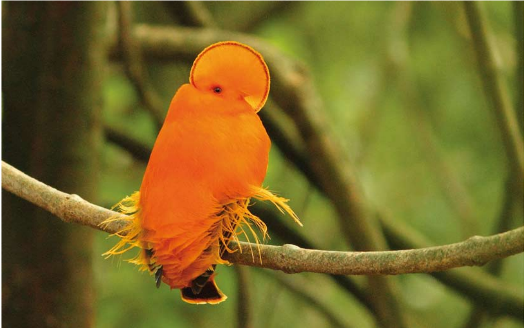
328-329 Guianan Cock-of-the-rock / Oranje Rotshaan Rupicola rupicola , male, Raleigh Falls, Central Suriname Nature Reserve, Suriname, 19 November 2011 (Roland Wantia) 330 Guianan Cock-of-the-rock / Oranje Rotshaan Rupicola rupicola , female, Raleigh Falls, Central Suriname Nature Reserve, Suriname, 19 November 2011 (Roland Wantia)