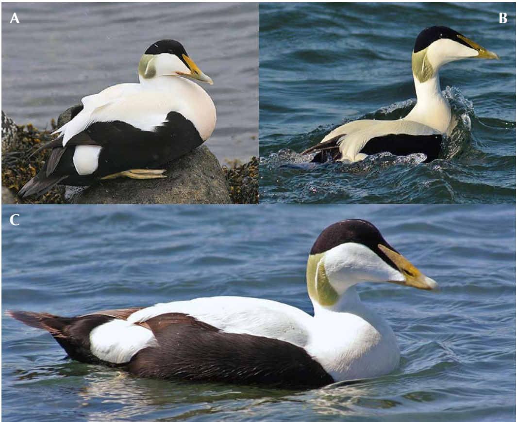
FIGURE 1 Common Eiders / Eiders Somateria mollissima , males. A S m borealis , Ellesmere Island, Canada, 24 May 2007 (Mark Mallory); B S m mollissima , east coast of Sweden, 5 May 2013 (Alexander Hellquist); C S m mollissima , Northumberland, England, 3 June 2011 (Richard Greenwood). Typical representatives of three populations. Note positions of nostrils, sails, bill colour and head shape. While Baltic nominate mollissima in breeding plumage often have straight line between bill tip and crown, British birds show more marked forehead on average, just like many borealis .

The size of the salt glands located above the eyes in eiders and other marine birds can explain, at least partly, that the forehead in borealis and faeroensis is more marked on average compared with mollissima belonging to the Baltic/Wadden Sea flyway population. The glands enable intake of ocean water and disposal of excess salt through head shakes. The water of the Baltic is brackish, and Kattegat and Skagerrak as well as the Wadden Sea are less saline than the North Sea. Schiøler (1914) noted that the more prominent forehead in Norwegian birds compared with Danish and