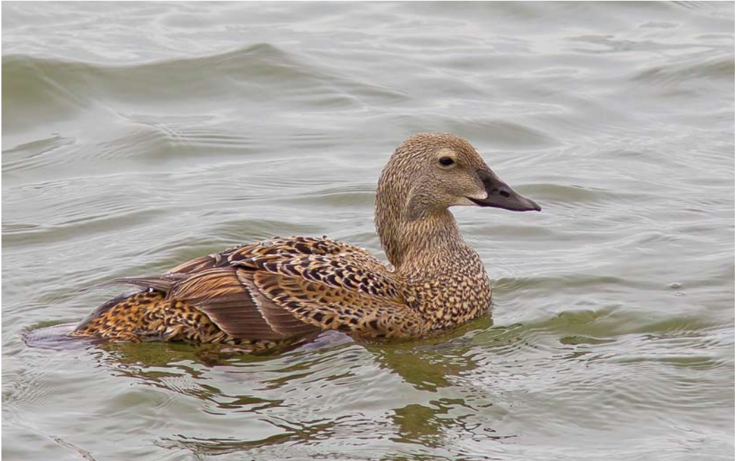
357 Koningseider / King Eider Somateria spectabilis , vrouwtje, Scheveningen, Den Haag, Zuid-Holland, 28 juni 2014