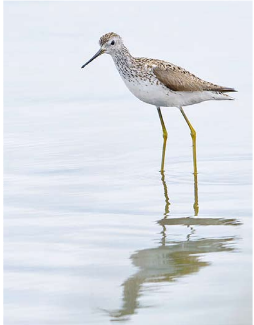
365 Kwartelkoning / Corn Crake Crex crex , Buggenum, Limburg, 9 juni 2014 366 Poelruiter / Marsh Sandpiper Tringa stagnatilis , zomerkleed, Stinkgat, Tholen, Zeeland, 20 juni 2014 367 Ralreiger / Squacco Heron Ardeola ralloides , adult zomerkleed, Bovenmeent, Hilversum, Noord-Holland, 7 juni 2014