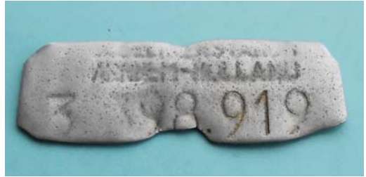
FIGURE 3 Aluminium ring Arnhem 3.398.919 of Black-headed Gull Larus ridibundus, 25 years, 4 months and 19 days after ringing on right tibia. Ring replaced on 28 June 2010, last observation of bird on 15 March 2014. Ringed as adult (after second calendar-year) near Kortenhoeft, Noord-Holland, Netherlands, on 9 February 1985.

We thank Vogeltrekstation Arnhem for the ringing permits and Natuurmonumenten for their support to do research on Griend. We also thank all those