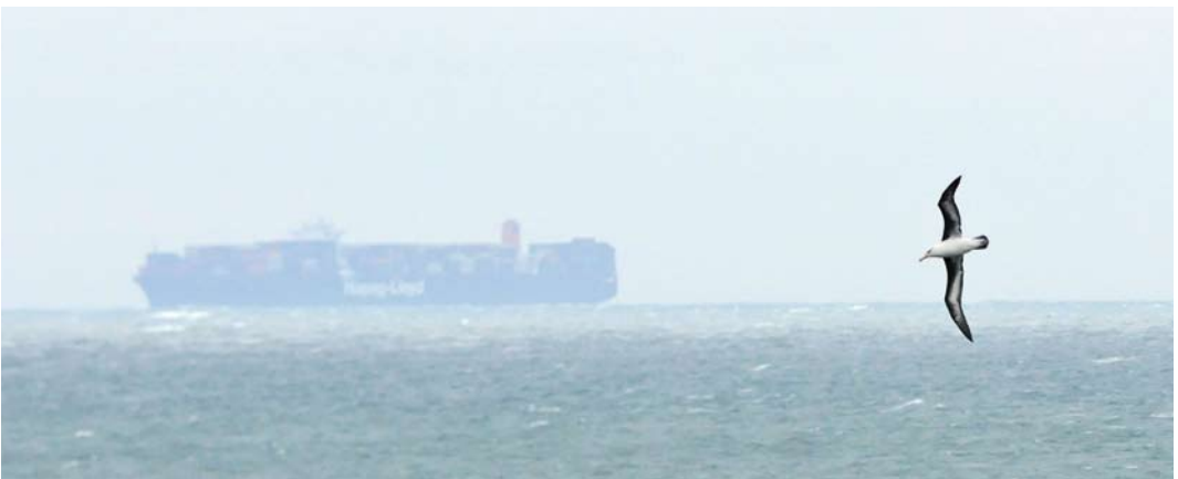
305 Black-browed Albatross / Wenkbrowwalbatros Thalassarche melanophris , adult, Helgoland, Schleswig-Holstein, Germany, 28 May 2014 (Roef Mulder)

Figure 1 shows all WP records and reports per year. A steady increase since c 1980 is clearly vis-