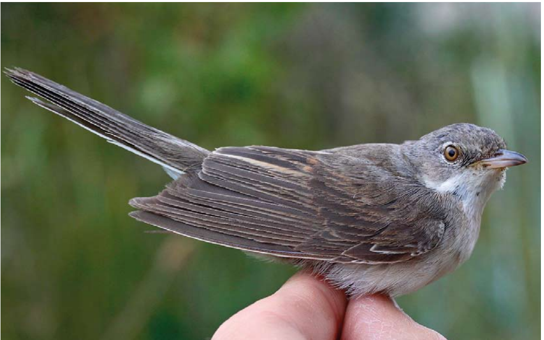
353 Asian Common Whitethroat / Oostelijke Grasmus Sylvia communis icterops/rubicola , Blåvand, Vestjylland, Denmark, 4 June 2014