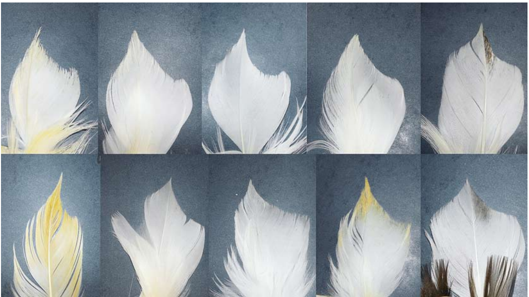
FIGURE 3 Lower scapulars that form sails in males Common Eider / Eider Somateria mollissima . Above: four adult (fourth calendar-year or older) and one third calendar-year (right) S m mollissima , Sweden, spring. Below from left to right: two adult S m borealis from Greenland, spring, two adult borealis from Svalbard, spring, and one second calendar-year from Iceland, September. In borealis , it is more common for tip of outer webs to be pointed, and webs are slightly broader on average but differences between subspecies are very small. Second generation of lower scapulars (in second calendar-year autumn to third calendar-year spring birds) have dark markings (if attained early they can be mostly dark).

The major difference between borealis and mollissima lies in behaviour rather than in appearance. Borealis is much more prone to erect its sails. In mollissima , the lower scapulars are regularly lifted slightly along the shafts but the outer webs are drooping, creating gently bulging humps on the lower back rather than sails. However, mollissima occasionally erects the outer webs and may then match the appearance of borealis (see