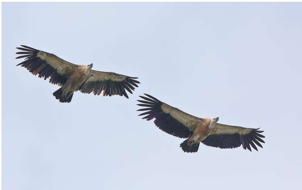
359 Vale Gieren / Griffon Vultures Gyps fulvus , Korendijkse Slikken, Zuid-Holland, 7 juni 2014