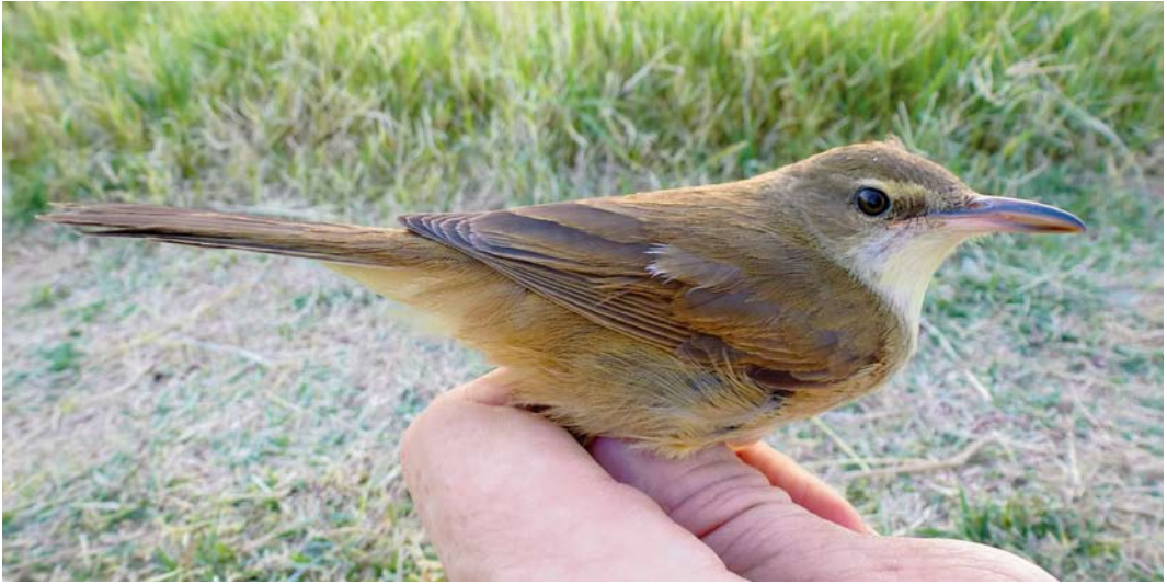
324 Clamorous Reed Warbler / Indische Karekiet Acrocephalus stentoreus stentoreus , Wawa, Sudan, 18 April 2013 (Jens Hering)

as a deliberate search for this species in Sudan has not been conducted before.