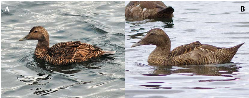
FIGURE 5 Common Eiders / Eiders Somateria mollissima , females. A S m borealis , Iceland, 27 July 2007; B presumed S m mollissima , west coast, Sweden, 21 September 2013. In borealis , females regularly show small sails, which seems to be very rare in nominate mollissima . But as bird in 5B shows, it occasionally happens. As in males, size of sails differs very little between subspecies. Also in females, there is a general difference in forehead shape.

The features that distinguish borealis in the field seem to be present to the same extent across the entire range (using the broad definition of the subspecies), and based on the traits studied here little has been found to justify a division into more subspecies. No differences in appearance between northern and southern Iceland have been detected in live birds, photographs and a few specimens checked but, in light of the genetic similarity between birds from Faeroes, southern Iceland and Shetland, variation within Iceland could still attract further study. The variation within mollissima as defined here is also slight. It is most pronounced