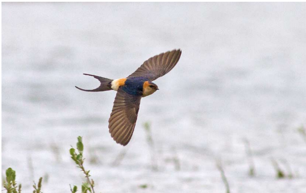
377 Roodstuitzwaluw / Red-rumped Swallow Cecropis daurica , Vogelmeer, Bloemendaal, Noord-Holland, 8 mei 2014 378 Roodstuitzwaluw / Red-rumped Swallow Cecropis daurica , met Boerenzwaluw / Barn Swallow Hirundo rustica en Huiszwaluw / Eurasian House Martin Delichon urbicum , Vogelmeer, Bloemendaal, Noord-Holland, 8 mei 2014