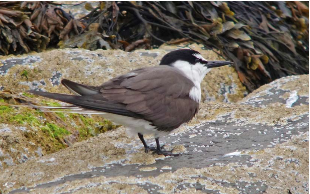
340 Bridled Tern / Brilstern Onychoprion anaethetus , adult summer, Inner Farne, Northumberland, England, 6 July 2014 (Paul Hackett)