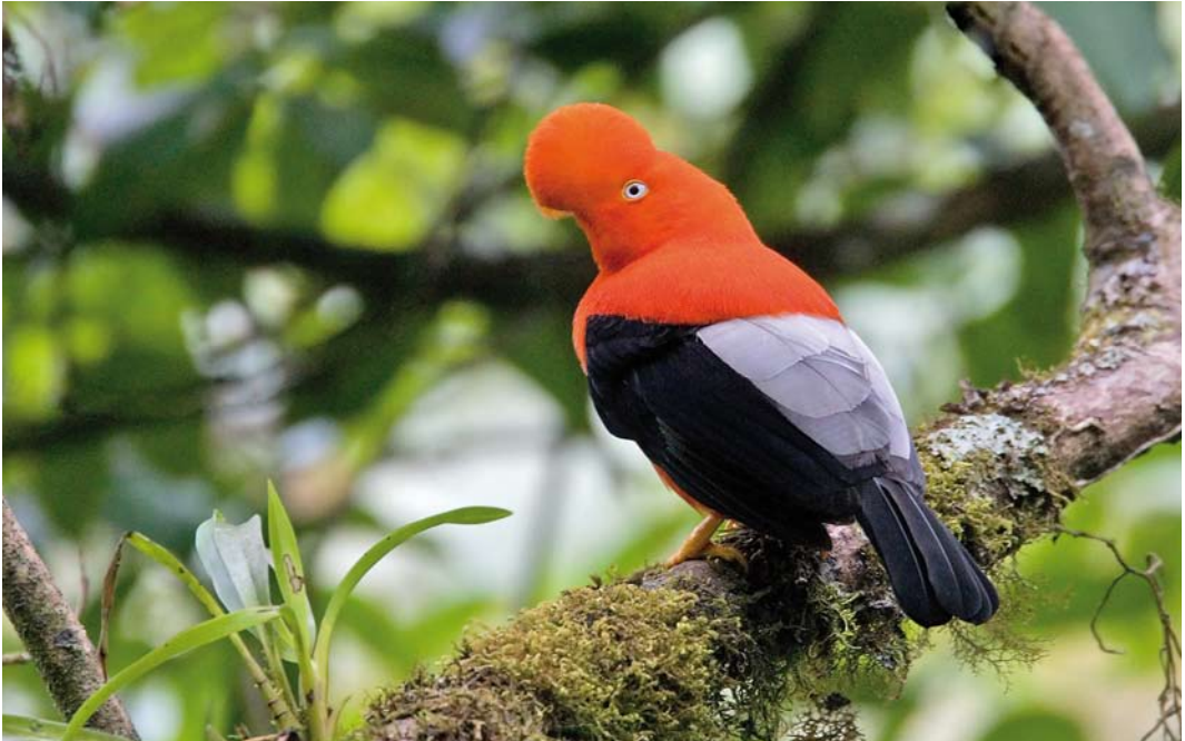
334 Andean Cock-of-the-rock / Rode Rotshaan Rupicola peruviana saturatus , male, Cock of the Rock Lodge, Manu, Peru, 4 July 2007 (Harvey van Diek)