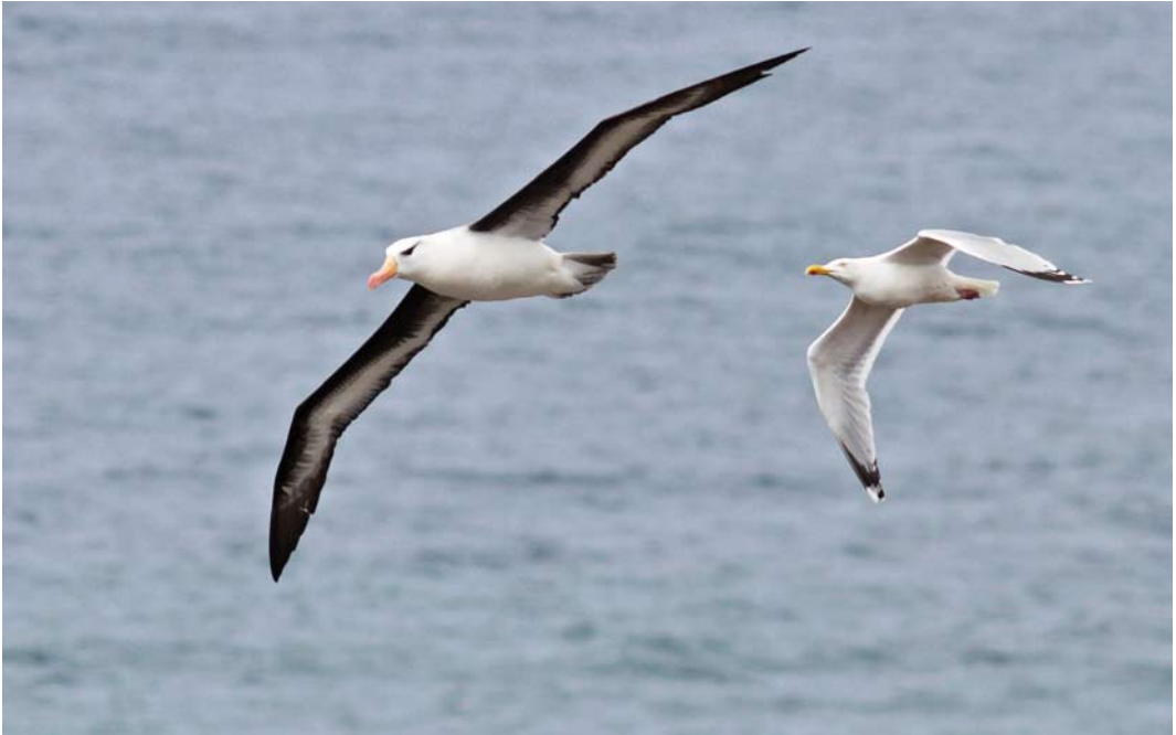
294 Black-browed Albatross / Wenkbrauwalbatros Thalassarche melanophris , adult, with Herring Gull / Zilvermeeuw Larus argentatus , Helgoland, Schleswig-Holstein, Germany, 5 June 2014