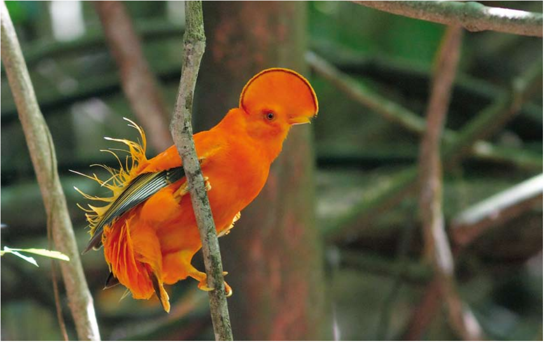
325-327 Guianan Cock-of-the-rock / Oranje Rotshaan Rupicola rupicola , male, Raleigh Falls, Central Suriname Nature Reserve, Suriname, 19 November 2011