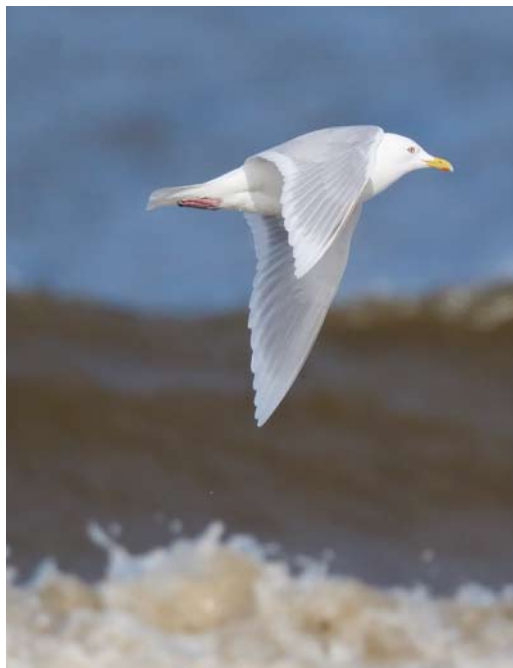
327 Kleine Burgemeester / Iceland Gull Larus glaucooides , derde-winter, Utrecht, Utrecht, 6 januari 2015 (Rob Half) )