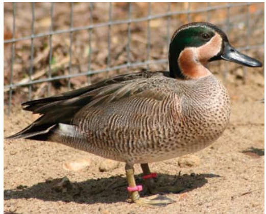
270 Presumed hybrid Eurasian Teal x Garganey / vermoedelijke hybride Wintertaling x Zomertaling Anas crecca x querquedula with Eurasian Teal / Wintertaling, L'Albufera de Valencia, Valencia, Spain, 27 January 2014 (José Ignacio Dies). In hybrid, note coarser pattern of flank, mantle and rump feathers and undertail-coverts. 271 Presumed hybrid Eurasian Teal x Garganey / vermoedelijke hybride Wintertaling x Zomertaling Anas crecca x querquedula , L'Albufera de Valencia, Valencia, Spain, 27 January 2014 (José Ignacio Dies). Note upper scapulars showing washed-out pattern that is nevertheless still similar to Garganey, and partly obscured lower scapulars with creamy white coloration, pale-edged tertials and patterned undertail-coverts. 272 Presumed hybrid Eurasian Teal x Garganey / vermoedelijke hybride Wintertaling x Zomertaling Anas crecca x querquedula , L'Albufera de Valencia, Valencia, Spain, 27 January 2014 (José Ignacio Dies). Note breast pattern and slight greenish iridescence behind eye. 273 Hybrid Blue-winged Teal / hybride Blauwvleugeltaling x Amerikaanse Wintertaling Anas discors x carolinensis , male, Huntsville, Alabama, USA, 2011 (Mark Hall). Captive bird of known parentage.

haved similar to the Eurasian Teals it was associating with. The legs have been seen only briefly during preening but were without any obvious rings.