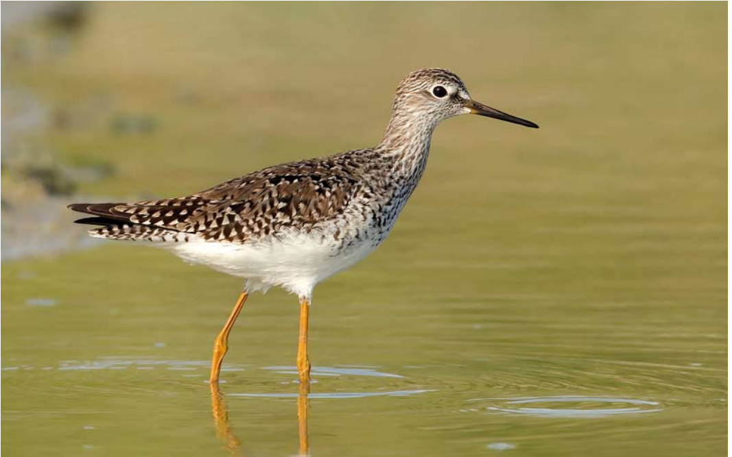
299 Lesser Yellowlegs / Kleine Geelpootruiter Tringa flavipes , IJzermonding, Nieuwpoort, West-Vlaanderen, Belgium, 10 May 2015