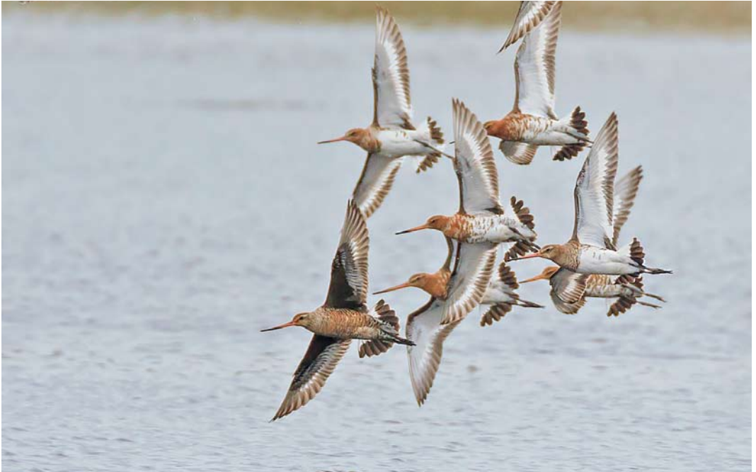
301 Hudsonian Godwit / Rode Grutto Limosa haemastica , adult, with Black-tailed Godwits / Grutto's L. limosa , Meare Heath, Somerset, England, 2 May 2015