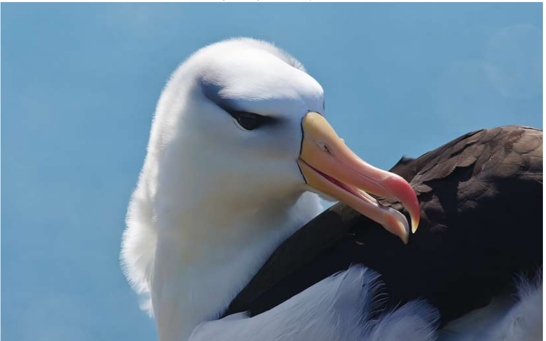
297 Black-browed Albatross / Wenkbrauwalbatros Thalassarche melanophris , adult, Helgoland, Schleswig-Holstein, Germany, 5 May 2015 (Roy Slaterus)