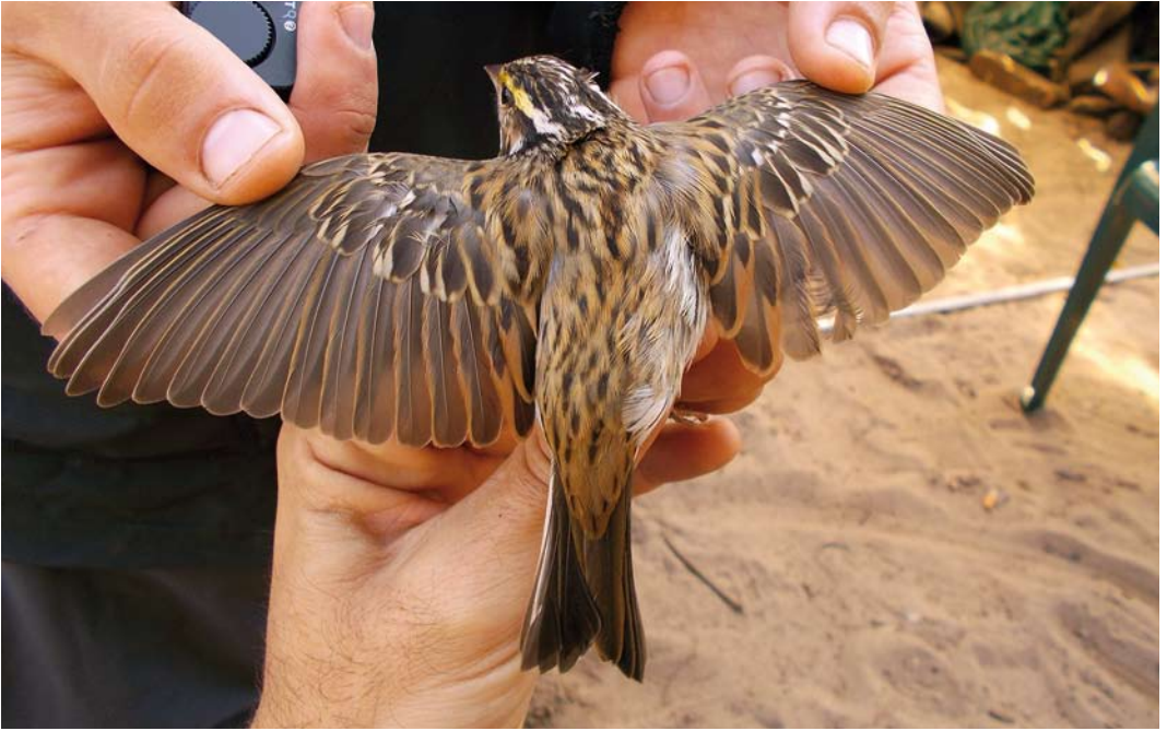
287-288 Yellow-browed Bunting / Geelbrauwgors Emberiza chrysophrys , first-year female, Dąbkowice, West Pomerania, Poland, 5 October 2014 (Michał Polakowski)