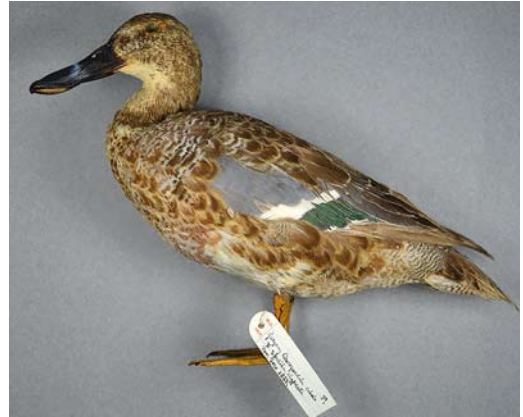
274 Hybrid Garganey x Northern Shoveler / hybride Zomertaling x Slobeend Anas querquedula x clypeata , male (Zoological Society London, 1855, most likely bred London Zoo), Natural History Museum, Tring, England, 22 April 2014 (Hein van Grouw). Eclipse plumage but with some breeding plumage feathers.

The mentioned typical Garganey head pattern seems to be suppressed in Garganey hybrids in general. Neither of the two breeding plumage Garganey hybrids from the Museum of Natural History (MNH) at Tring, England, examined by us shows any trace of this pattern (figure 3-4).