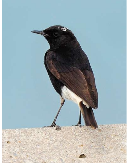
312 Caspian Penduline Tit / Kaspische Buidelmees Remiz pendulinus caspius , Wondelgem, Oost-Vlaanderen, Belgium, 3 April 2015 ( Garry Bakker ) 313 White-crowned Wheatear / Witkruintapuit Oenanthe leucopyga , second calendar-year, Palavas-les-Flots, Montpellier, Hérault, France, 5 May 2015 ( Antoine Joris ) 314 White-crowned Wheatear / Witkruintapuit Oenanthe leucopyga , second calendar-year, Winduga, Kujawsko-Pomorskie, Poland, 16 May 2015 ( Mateusz Matysiak )