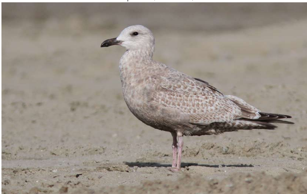
336 Thayers Meeuw / Thayer's Gull Larus thayeri , tweede-kalenderjaar, Egmond aan Zee, Noord-Holland, 12 april 2015