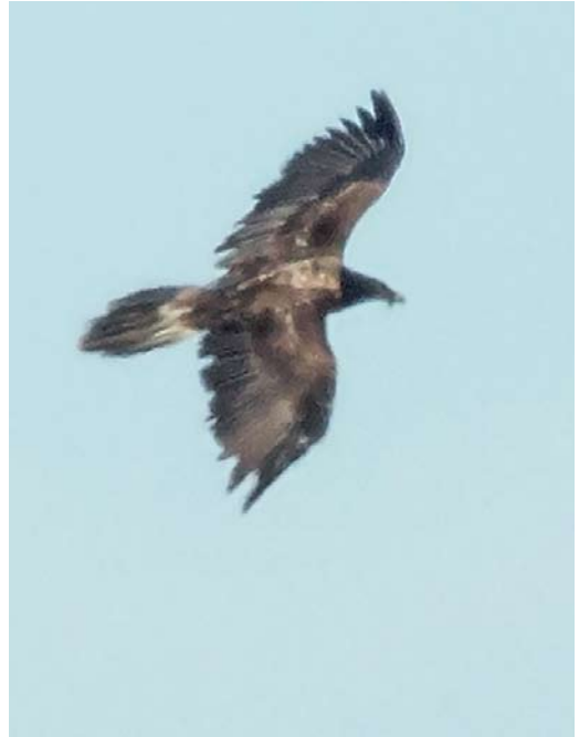
303 Great Blue Heron / Amerikaanse Blauwe Reiger Ardea herodias , Bryher, Scilly, England, 17 April 2015 304 Bearded Vulture / Lammergier Gypaetus barbatus , immature, Sallandse Heuvelrug, Overijssel, Netherlands, 5 May 2015 305 Demoiselle Crane / Jufferkraanvogel Grus virgo , adult, with Hooded Crows / Bonte Kraaien Corvus cornix , Lesvos, Greece, 28 April 2015