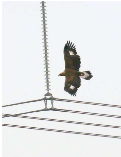
318 Kleine Geelpootruiter / Lesser Yellowlegs Tringa flavipes , adult-winter, Haamstede, Zeeland, 11 maart 2015 319 Steenarend / Golden Eagle Aquila chrysaetos , eerste-winter, Veenhuizerstukken, Groningen, 15 maart 2015 320 Amerikaanse Oeverloper / Spotted Sandpiper Actitis macularius , Medemblik, Noord-Holland, 17 april 2015