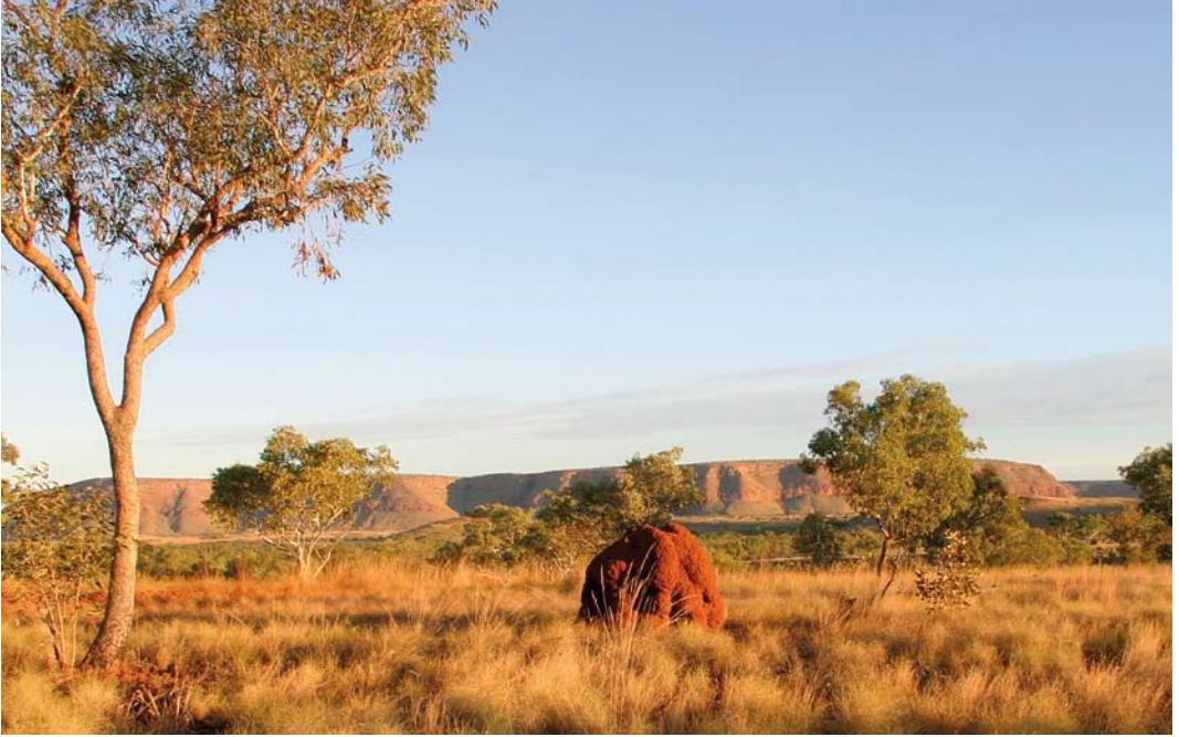
291 Breeding habitat of Gouldian Finch Erythrura gouldiae , Kimberley region, Western Australia, Australia, 7 July 2003 (Mike Fidler)