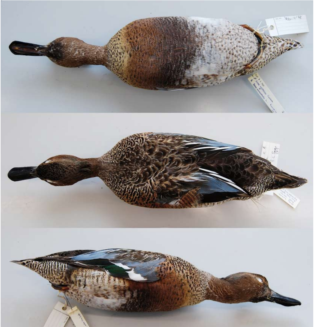
FIGURE 4 Hybrid Garganey x Red Shoveler / hybride Zomertaling x Argentijnse Slobeend Anas querquedula x platalea , probably male, incorrectly labeled as female (captive bird of known parentage, Collection B L Sage, 1964), Natural History Museum, Tring, England, 2 September 2011

the slightly wider distances between the thin black vermiculation lines.