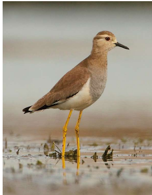
298 White-tailed Lapwing / Witstaartkievit Vanellus leucurus , adult, Żukowo, Wielkopolska, Poland, 9 May 2015

RAPTORSTO OWLS In north-western Europe, Black-winged Kites Elanus caeruleus flew over Hennef-Stadt Blankenberg, Nordrhein-Westfalen, Germany, on 27 March; Rheinland-Pfalz, Germany, on 13 April; Bødkermosen, Møn, on 23 April (seventh for Denmark); Elst, Utrecht, the Netherlands, on 4 May; and Thommen, Liège, Belgium, on 5 May. In Israel, three Crested Honey Buzzards