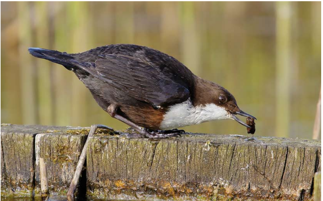
331 Waterspreeuw / White-throated Dipper Cinclus cinclus , De Cocksdorp, Texel, Noord-Holland, 24 april 2015