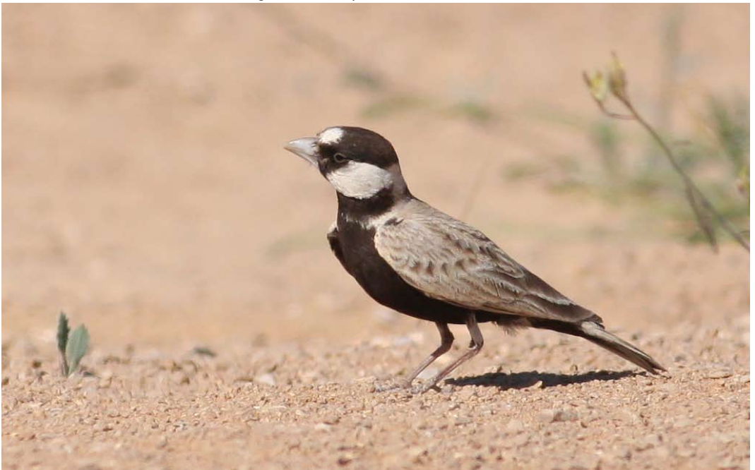
311 Black-crowned Sparrow-Lark / Zwartkruinvinkleeuwerik Eremopterix nigriceps , male, Meisbar Sei'Fim, Negev, Israel, 5 April 2015 (Frank Moffatt)