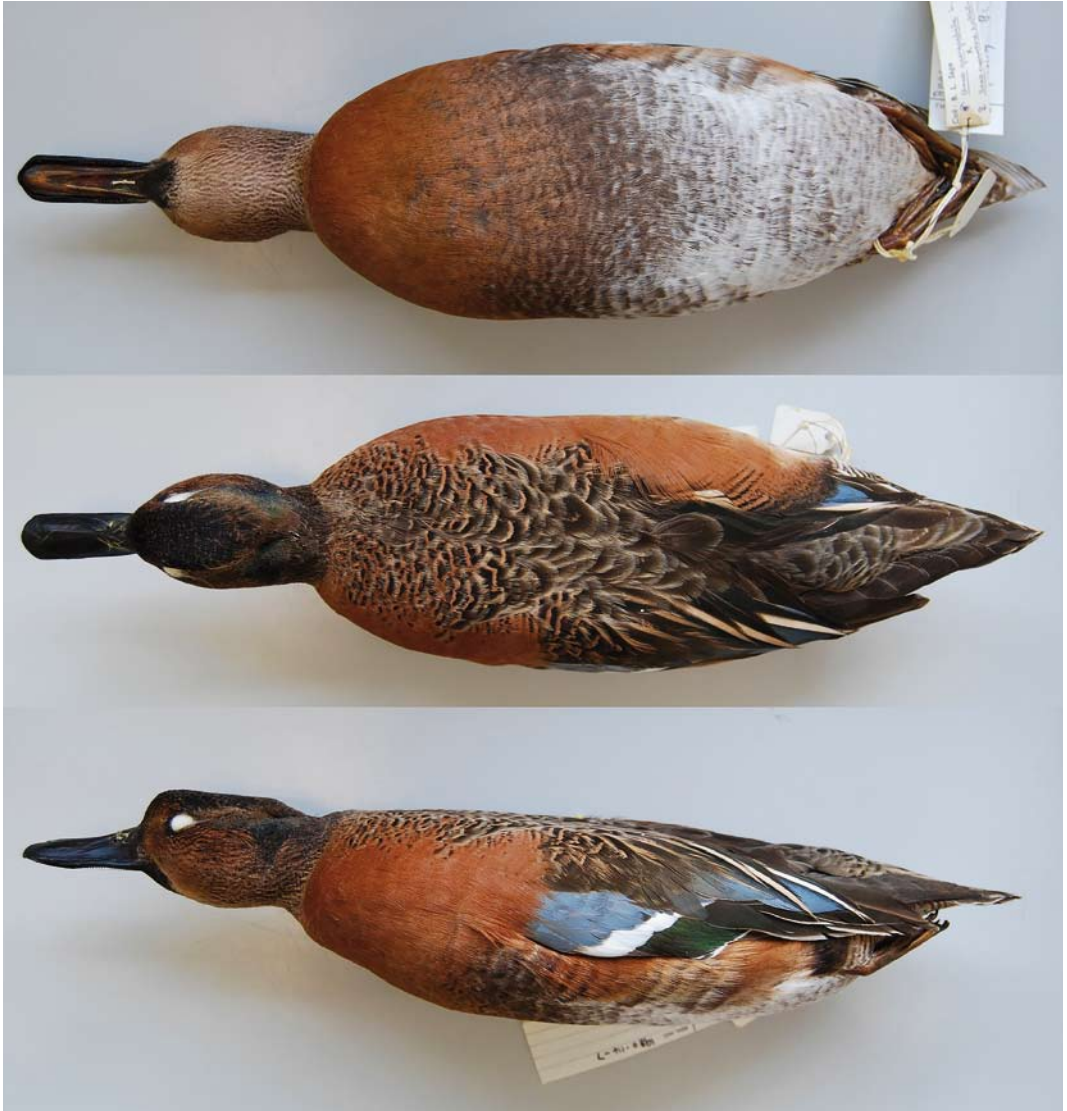
FIGURE 3 Hybrid Garganey x Cinnamon Teal / hybride Zomertaling x Kaneeltaling Anas querquedula x cyanoptera , male (captive bird of known parentage, Collection B L Sage, 1964), Natural History Museum, Tring, England, 2 September 2011 (Hein van Grouw)

eclipse-plumaged Garganey x Northern Shoveler A. clypeata hybrids (figure 3-4, plate 274). The breast colour of the Valencia bird, being darker and browner than in Eurasian Teal, was also a good fit for a hybrid with Garganey.