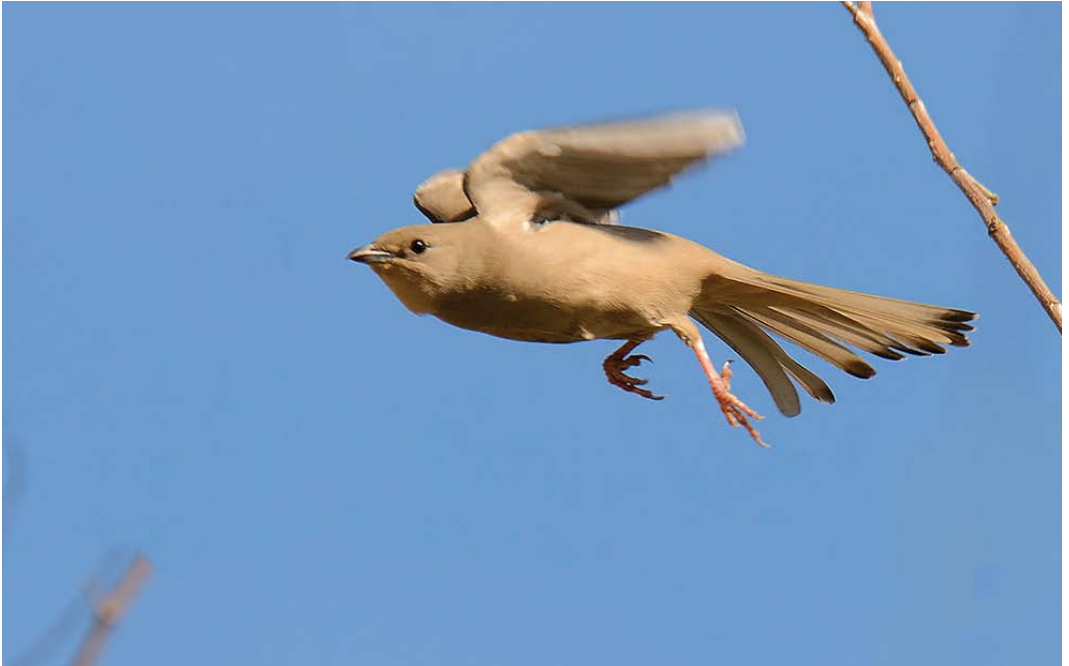
310 Grey Hypocolius / Zijdestaart Hypocolius ampelinus , female, Ashkelon, Israel, 2 April, 2015