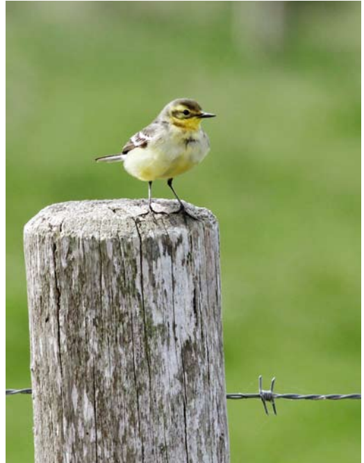
332 Grijsze Junco / Dark-eyed Junco Junco hyemalis , eerste-winter, Beijum, Groningen, Groningen, 9 april 2015 333 Citroenkwikstaart / Citrine Wagtail Motacilla citreola , vrouwtje, Noordervroon, Westkapelle, Zeeland, 19 april 2015 334 Blauwstaart / Red-flanked Bluetail Tarsiger cyanurus , Coepelduynen, Noordwijk, Zuid-Holland, 10 april 2015