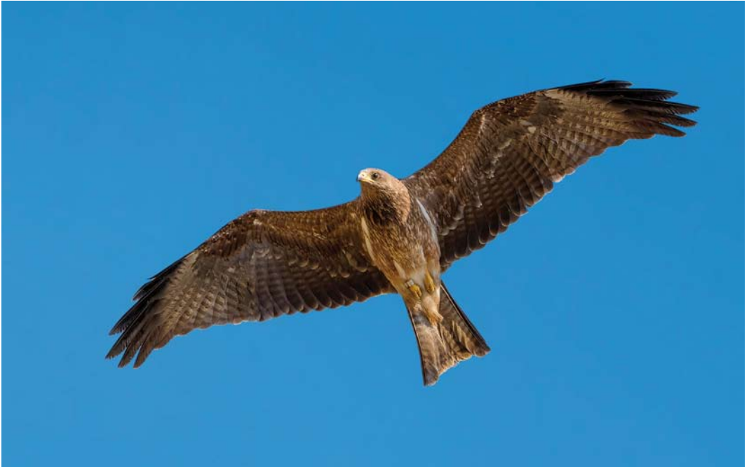
306 Yellow-billed Kite / Geelsnavelwouw Milvus aegyptius (found weakened at Rahat, Israel, on 5 April 2015), Tel Tsafit, Israel, 3 May 2015