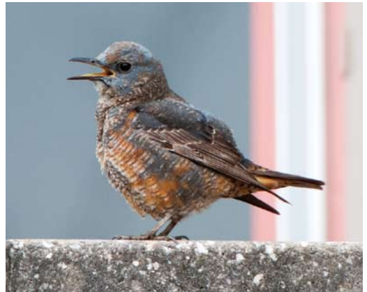
276 Rotslijster / rock thrush Monticola , Den Helder, Noord-Holland, 12 april 2013 277 Rotslijster / rock thrush Monticola , Den Helder, Noord-Holland, 12 april 2013 278-279 Rotslijster / rock thrush Monticola , Den Helder, Noord-Holland, 13 april 2013

RUI & SLEET Handpennen, armpennen, tertials, handpendekveren en alula gesleten, toppen van hand- en staartpennen sterk gesleten. Grote dekveren deels geruid: links gd1-3 nieuw, 7-10 oud, rechts gd1-2 en 4 nieuw, 3 en 5-10 oud. Middelste en kleine dekveren vers.