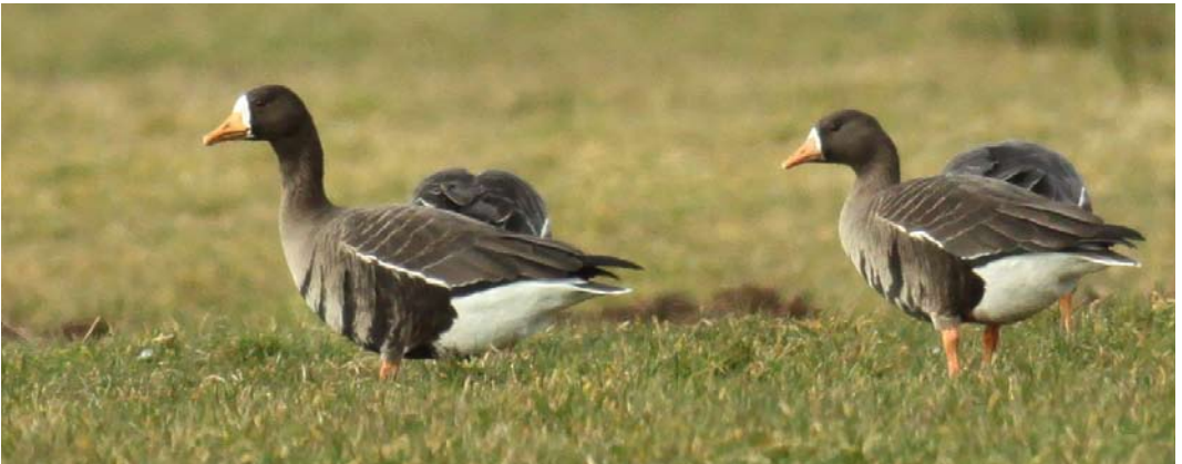
321 Ringsnaveleend / Ring-necked Duck Aythya collaris , mannetje, Flevoweg, Opperdoes, Noord-Holland, 14 april 2015 ( Fred Visscher ) 322 Groenlandse Kolganzen / Greenland White-fronted Geese Anser albifrons flavirostris , Hippolytushoef, Noord-Holland, 6 maart 2015 ( Fred Visscher )

flammeus . Een tweede-kalenderjaar Steenarend Aquila chrysaetos werd op 15 maart gefotografeerd bij Stadskanaal, Groningen (de laatste twitchbare was in 2002). Een vierde-kalenderjaar mannetje Steppekiekendief C macrourus werd op 24 april gefotografeerd vanaf telpost Noordkaap, Groningen. Van een 10-tal andere locaties kwamen ook meldingen, voornamelijk van langsvliegende vogels. Opvallend waren meldingen van Zeearenden uit de duinstreek van Noord- en Zuid-Holland, met daarbij zeker drie verschillende vierde-kalenderjaar vogels.