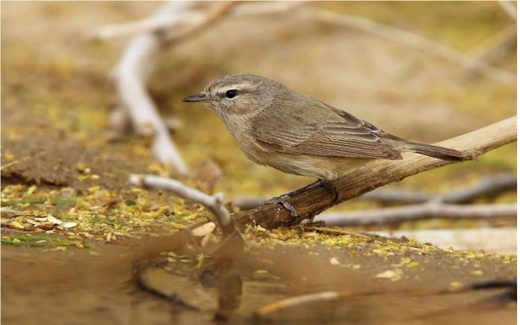
308 Plain Leaf Warbler / Dwertgijtjaf Phylloscopus neglectus , Al Mutla, Kuwait, 18 April 2014