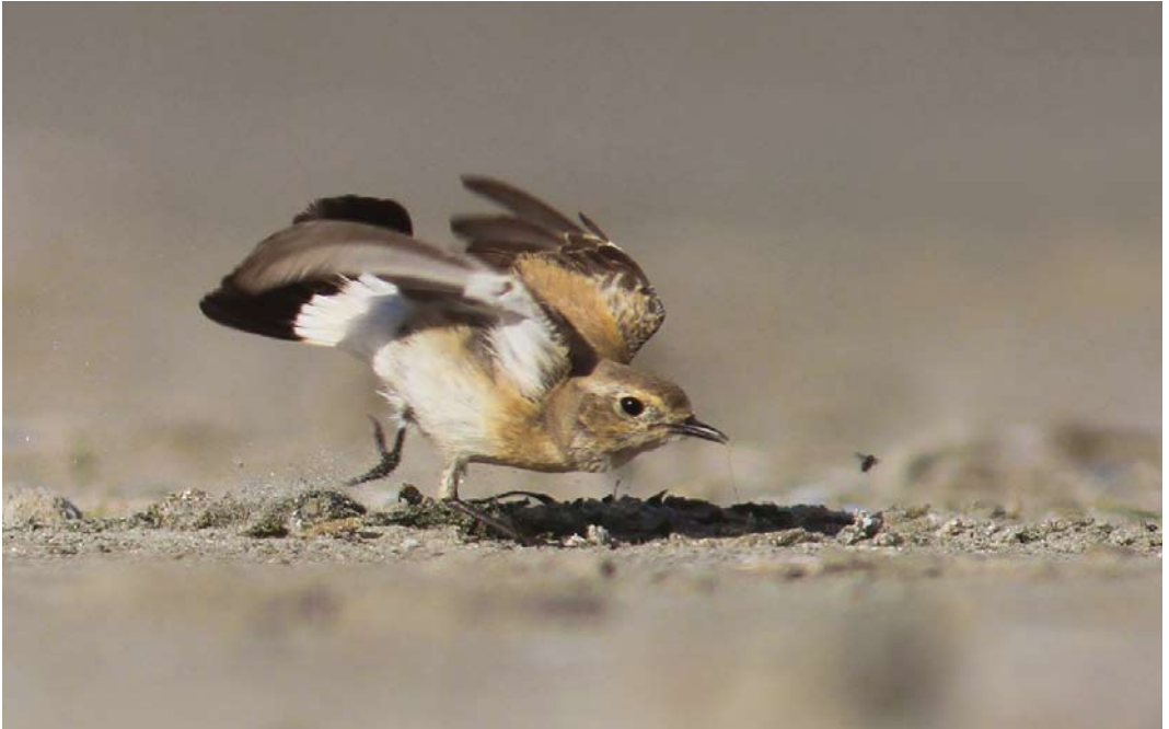
330 Woestijntapuit / Desert Wheatear Oenanthe deserti , vrouwtje, IJmuiden, Noord-Holland, 27 april 2015 (Marten Miske)