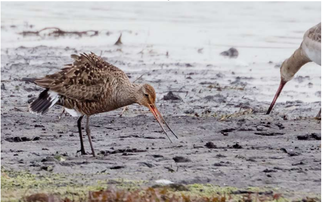
302 Hudsonian Godwit / Rode Grutto Limosa haemastica , adult, Meare Heath, Somerset, England, 1 May 2015 (Vincent Legrand)