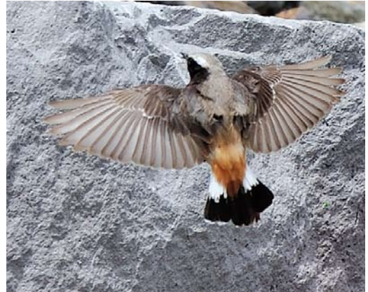
315-316 Kurdish Wheatear / Westelijke Roodstaartpauit Oenanthe xanthopyrna , Puy de Dôme, Puy-de-Dôme, France, 19 May 2015

for the Netherlands, of which three were females. If accepted, a Hooded Wheatear O monacha at Karadayı, Antalya, on 14 April will be the second for Turkey (the first for Greece was in May 2012; cf Dutch Birding 35: 384, 2013). A Western Black-eared Wheatear O hispanica photographed at Xrobb l-Ghagi on 1 May was a very rare find for Malta. A male Eastern Black-eared Wheatear O melanoleuca was photographed near Völpke between Braunschweig and Magdeburg, Sachsen-Anhalt, Germany, on 30 April. In France, a second calendar-year White-crowned Wheatear O leucopyga was singing at Palavas-les-Flots, Hérault, from 1 to at least 5 May. A second calendar-year at Winduga, Kujawsko-Pomorskie, from 12 to at least 18 May was the first for Poland. A Kurdish Wheatear O xanthopyrna photographed at the top of Puy de Dôme, Puy-de-Dôme, Auvergne, on 18-19 May was the first for France and Europe.