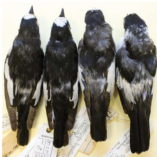
255 Atlas Pied Flycatchers / Atlasvliegenvangers Ficedula speculigera , adult males (collected in North Africa), NHM, Tring, England, 29 January 2009. Note variability in neck and rump pattern.

male semitorquata (but some have no collar), while a minority of albicollis in Italy can show a broken collar (Bonnet et al 2001; Andrea Corso pers obs). Therefore, a partial collar can be found in any of the four species but in different percentages. Bonnet et al (2011) suggested that a partial collar can be an ancestral character, shared by the four species. Hence, the trait may also occasionally be expressed in populations that normally lack it (atavism). It should be noted that adult male speculigera with a nearly full collar are strikingly similar to albicollis . In such birds, the pattern of median and inner greater coverts (presence of dark bases and presence of white tips on median) and the extent of white on the inner web of the median and outermost secondaries need to be carefully checked (see below).