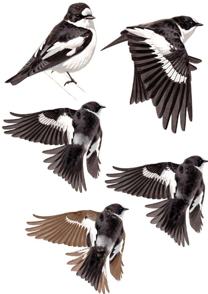
FIGURE 1 Atlas Pied Flycatchers / Atlasvliegenvangers Ficedula speculigera (Lorenzo Starnini). Images from birds on breeding grounds in Morocco and Tunisia in May. Perched bird shows typical adult male in fresh plumage with large white forehead patch, semi-collared appearance, square white wing patch on greater covers, all-black tail and pale greyish rump. Same bird with stretched wing shows wholly black outermost greater coverts, with black base to gc4-5 now visible on open wing. Note also that central median coverts are two thirds white. On some birds, white patch at base of primaries is as large as on well-marked Collared Flycatcher F. albicollis . In flight, two adult males showing variability in wing pattern, extent of pale on rump and semi-collared appearance. Note that upper bird approaches albicollis in rump pattern while lower bird approaches European Pied Flycatcher F. hypoleuca . Note extensive white patch on primary bases, reaching inner web of p2, as well as broad white base of all secondaries. Lowest bird is second calendar-year male showing retained outer tail-feathers edged white and smaller white primary patch, similar to that of hypoleuca .