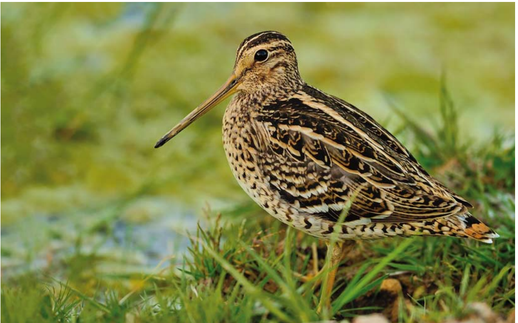
300 Great Snipe / Poelsnip Gallinago media , Sigean, Aude, France, 13 April 2015