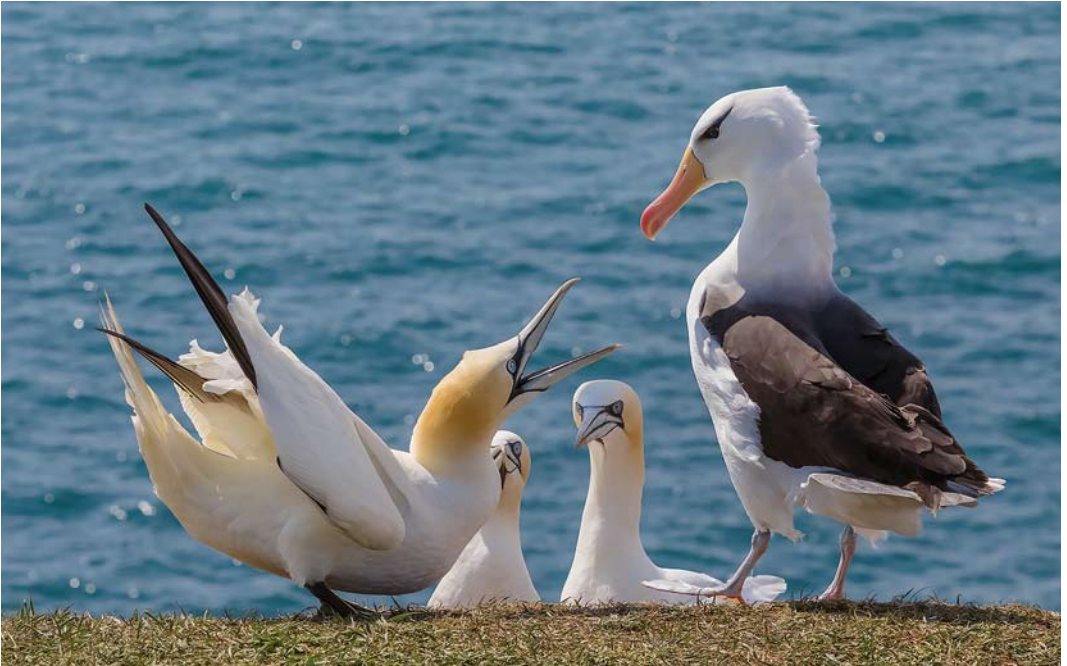
296 Black-browed Albatross / Wenkbrauwalbatros Thalassarche melanophris , adult, with Northern Gannets / Jan-van-genten Morus bassanus , Helgoland, Schleswig-Holstein, Germany, 5 May 2015