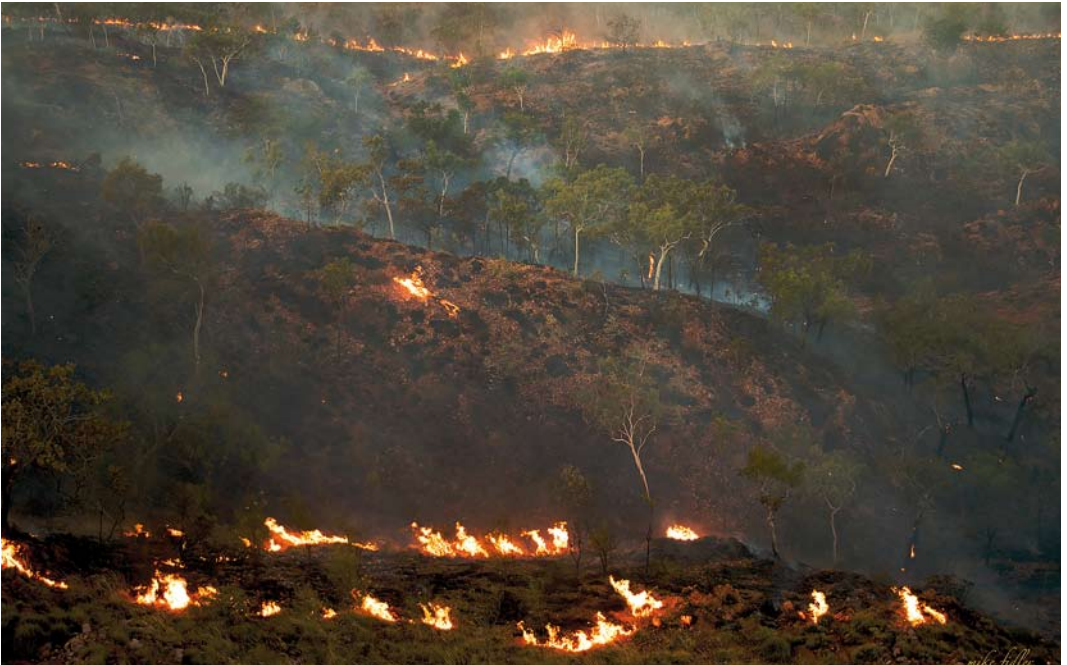
292 Forest fire, Kimberley region, Western Australia, Australia, 15 August 2008 (Mike Fidler). Forest fires are a great threat for Gouldian Finch Erythrura gouldiae nesting habitat.