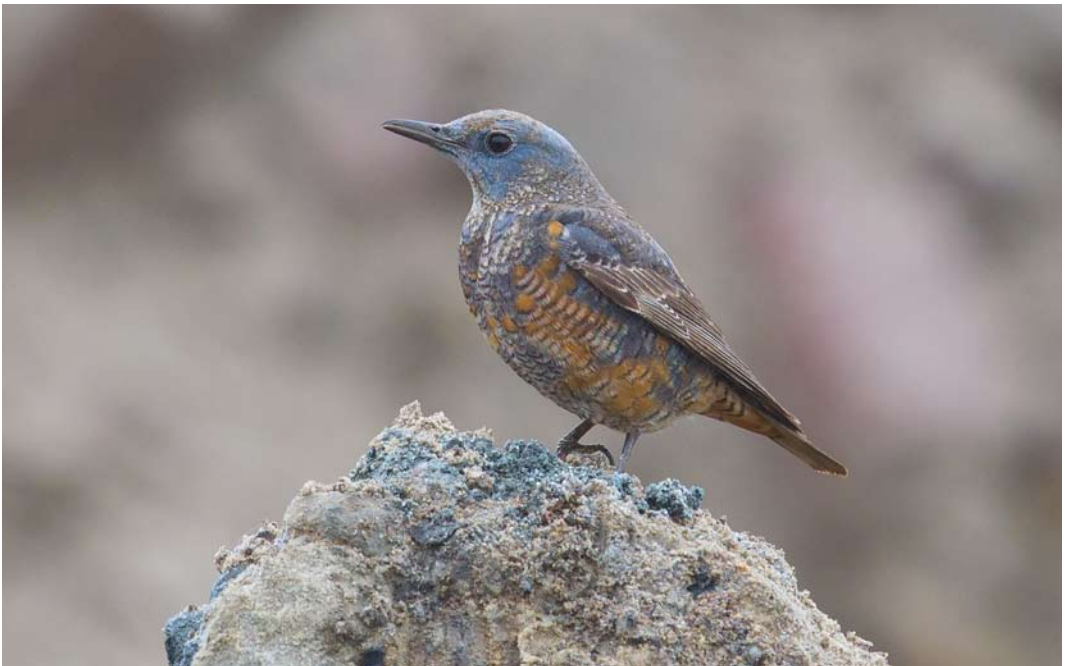
275 Rotslijster / rock thrush Monticola , Den Helder, Noord-Holland, 12 april 2013 (René van Rossum)

NAAKTE DELEN Iris donkerbruin. Snavel donkergrijs tot zwart met klein licht puntje aan bovensnavel. Poot grijs.