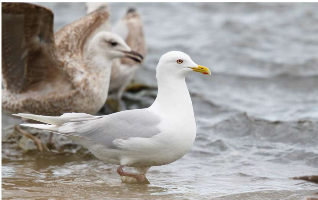
328-329 Kumliens Meeuw / Kumlien's Gull Larus glaucooides kumlieni , adult, Bergen aan Zee, 17 april 2015 (Frank Dröge)