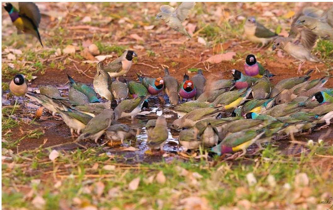
289 Gouldian Finches / Goulds Amadines Erythrura gouldiae , Kimberley region, Western Australia, Australia, 3 September 2008 ( Mike Fidler ). Flock of females and black-headed males with one red-headed and one yellow-headed male (center). 290 Gouldian Finches / Goulds Amadines Erythrura gouldiae , black-headed male and female, Kimberley region, Western Australia, Australia, April 2008 ( Mike Fidler )