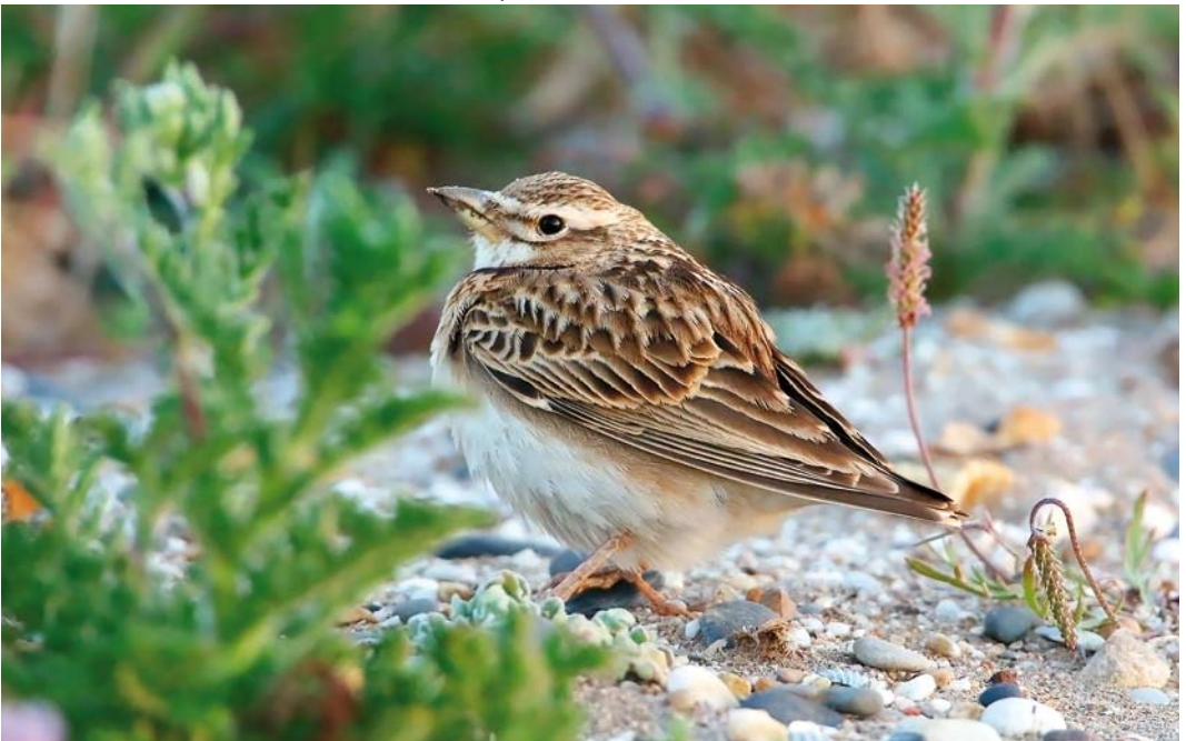
309 Bimaculated Lark / Bergkalanderleeuwerik Melanocorypha bimaculata , Salins des Pesquiers, Hyères, Var, France, 11 April 2015