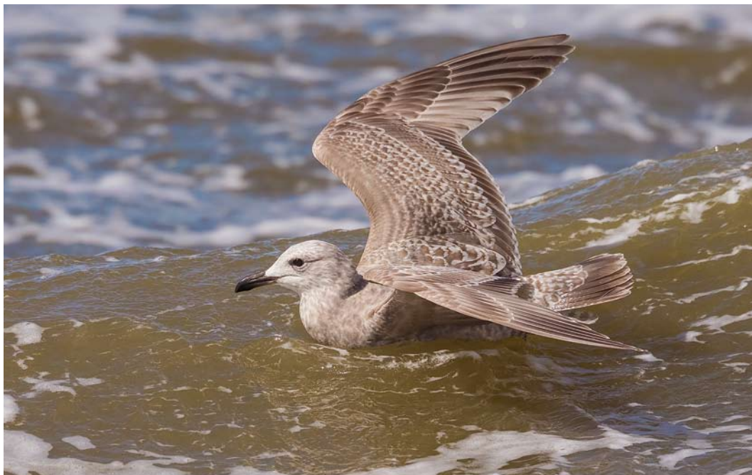
335 Thayers Meeuw / Thayer's Gull Larus thayeri , tweede-kalenderjaar, Egmond aan Zee, Noord-Holland, 12 april 2015