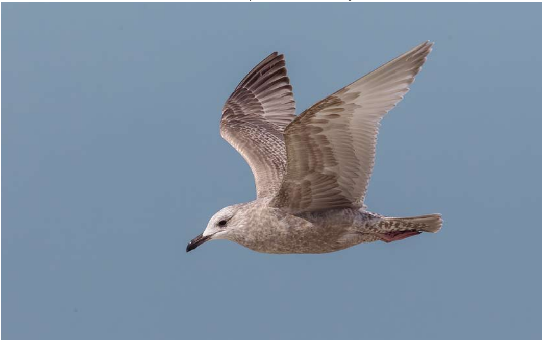
307 Thayer's Gull / Thayers Meeuw Larus thayeri , second calendar-year, Egmond aan Zee, Noord-Holland, Netherlands, 12 April 2015