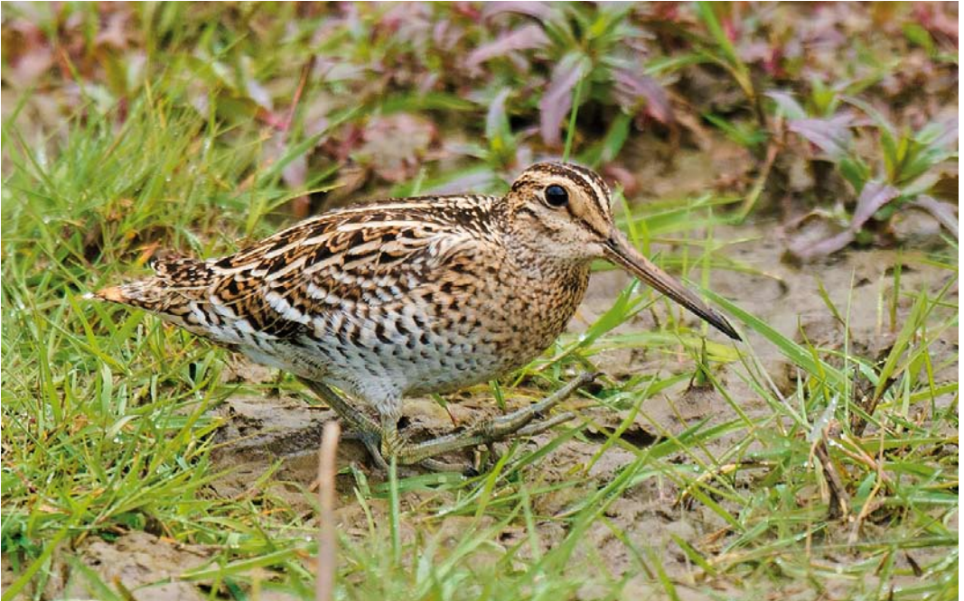
281-282 Poelsnip / Great Snipe Gallinago media , Broekhuizen, Limburg, 28 april 2015