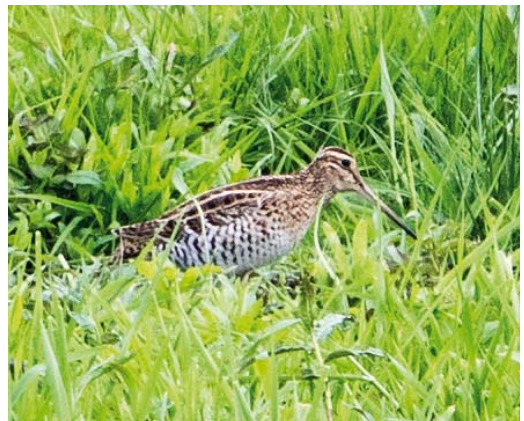
432 Franklins Meeuw / Franklin's Gull Larus pipixcan , eerste-zomer, Grote Brekken, Lemmer, Friesland, 23 mei 2015 ( Sietse Bernardus ) 433 Amerikaanse Goudplevier / American Golden Plover Pluvialis dominica , Breebaartpolder, Groningen, 16 mei 2015 ( Dušan M Brinkhuizen ) 434 Poelsnip / Great Snipe Gallinago media , Velp, Gelderland, 24 mei 2015 ( Dirk Vogt ) 435 Poelsnip / Great Snipe Gallinago media , Velp, Gelderland, 23 mei 2015 ( Alex Bos )

Weerribben, Overijssel. Meldingen van Kleinste Waterhoenders P pusilla kwamen alleen uit het noordoosten: van 17 mei tot 19 juni in De Onlanden, Drenthe (ten minste vier); van 22 tot 27 mei in de Weerribben (drie); en vanaf 13 juni een paar dat tot broeden kwam in de Onnerpolder, Groningen. De twee Ijsduikers Gavia immer in (grotendeels) zomerkleed bleven tot 16 mei op het Volkerak, Zuid-Holland. De ongeringde Roze Pelikaan Pelecanus onocrotalus bleef tot ten minste 6 juni in Callantsoog, Noord-Holland, en werd nadien nog opgemerkt op 8 juni bij Westzaan, Noord-Holland; van 8 tot 11 juni bij Castricum; op 11 juni langs Berkel en Rodenrijs, Zuid-Holland; en later in de maand juni in Zwitserland. Het aantal waarnemingen van Koereigers Bubulcus ibis bleef steken op zeven. In het Lauwersmeergebied, Friesland, werd voor het eerst een broedgeval van Kleine Zilverreiger Egretta garzetta vastgesteld. In totaal werden c 20 Zwarte Ibsissen Plegadis falcinellus waargenomen, waaronder maximaal vijf bij