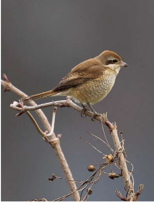
354 Bruine Klauwier / Brown Shrike Lanius cristatus , eerste-winter, Azewijnsche Broek, Gelderland, 22 februari 2014