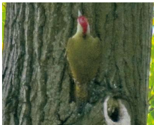
346-348 Hybrid Grey-headed x European Green Woodpecker / hybride Grijskopspecht x Groene Specht Picus canus x viridis , Bytom Miechowice, Poland, 31 March 2012. Same bird as in plate 349-351.