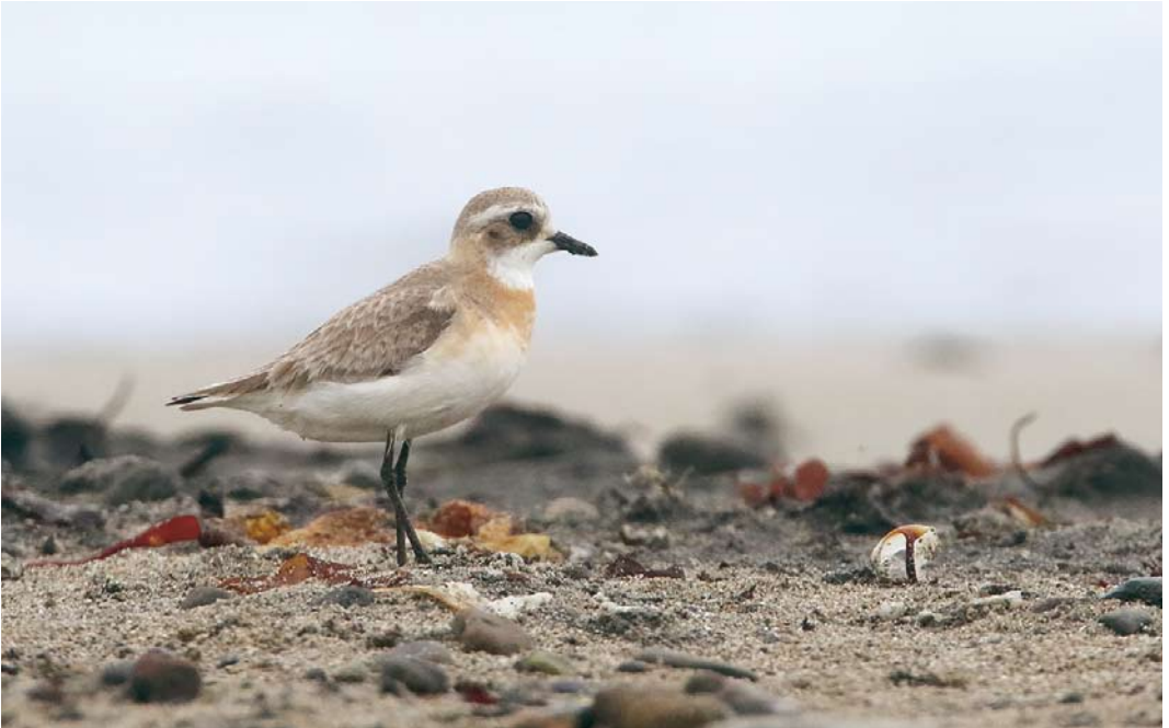
411 Mongolian/Lesser Sand Plover / Mongoolse/Tibetaanse Plevier Charadrius mongolus/atrifrons , adult, Farsund, Vest-Agder, Norway, 27 June 2015