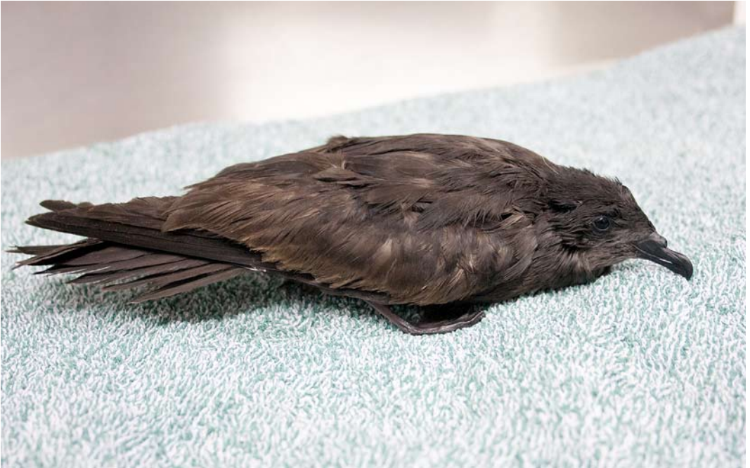
409 Bulwer's Petrel / Bulwers Stormvogel Bulweria bulwerii , picked up on 21 July 2015 at Kressbachsee, Eilwangen, Baden-Württemberg, Germany, 22 July 2015 ( Andreas Hachenberg )