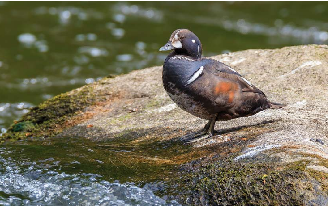
410 Harlequin Duck / Harlekijneend Histrionicus histrionicus , first-summer male, River Don, Aberdeenshire, Scotland, 20 May 2015 ( Richard Stonier )