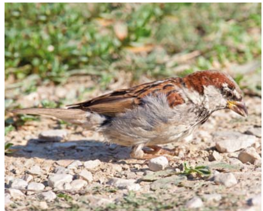
370 Hybrid House x Italian Sparrow / hybride Huismus x Italiaanse Mus Passer domesticus x italiae , adult male, Levico, Trentino, Italy, 5 August 2011 ( Edwin Winkel ). Typical and obvious hybrid. Remnants of grey crown clearly visible but small and not sharply defined. Grey also holds chestnut coloured spots, indicating italiae influence. Cheek still slightly darker than the white half-collar underneath, indicating domesticus ancestry. 371 Hybrid House x Italian Sparrow / hybride Huismus x Italiaanse Mus Passer domesticus x italiae , adult male, Levico, Trentino, Italy, 15 August 2011 ( Edwin Winkel ). Another evident hybrid with rather strong domesticus characteristics. Note darkish cheek and absence of any beige on back. Rudimentary grey crown, however, too narrow and irregular for pure domesticus . 372 Hybrid House x Italian Sparrow / hybride Huismus x Italiaanse Mus Passer domesticus x italiae , adult male, Levico, Trentino, Italy, 12 August 2011 ( Edwin Winkel ). Hybrid with dominating italiae features: strong anchor-shaped breast-patch and white cheek. Grey crown very narrow and grey, not beige. See also plate 373. 373 Hybrid House x Italian Sparrow / hybride Huismus x Italiaanse Mus Passer domesticus x italiae , adult male, Levico, Trentino, Italy, 12 August 2011 ( Edwin Winkel ). Same bird as in plate 372. Grey of crown better visible.

distinct feature is the breast-patch. In general, it is smaller than in italiae and, in domesticus , it rarely reaches the shoulder. The shape is again arrow-like but less pronounced than in italiae , caused by the white fringes which get broader as they reach the outline. The bill of domesticus is, on average, visibly smaller than in italiae .