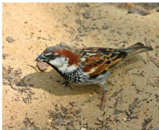
382 Italian Sparrow / Italiaanse Mus Passer italiae , adult male, rufous-breasted morph, Levico, Trentino, Italy, 5 August 2011 ( Edwin Winkel ). Moulting individual but outline and exposure of rufous-chestnut on breast obvious. 383 Italian Sparrow / Italiaanse Mus Passer italiae , adult male, rufous-breasted morph, Levico, Trentino, Italy, 13 August 2011 ( Edwin Winkel ). Adult moulting to 'winter' plumage. Fresh feather-tips covering rufous-brownish breast-patch. 384 Italian Sparrow / Italiaanse Mus Passer italiae , adult male, rufous-breasted morph, Viareggio, Toscana, Italy, 8 November 2008 ( Daniele Occhiato ). In fresh ('winter') plumage but wind revealing ground colour of breast-patch. 385 Hybrid House x Spanish Sparrow / Huismus x Spaanse Mus Passer domesticus x hispaniolensis , adult male, El Acebuche, Huelva, Spain, 6 May 2005 ( Edwin Winkel ). This crossing does not necessarily produce outcome looking like Italian Sparrow P italiae . Black strings on belly and flank indicating hispaniolensis parenthood and grey on crown indicating domesticus influence.

strated more than a rufous touch, even under bad light conditions. They actually had rufous-brown breast-patch feathers, about the same colour as the head. One bird (plate 380) was still in breeding plumage and its complete 'black' patch showed a solid rufous base with only a sparsely black coating. Other birds (plate 382-383) were heavily moulting but their incomplete bibs still displayed the same pattern of coloration.