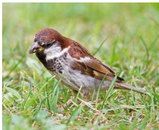
374 Hybrid House x Italian Sparrow / hybride Huismus x Italiaanse Mus Passer domesticus x italiae , adult male, Levico, Trentino, Italy, 10 August 2011 ( Edwin Winkel ). Very dark hybrid with less contrast and relatively small bill which indicates prevailing domesticus genes. Strong supercilium and beige tones on back, however, indicate italiae background. 375 Hybrid House x Italian Sparrow / hybride Huismus x Italiaanse Mus Passer domesticus x italiae , adult male, Levico, Trentino, Italy, 5 August 2011 ( Edwin Winkel ). Predominantly italiae -like bird. Strongly contrasting individual with fresh chestnut and pure white. However, different colour on top of head is most likely not due to moult but to domesticus ancestry, consisting of grey spots instead of beige tips of fresh feathers. 376 Hybrid House x Italian Sparrow / hybride Huismus x Italiaanse Mus Passer domesticus x italiae , adult male, Levico, Trentino, Italy, 3 August 2013 ( Edwin Winkel ). Only hybrid around at campsite in August 2013 but hard to overlook with its narrow greyish head-stripe. 377 Italian Sparrow / Italiaanse Mus Passer italiae , adult male, Levico, Trentino, Italy, 3 August 2011 ( Edwin Winkel ). Classic male which has just started to moult on head. Feathers appearing in front with yellowish or beige tips; rest of head still uniform dark.

more whitish than in domesticus but the contrast with the white half-collar below is still clearly visible. The breast-patch in typical hybrids appears to be the same as in domesticus : messy and incomplete. A very prominent italiae feature is a well developed supercilium, being broad in front of the eye. The bill of most hybrids is also like italiae , and thus stronger than in domesticus . Hybrids which are the result of repeated backcrossing are surely out there but will be more tricky to identify.