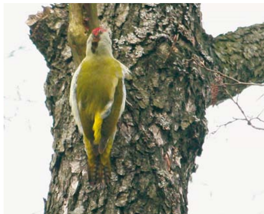
339-340 Hybrid Grey-headed x European Green Woodpecker / hybride Grijskopspecht x Groene Specht Picus canus x viridis , Biebrza National Park, Poland, 16 April 2008 (Adam Dmoch)

tention as a potential hybrid. Nonetheless, one has to bear in mind that individual variability and specific circumstances can cause similar deviations in birds that are not hybrids. It is worth remembering that a female of both canus and viridis sings as well as the male, only more quietly, for a shorter time, not so vibrantly and at a lower pitch.