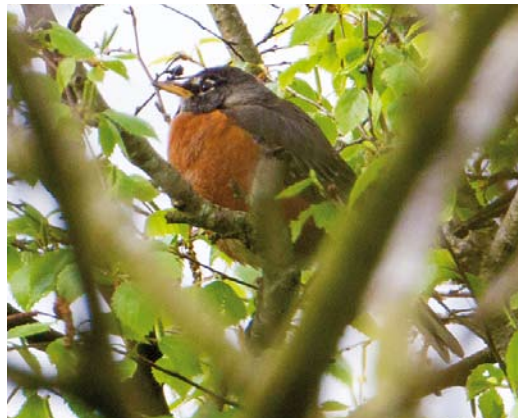
356-357 Roodborstlijster / American Robin Turdus migratorius , eerste-zomer mannetje, Heemskerk, Noord-Holland, 27 april 2014 358-359 Roodborstlijster / American Robin Turdus migratorius , eerste-zomer mannetje, Heemskerk, Noord-Holland, 27 april 2014 360-361 Roodborstlijster / American Robin Turdus migratorius , eerste-zomer mannetje, Heemskerk, Noord-Holland, 27 april 2014