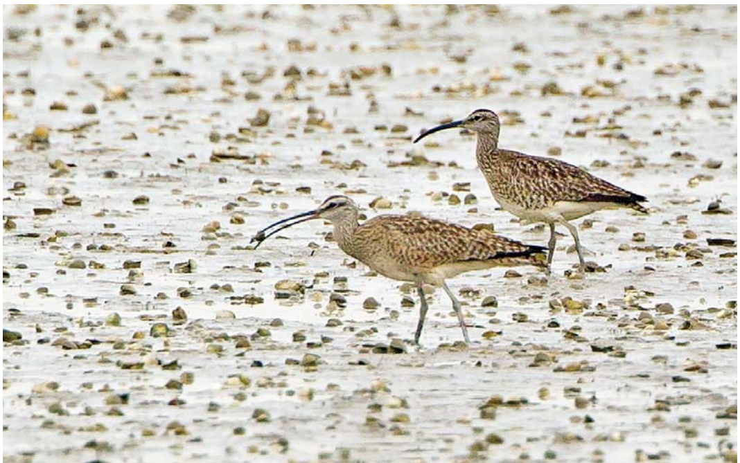
415 Hudsonian Whimbrel / Amerikaanse Regenwulp Numenius hudsonicus (left), with Eurasian Whimbrel / Regenwulp N phaeopus , Pagham Harbour, Sussex, England, 12 June 2015 (John Richardson)

SKUAS TO TERNS An exceptional skua Stercorarius passage in the Outer Hebrides, Scotland, involved a May total of 4640 Long-tailed Jaegers S longicaudus and 3004 Pomarine Skuas S pomarinus for the headland of Aird an Rùnair, North Uist, alone. A second-year Ivory Gull Pagophila eburnea at Knopper, Jylland, on 10 July was the ninth for Denmark. A census of Slender-billed Gulls Chroicocephalus genei in Sardinia resulted in 2200 breeding pairs, all in the Gulf of Cagliari and Oristano. The Grey-headed Gull C cirrocephalus first staying in June-July 2013 and back at Biceglie, Puglia, Italy, from 28 November 2014 was still present in July 2015 (cf Dutch Birding 37: 126, 2015). Satellite and geolocator telemetry used on three Ross's Gulls Rhodostethia rosea breeding in the Canadian Arctic revealed that they wintered in a restricted area of the northern Labrador Sea; up to now, this species' winter range was a mystery (Ibis 157: 642-647, 2015). A Laughing Gull Larus atricilla