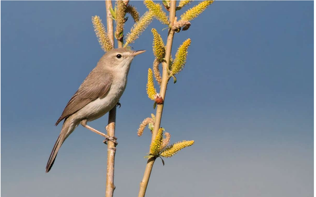
424 Sykes's Warbler / Sykes' Spotvogel Iduna rama , Karlı, Yüksekova, Hakkari, Turkey, 18 May 2015