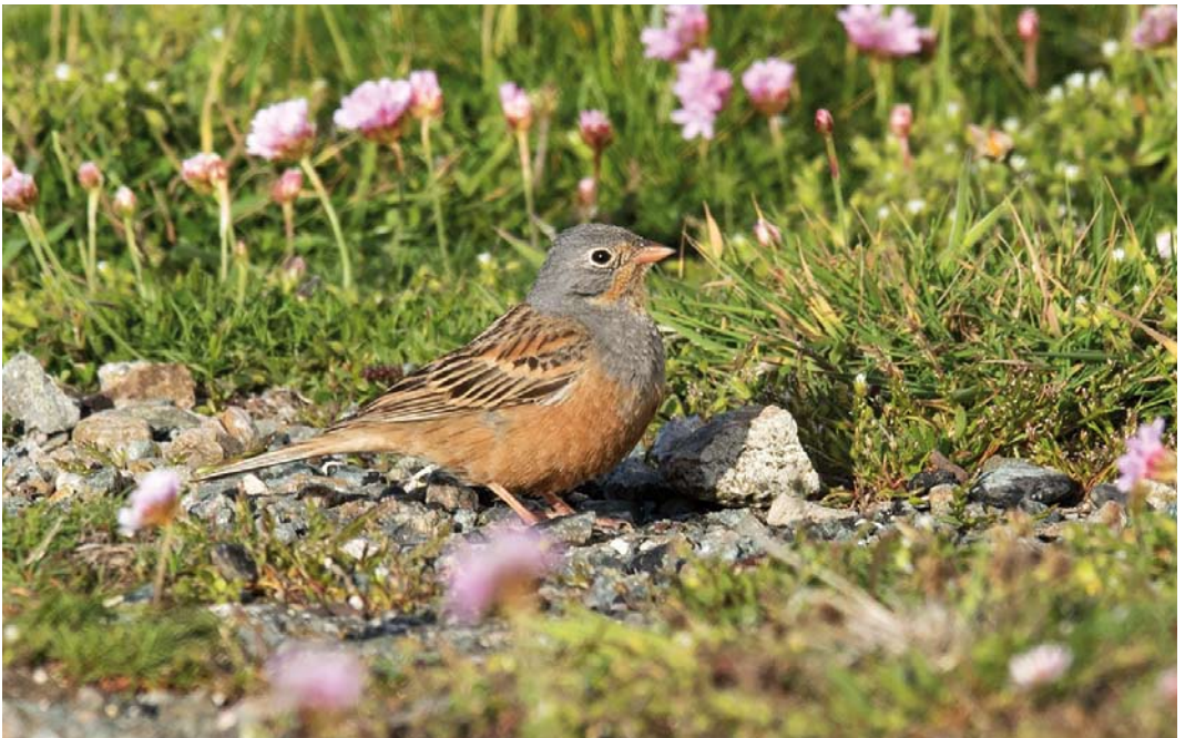
425 Cretzschmar's Bunting / Bruinkeelortolaan Emberiza caesia , male, Bardsey, Gwynedd, Wales, 14 June 2015 (Ben Porter)