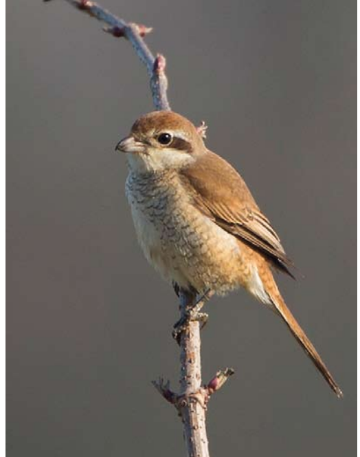
355 Bruine Klauwier / Brown Shrike Lanius cristatus , eerste-winter, Azewijnsche Broek, Gelderland, 4 maart 2014

haakvormige punt en beide helften sterk gekromd, vrij lange staart en naar verhouding grote kop. Handpenprojectie vrij kort, geschat 60-65%. Staart smal en getrap met afgeronde staartpunt. Buitenste pennen (in vlucht) zichtbaar korter dan rest (20-25%).