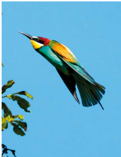
444 Roodsterblauwborst / Red-spotted Bluethroat Luscinia svecica svecica , mannetje, Blijham, Groningen, 24 juni 2015 (Co van der Wardt) 445 Bijeneter / European Bee-eater Merops apiaster , De Cocksdoorp, Texel, Noord-Holland, 10 juni 2015 (René Pop) 446 Citroenkwikstaart / Citrine Wagtail Motacilla citreola , eerste-zomer mannetje, Noordervroon, Westkapelle, Zeeland, 7 mei 2015 (Corstiaan Beeke)