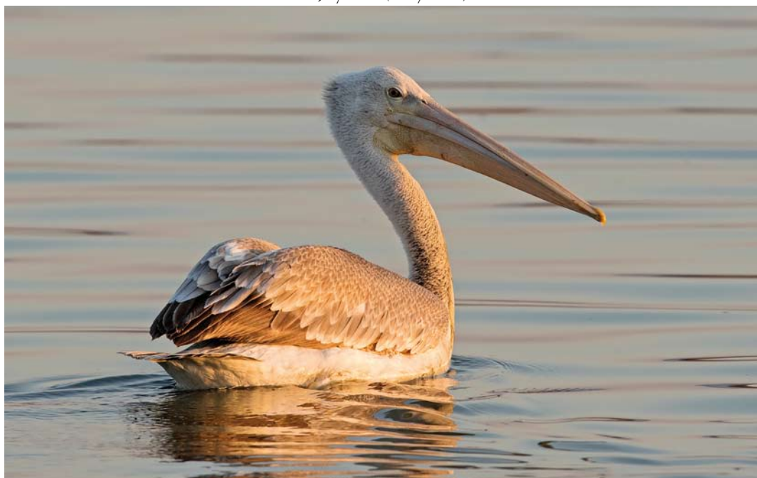
414 Pink-backed Pelican / Kleine Pelikaan Pelecanus rufescens , second calendar-year, Harod valley, Israel, 22 July 2015 ( Rony Livne )