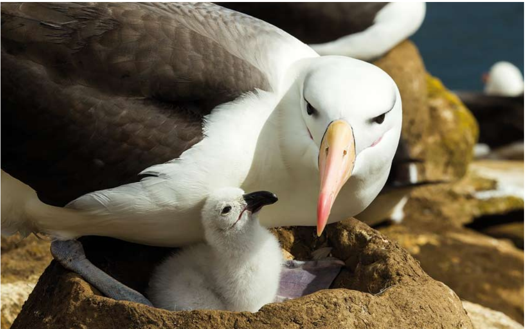
397 Black-browed Albatrosses / Wenkbrauwalbatrossen Thalassarche melanophris , Saunders Island, Falkland Islands, 23 December 2014