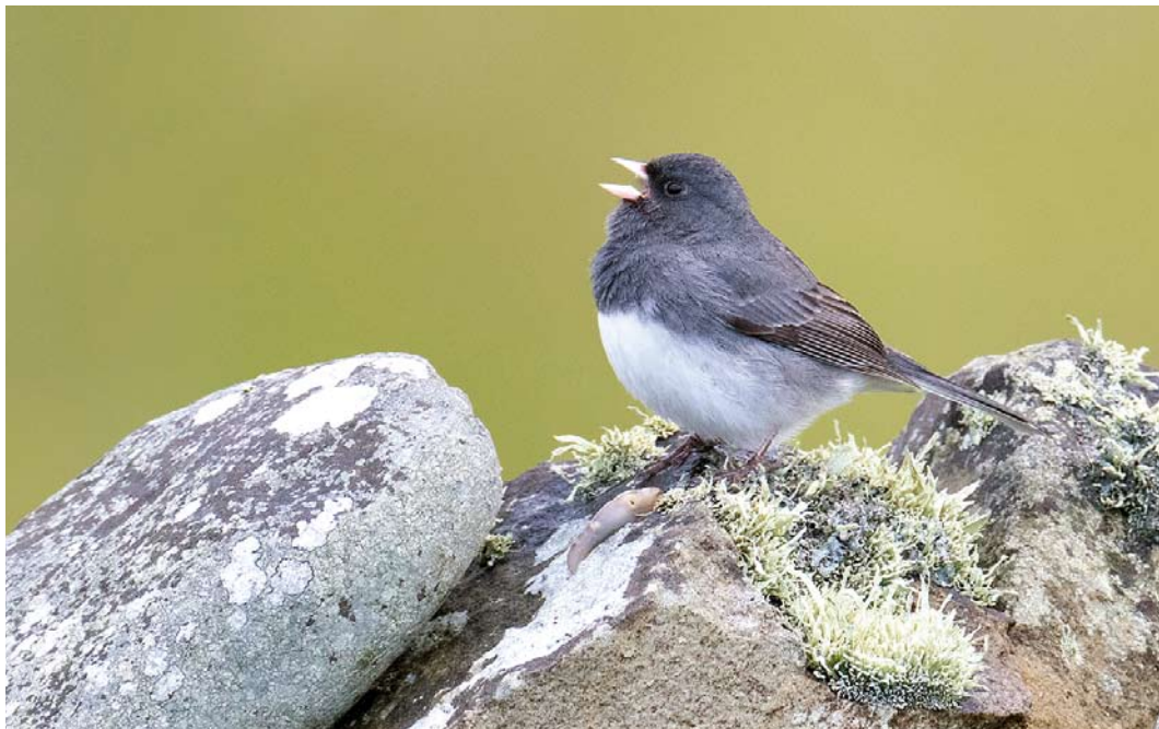
426 Dark-eyed Junco / Grijze Junco Junco hyemalis , Toab, Mainland, Shetland, 11 May 2015 (Hugh Harrop)