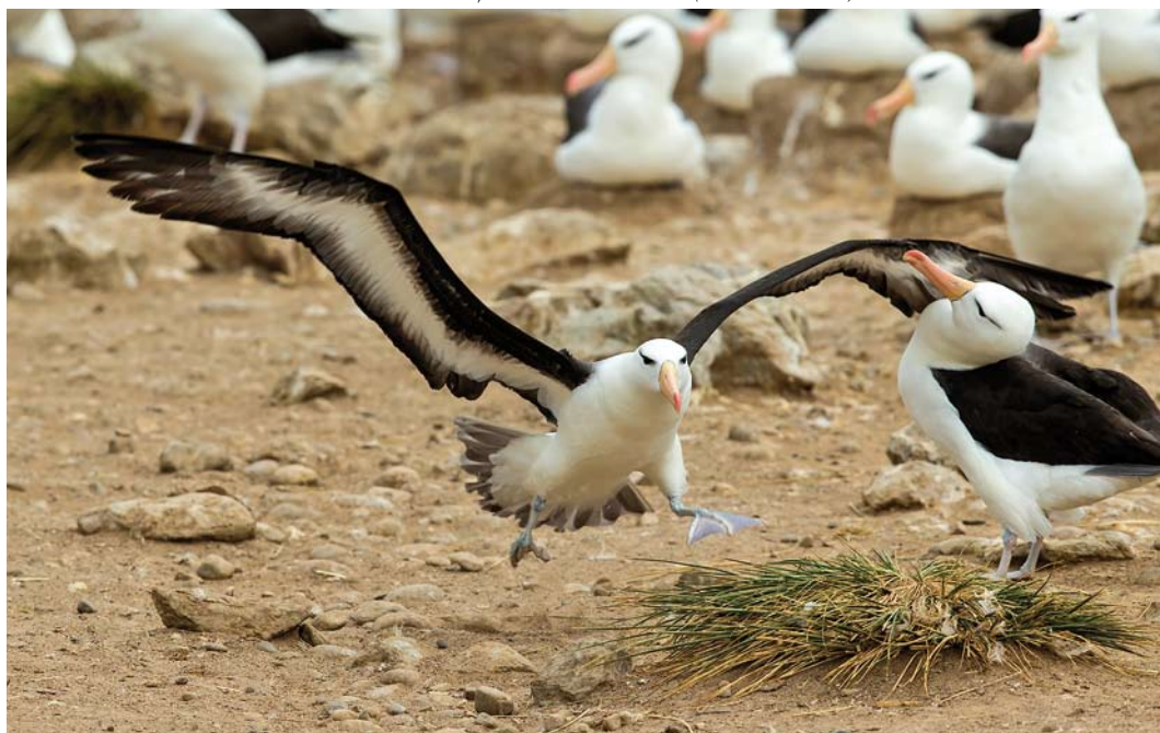
395 Black-browed Albatrosses / Wenkbrowwalbatrossen Thalassarche melanophris , Steeple Jason, Falkland Islands, 15 December 2014 ( Otto Plantema )