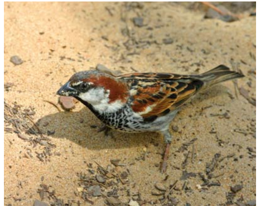
382 Italian Sparrow / Italiaanse Mus Passer italiae , adult male, rufous-breasted morph, Levico, Trentino, Italy, 5 August 2011 ( Edwin Winkel ). Moulting individual but outline and exposure of rufous-chestnut on breast obvious. 383 Italian Sparrow / Italiaanse Mus Passer italiae , adult male, rufous-breasted morph, Levico, Trentino, Italy, 13 August 2011 ( Edwin Winkel ). Adult moulting to 'winter' plumage. Fresh feather-tips covering rufous-brownish breast-patch. 384 Italian Sparrow / Italiaanse Mus Passer italiae , adult male, rufous-breasted morph, Viareggio, Toscana, Italy, 8 November 2008 ( Daniele Occhiato ). In fresh ('winter') plumage but wind revealing ground colour of breast-patch. 385 Hybrid House x Spanish Sparrow / Huisemus x Spaanse Mus Passer domesticus x hispaniolensis , adult male, El Acebuche, Huelva, Spain, 6 May 2005 ( Edwin Winkel ). This crossing does not necessarily produce outcome looking like Italian Sparrow P italiae . Black strings on belly and flank indicating hispaniolensis parenthood and grey on crown indicating domesticus influence.

strated more than a rufous touch, even under bad light conditions. They actually had rufous-brown breast-patch feathers, about the same colour as the head. One bird (plate 380) was still in breeding plumage and its complete 'black' patch showed a solid rufous base with only a sparsely black coating. Other birds (plate 382-383) were heavily moulting but their incomplete bibs still displayed the same pattern of coloration.