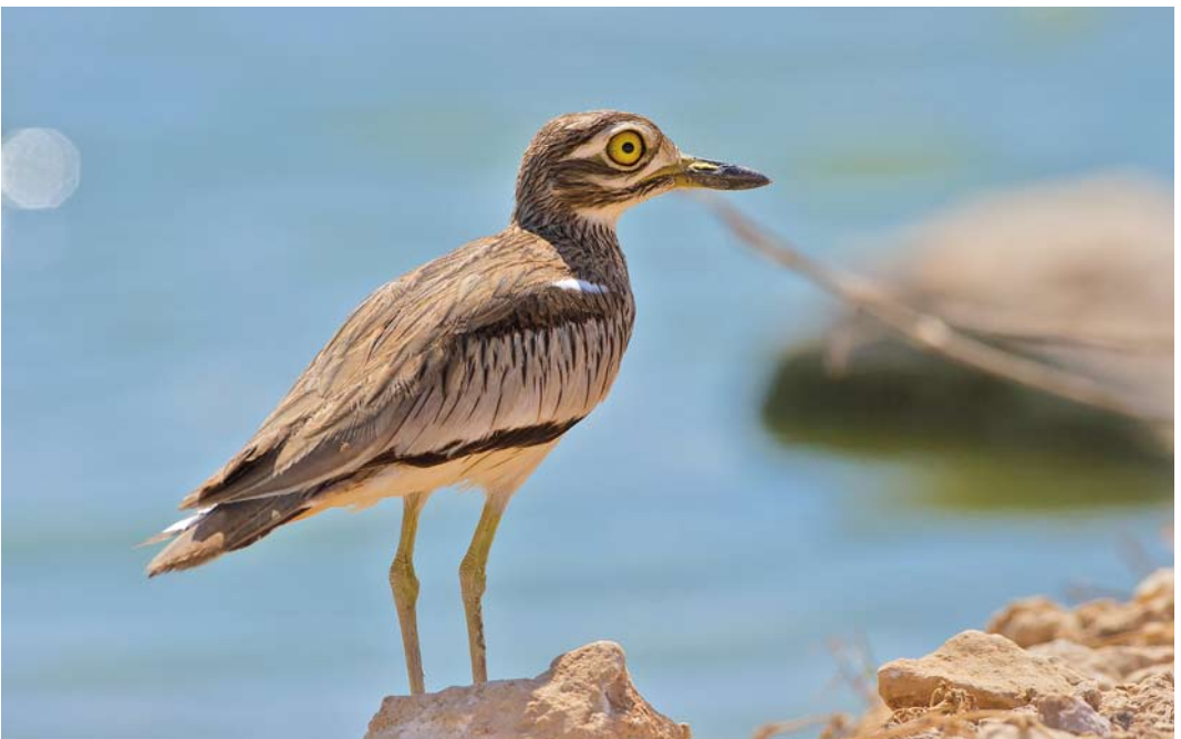
412 Senegal Thick-knee / Senegalese Griel Burhinus senegalensis , Ma'agan Michael, Israel, 8 July 2015