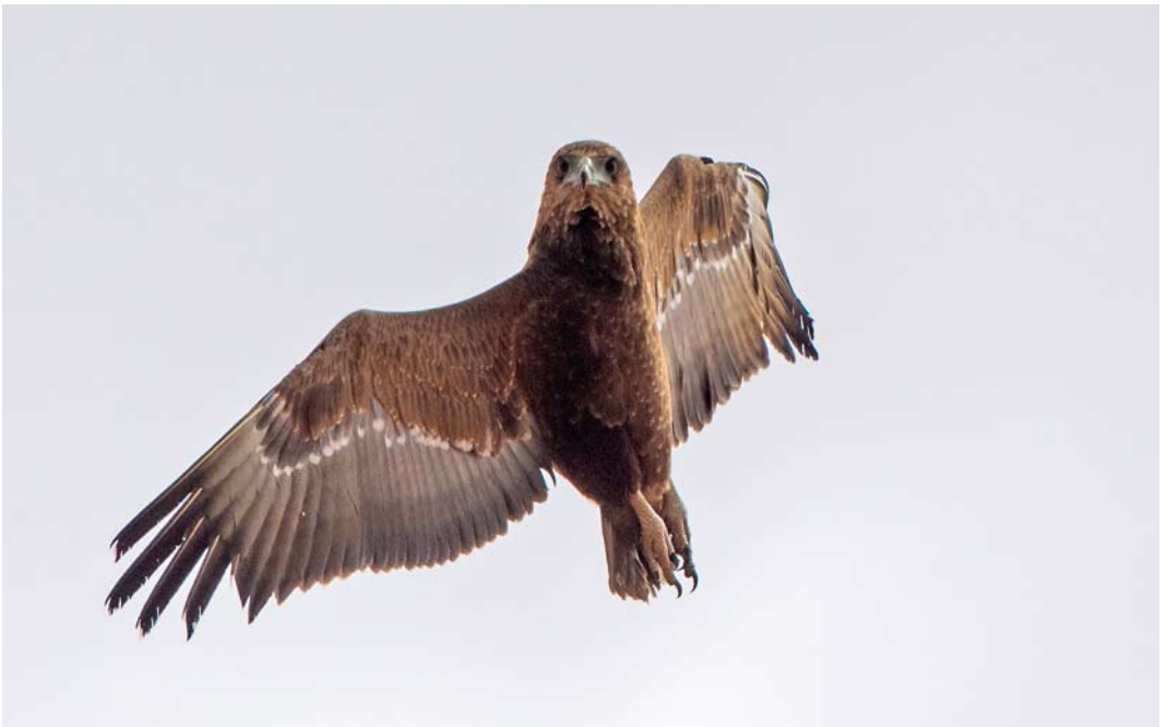
405 Bateleur / Bateleur Terathopius ecaudatus , second calendar-year, Gal'on, Judean Plains, Israel, 10 June 2015 ( David Monticelli )