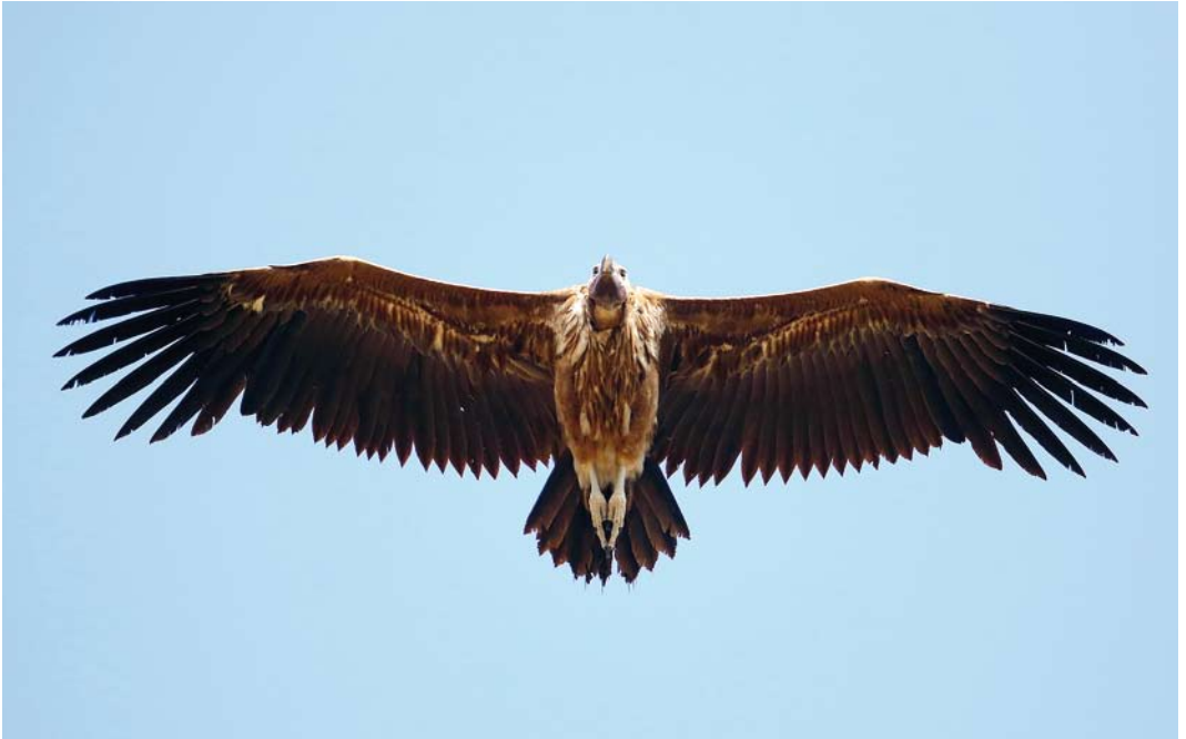
404 Lappet-faced Vulture / Oorgier Torgos tracheliotos , second calendar-year, Haibar Carmel, Haifa, Israel, 14 June 2015