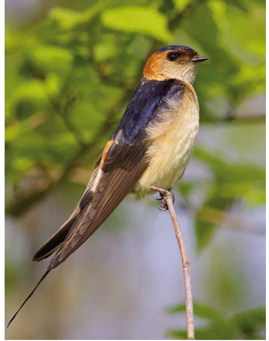
447 Roze Spreeuw / Rosy Starling Pastor roseus , Barneveld, Gelderland, 9 juni 2015 (Co van der Wardt) 448 Roodstuitzwaluw / Red-rumped Swallow Cecropis daurica , Den Hoorn, Texel, Noord-Holland, 17 mei 2015 (Diederik Kok) 449 Vermoedelijke Witbandkruisbek / presumed Two-barred Crossbill Loxia leucoptera , vrouwtje, met Kruisbek / Red Crossbill L. curvirostra , Uden, Noord-Brabant, 17 juni 2015 (Alexander Buil)