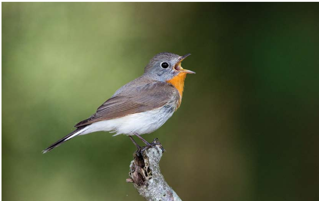
450 Kleine Vliegenvanger / Red-breasted Flycatcher Ficedula parva , adult mannetje, Schoonloo, Drenthe, 10 juni 2015