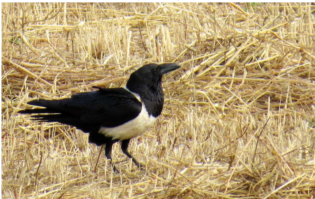
427 Pied Crow / Schildraaf Corvus albus , adult, Sesimbra, Setúbal, Portugal, 30 June 2015 (Luís Gordinho)