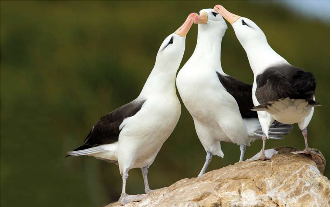
396 Black-browed Albatrosses / Wenkbrauwalbatrossen Thalassarche melanophris , Steeple Jason, Falkland Islands, 13 December 2014 (Otto Plantema)