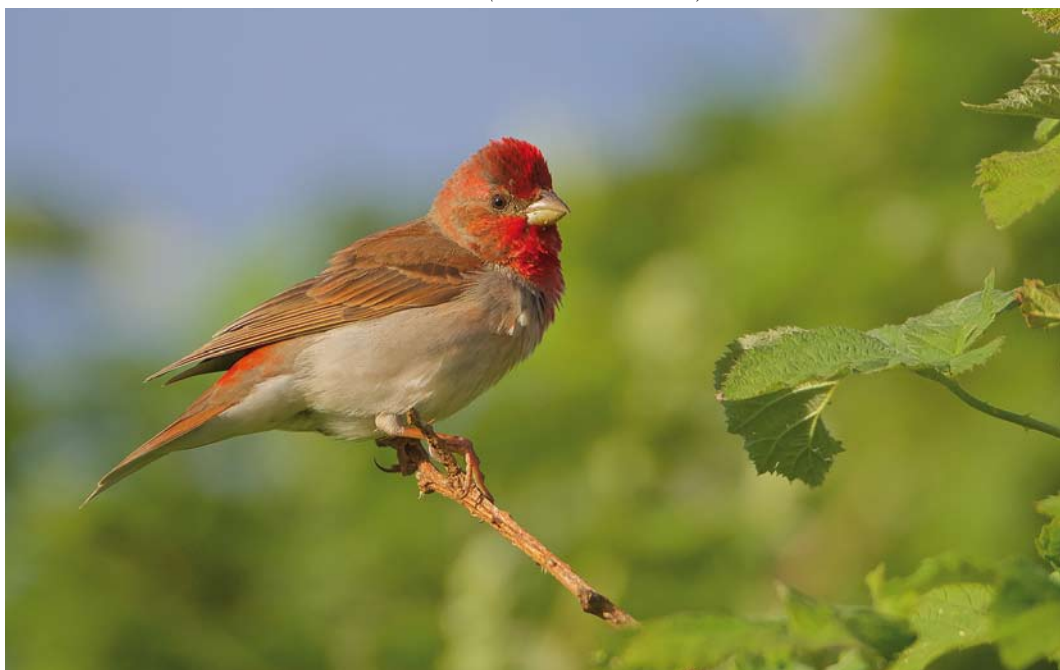
451 Roodmus / Scarlet Rosefinch Erythrina erythrina , adult mannetje, Katwijk aan den Rijn, Zuid-Holland, 30 mei 2015 (Martin van der Schalk)