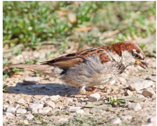
370 Hybrid House x Italian Sparrow / hybride Huismus x Italiaanse Mus Passer domesticus x italiae , adult male, Levico, Trentino, Italy, 5 August 2011 ( Edwin Winkel ). Typical and obvious hybrid. Remnants of grey crown clearly visible but small and not sharply defined. Grey also holds chestnut coloured spots, indicating italiae influence. Cheek still slightly darker than the white half-collar underneath, indicating domesticus ancestry. 371 Hybrid House x Italian Sparrow / hybride Huismus x Italiaanse Mus Passer domesticus x italiae , adult male, Levico, Trentino, Italy, 15 August 2011 ( Edwin Winkel ). Another evident hybrid with rather strong domesticus characteristics. Note darkish cheek and absence of any beige on back. Rudimentary grey crown, however, too narrow and irregular for pure domesticus . 372 Hybrid House x Italian Sparrow / hybride Huismus x Italiaanse Mus Passer domesticus x italiae , adult male, Levico, Trentino, Italy, 12 August 2011 ( Edwin Winkel ). Hybrid with dominating italiae features: strong anchor-shaped breast-patch and white cheek. Grey crown very narrow and grey, not beige. See also plate 373. 373 Hybrid House x Italian Sparrow / hybride Huismus x Italiaanse Mus Passer domesticus x italiae , adult male, Levico, Trentino, Italy, 12 August 2011 ( Edwin Winkel ). Same bird as in plate 372. Grey of crown better visible.

distinct feature is the breast-patch. In general, it is smaller than in italiae and, in domesticus , it rarely reaches the shoulder. The shape is again arrow-like but less pronounced than in italiae , caused by the white fringes which get broader as they reach the outline. The bill of domesticus is, on average, visibly smaller than in italiae .