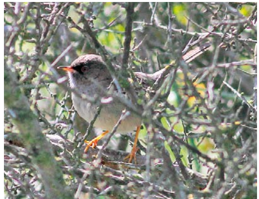
416 Pacific Loon / Pacifische Parelduiker Gavia pacifica , first-summer, Farsund, Vest-Agder, Norway, 12 July 2015 (Tor Olsen) 417 Namaqua Dove / Maskerduif Oena capensis , female, Safia, Oued Dahab, Morocco, 22 May 2015 (Abdeljebbar Qninba) 418 Cedar Waxwing / Cederpestvogel Bombycilla cedrorum , Tiree, Argyll & Bute, Scotland, 10 June 2015 (Keith Gillon) 419 Swainson's Thrush / Dverglijster Catharus ustulatus , Skokholm, Pembrokeshire, Wales, 4 June 2015 (David Aitken) 420 Black-headed Bunting / Zwartkopgors Emberiza melanocephala , female, Krynica Morska, Pomerania, Poland, 4 June 2015 (Andrzej Kośmicki) 421 Marmora's Warbler / Sardijnse Grasmus Sylvia sarda , male, Grenen, Nordjylland, Denmark, 4 June 2015 (Rune S Neergard)