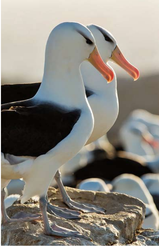
402 Black-browed Albatrosses / Wenkbrauwalbatrossen Thalassarche melanophris , Steeple Jason, Falkland Islands, 14 December 2014

Island (representing c 5% of the albatross population of the islands), where IS has carried out surveys since 1977. I met IS in 1979 on New Island; he is a keen birder and eager conversationalist, and landowner at that time. Figures clearly show that, between 1977 and 2007, the Black-browed population had increased by c 100% at a main breeding site on New Island known as Settlement Rookery. The same basic methodology of aerial photography surveys has continued up to 2010 for many sites in the Falkland Islands. These surveys thus show a very substantial increase of 43% for the eight most important breeding sites between 1986 and 2007, in contrast with reports of a decline in other studies. Steeple Jason's colony was