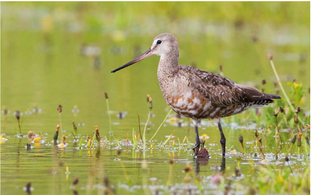
525 Hudsonian Godwit / Rode Grutto Limosa haemastica , adult, Inismor, Galway, Ireland, 17 September 2015 (David Monticelli)