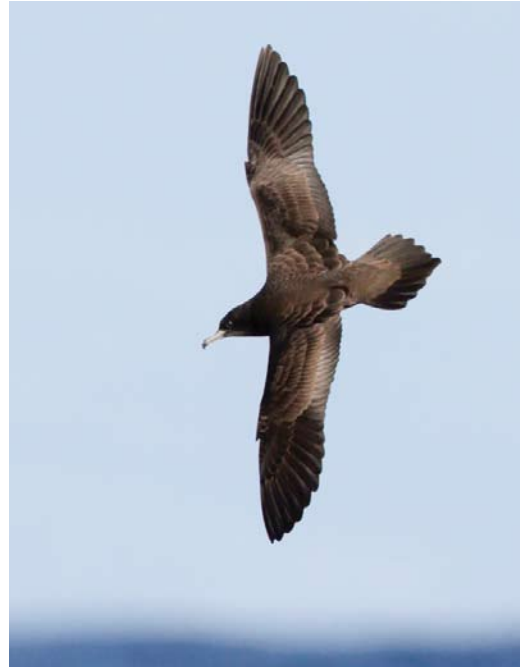
473 Wedge-tailed Shearwater / Wigstaartpijlstormvogel Puffinus pacificus , off Réunion, Indian Ocean, 11 December 2014 474 Wedge-tailed Shearwater / Wigstaartpijlstormvogel Puffinus pacificus , off Réunion, Indian Ocean, 7 December 2014

Few other tubenose species were encountered. Tubenose species most commonly observed were Wedge-tailed Shearwater and Tropical Shearwater P bailloni that both breed on Réunion. Less common were Bulwer's Petrel B bulwerii and Wilson's Storm Petrel Oceanites oceanicus . The latter species was only observed off St Gilles. Other common seabirds seen included White-tailed Tropicbird