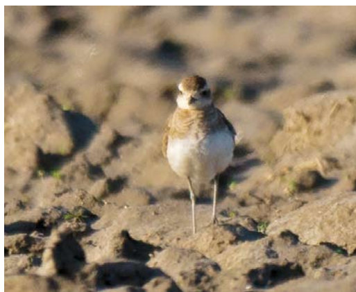
514 Kaspische Plevier / Caspian Plover Charadrius asiaticus , eerste-winter, Wissenkerke, Zeeland, 10 januari 2014 (Jaco Walhout) 515-517 Kaspische Plevier / Caspian Plover Charadrius asiaticus , eerste-winter, met Kieviten / Northern Lapwings Vanellus vanellus , Wissenkerke, Zeeland, 10 januari 2014 (Mark Hoekstein) 518-519 Kaspische Plevier / Caspian Plover Charadrius asiaticus , eerste-winter, Wissenkerke, Zeeland, 24 januari 2014 (Arnaud B van den Berg)