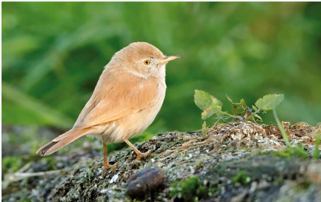
509 Afrikaanse Woestijngasmus / African Desert Warbler Sylvia deserti , Alphen aan den Rijn, Zuid-Holland, 29 november 2014 ( Michel Veldt )