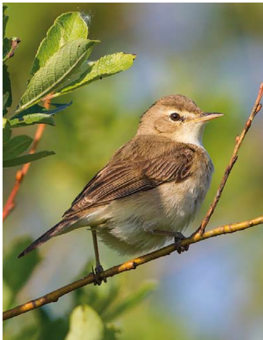
484 Booted Warbler / Kleine Spotvogel Iduna caligata , airport marshes near Bolshoy Istok, Yekaterinburg, Russia, 7 June 2014 (David Monticelli)