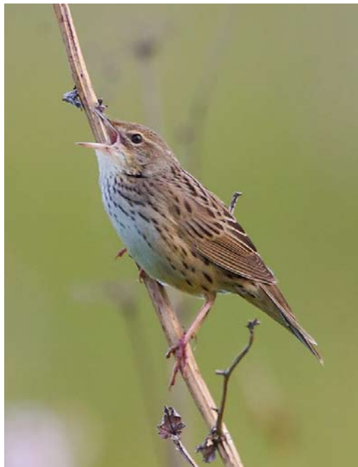
485 Lanceolated Warbler / Kleine Sprinkhaanzanger Locustella lanceolata , singing male, airport marshes near Bolshoy Istok, Yekaterinburg, Russia, 29 June 2014

mon in the area, even if localised, and further investigation of similar habitats in the area would probably produce sightings.