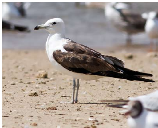
553 Vale Gier / Griffon Vulture Gyps fulvus , Harmelen, Utrecht, 7 augustus 20015 ( Michael Kars ) 554 Dwergarend / Booted Eagle Aquila pennata , lichte vorm, tweede-kalenderjaar, Veenklooster, Friesland, 2 juli 2015 ( Kees Bode ) 555 Grijsze Wouw / Black-winged Kite Elanus caeruleus , juveniel, Maashorst, Noord-Brabant, 4 augustus 2015 ( Alex Bos ) 556 Grijsze Wouw / Black-winged Kite Elanus caeruleus , adult, Marnewaard, Lauwersmeer, Groningen, 21 augustus 2015 ( Lazar Brinkhuizen ) 557 Roodpootvalk / Red-footed Falcon Falco vespertinus , juveniel, Vlieland, Friesland, 29 augustus 20015 ( Vincent Hart ) 558 Baltische Mantelmeeuw / Baltic Gull Larus fuscus fuscus , tweede-kalenderjaar, Arnhem, Gelderland, 26 juli 2015 ( Herman Bouman )