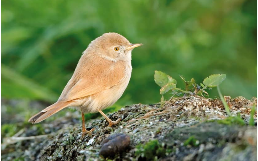
509 Afrikaanse Woestijngasmus / African Desert Warbler Sylvia deserti , Alphen aan den Rijn, Zuid-Holland, 29 november 2014 ( Michel Veldt )