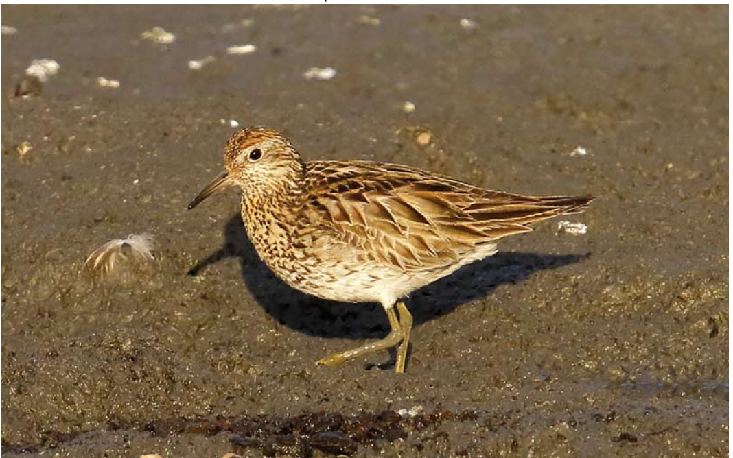
533 Sharp-tailed Sandpiper / Siberische Strandloper Calidris acuminata , adult, Camperduin, Noord-Holland, Netherlands, 7 September 2015