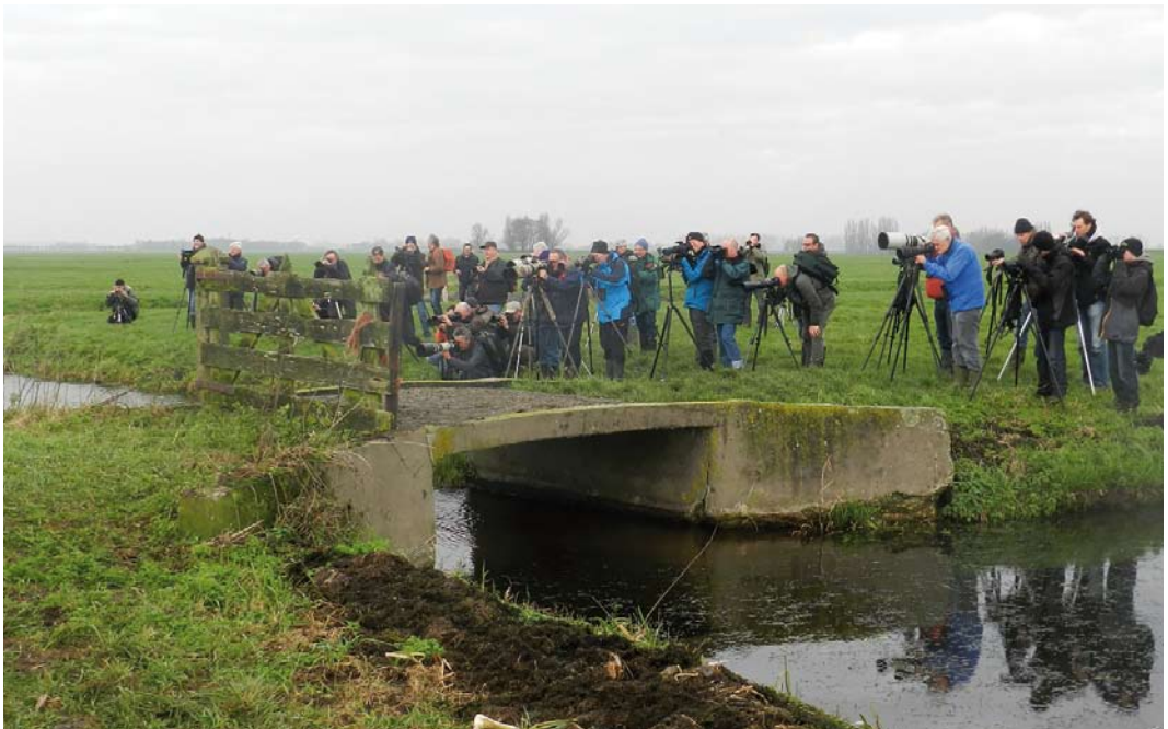
510 Vogelaars bij Afrikaanse Woestijngasmus Sylvia deserti , Alphen aan den Rijn, Zuid-Holland, 28 november 2014 ( Enno B Ebels )