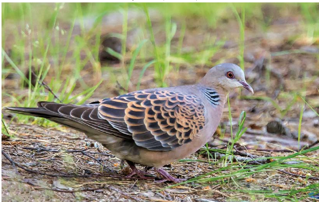
483 Rufous Turtle Dove / Meenatortel Streptopelia orientalis meena, near Nevyansk, Yekaterinburg, Russia, 17 June 2013