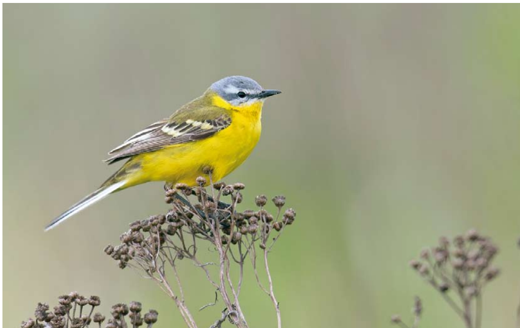
482 Sykes's Blue-headed Wagtail / Russische Gele Kwikstaart Motacilla flava beema , marshes east of Monetnyy, Yekaterinburg, Russia, 9 June 2015 ( Felix Timmermann )