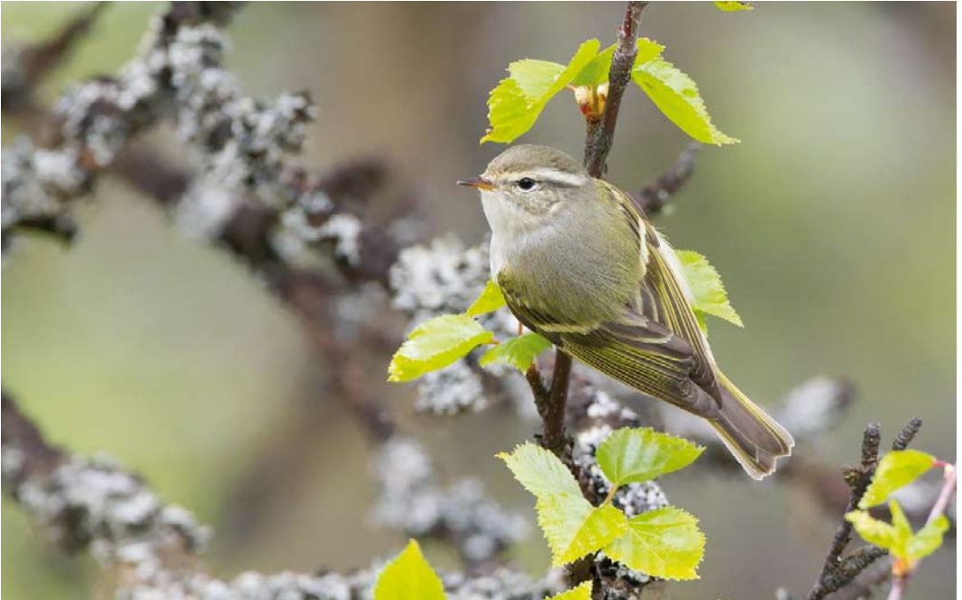
497 Yellow-browed Warbler / Bladkoning Phylloscopus inornatus , Ural ridge west of Severouralsk, Ural mountains, Russia, 11 June 2014 (David Monticelli)