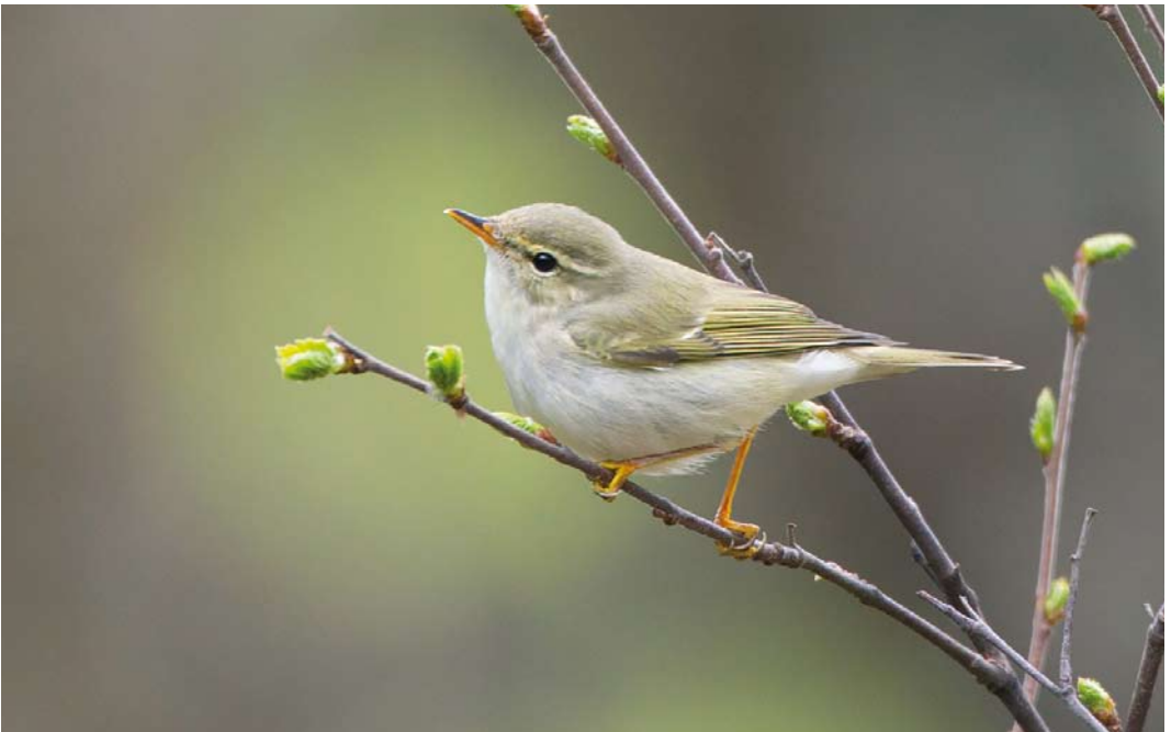
498 Arctic Warbler / Noordse Boszanger Phylloscopus borealis , Ural ridge west of Severouralsk, Ural mountains, Russia, 10 June 2014 (David Monticelli)