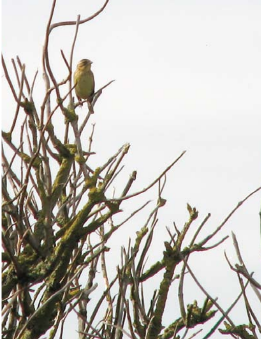
522 Yellow-breasted Bunting / Wilgengors Emberiza aureola , female or first-year, Boschplaat, Terschelling, Friesland, Netherlands, 11 September 2010. The most recent Yellow-breasted Bunting in the Netherlands.

follow the same fate: in 2011, Chinese police confiscated two million songbirds in two cities, including many buntings of various species. (Kamp et al 2015). However, with international support against these illegal trapping events, it may be possible to reverse these dramatic declines. A first step is made, as the Convention on Migratory Species has agreed to develop an international action plan for the recovery of Yellow-breasted Bunting populations and to combat illegal trapping throughout the world (CMS 2015).