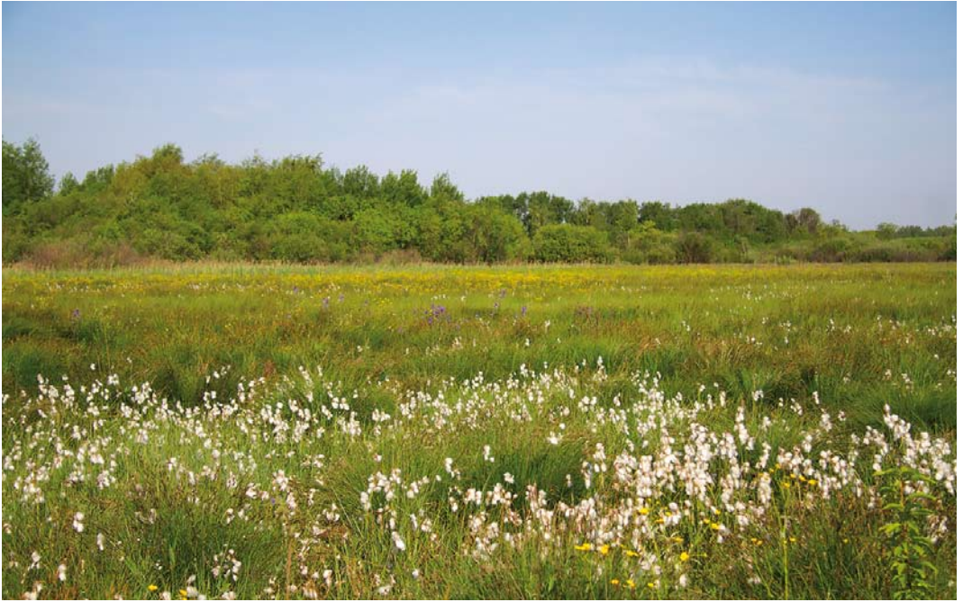
479 Airport marshes near Bolshoy Istok, Yekaterinburg, Russia, 19 June 2013 ( Eric Didner ) 480 Azure Tit / Azuurmees Cyanistes cyanus , marshes east of Monetnyy, Yekaterinburg, Russia, 8 June 2014 ( David Monticelli ) 481 Long-tailed Rosefinch / Langstaartroodmus Carpodacus sibiricus , marshes east of Monetnyy, Yekaterinburg, Russia, 8 June 2014 ( David Monticelli )