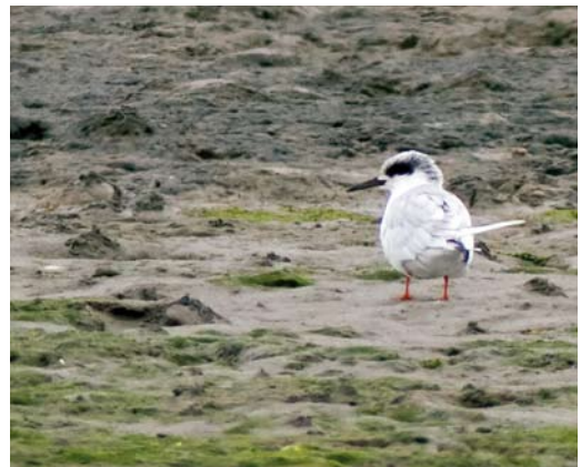
526 Dalmatian Pelican / Kroeskoppelikaan Pelecanus crispus, second calendar-year, Występ, Kujawsko-Pomorskie, Poland, 15 August 2015 527 Atlantic Great Cormorant / Grote Aalscholver Phalacrocorax carbo carbo, first-year, Artis, Amsterdam, Noord-Holland, Netherlands, 14 August 2015. Ringed as nestling in Västergötland, Sweden, on 9 June 2015. 528 Sooty Tern / Bonte Stern Onychoprion fuscatus, juvenile, Ilheu da Praia, Graciosa, Azores, 25 August 2015 529 Forster's Tern / Forsters Stern Sterna forsteri, adult, Rogerstown Estuary, Dublin, Ireland, 7 September 2015

naultii were seen at Dieksanderkoog, Schleswig-Holstein, Germany, on 19-31 July; at Clauen, Niedersachsen, Germany, on 20-22 July; and at Hyères, Var, France, on 7-8 August (second-year). An adult female Lesser Sand Plover C atrifrons was found on Lanzarote, Canary Islands, on 7 August. If accepted, a Caspian Plover C asiaticus at Ruan, Loiret, from 11 September will be the fifth for France. An Upland Sandpiper Bartramia longicauda at Banc d'Arguin on 5 September was the second for Mauritania (the first was in 1986) and the third for Africa. Adult Sharp-tailed Sandpipers Calidris acuminata stayed at Camperduin, Noord-Holland, the Netherlands, from 6 to at least 17 September, and at Langåker, Lista, Vest-Agder, Norway, on 7 September. In the Azores, no less than 40 White-rumped Sandpipers C fuscicollis were present at Ponta de Escalvado, São Miguel, on 23 August. Others were found in July-August in Britain (at least