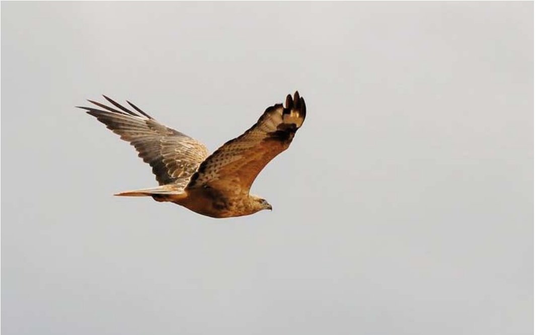
537 Long-legged Buzzard / Arendbuizerd Buteo rufinus , second calendar-year, Goddelsheimer Hochfläche, Hessen, Germany, 19 September 2015 (Martin Gottschling)