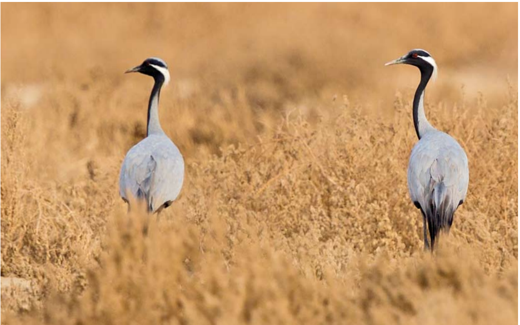
538 Demoiselle Cranes / Jufferkraanvogels Grus virgo , adult, Jahra pools reserve, Kuwait, 13 September 2015 (AbdulRahman Al-Sirhan)