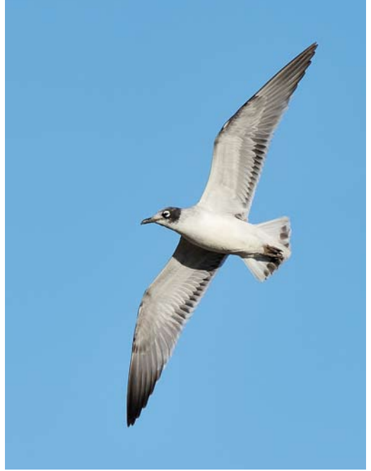
57 Laughing Gull / Lachmeeuw Larus atricilla , first-winter, Genova, Liguria, Italy, 30 December 2014 58 Franklin's Gull / Franklins Meeuw Larus pipixcan , first-winter, Sigean, Aude, France, 21 December 2014 59 Spotted Sandpiper / Amerikaanse Oeverloper Actitis macularius , Medemblik, Noord-Holland, Netherlands, 23 January 2015