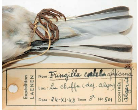
FIGURE 3 Common Chaffinch / Vink Fringilla coelebs , typical adult male (upper left), compared with Afrikaanse Vink F c spodiogenys/africana , adult male (lower) (Lorenzo Starnini). Note 'half dark, half white' tail and more extensive and more pure white on wing of spodiogenys/africana . 594 Atlas Chaffinch / Atlasvink Fringilla coelebs africana , adult male, Taroudant, Morocco, 25 March 2013 (Michele Viganò/MISC). Note striking half white tail with round white drop also on t3. Note also very pale grey lesser coverts (usually darker, often blackish tinged, in Common Chaffinch F coelebs ) with white extending onto median coverts too, making white wing-patch very broad. 595 Atlas Chaffinch / Atlasvink Fringilla coelebs africana , adult male (collected at Ouarsenis, Algeria, on 6 April 1925), Muséum National d'Histoire Naturelle, Paris, France, 20 February 2015 (Andrea Corso/©MNHN). Typical outer tail pattern of African Chaffinch F c spodiogenys/africana , showing extensive white on t4-6. 596 Atlas Chaffinch / Atlasvink Fringilla coelebs africana , adult male (collected at Djebel Cheffa, Algeria, on 24 November 1948), Muséum National d'Histoire Naturelle, Paris, France, 18 February 2015 (Andrea Corso/©MNHN). Same bird as in plate 601. Tail from below, showing how tail can appear almost fully white in some views.