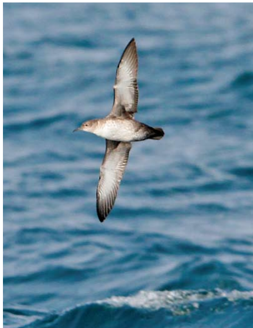
654 Aziatische Roodborsttapuit / Siberian Stonechat Saxicola maurus , Vlieland, Friesland, 5 oktober 2015 655 Vale Pijlstormvogel / Balearic Shearwater Puffinus mauretanicus , Noordzee (ten zuidwesten van Den Helder, Noord-Holland), Continentaal Plat, 4 oktober 2015 656 Siberische Strandloper / Sharp-tailed Sandpiper Calidris acuminata , adult, Camperduin, Noord-Holland, 9 september 2015