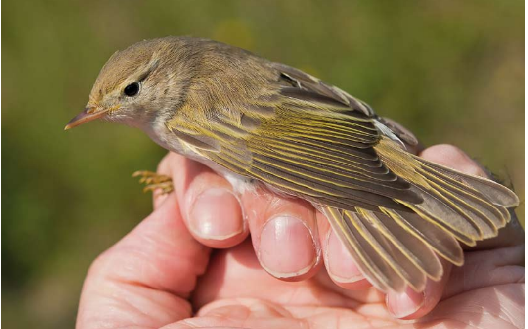
581 Western Bonelli's Warbler / Bergfluitier Phylloscopus bonelli , Bloemendaal, Noord-Holland, 4 September 2014