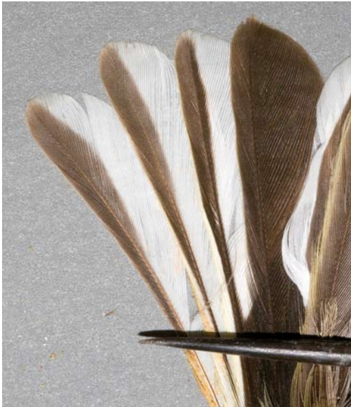
610 Cyrenaica Chaffinch / Cyrenaicavink Fringilla coelebs harterti, female (collected at Ain Mara, Cyrenaica, Libya, on 15 January 1939), Istituto Superiore per la Protezione e la Ricerca Ambientale, Bologna, Italy, 23 March 2015. Note rather long white 'wedge' on t3. 611 Cyrenaica Chaffinch / Cyrenaicavink Fringilla coelebs harterti, male (collected at Wadi el Cuf, Cyrenaica, Libya, on 20 January 1939), Istituto Superiore per la Protezione e la Ricerca Ambientale, Bologna, Italy, 23 March 2015. Note that also this subspecies shows extensively white on outer three tail-feathers. 612 Cyrenaica Chaffinch / Cyrenaicavink Fringilla coelebs harterti, female (collected at Wadi el Cuf, Cyrenaica, Libya, on 20 January 1939), Istituto Superiore per la Protezione e la Ricerca Ambientale, Bologna, Italy, 23 March 2015