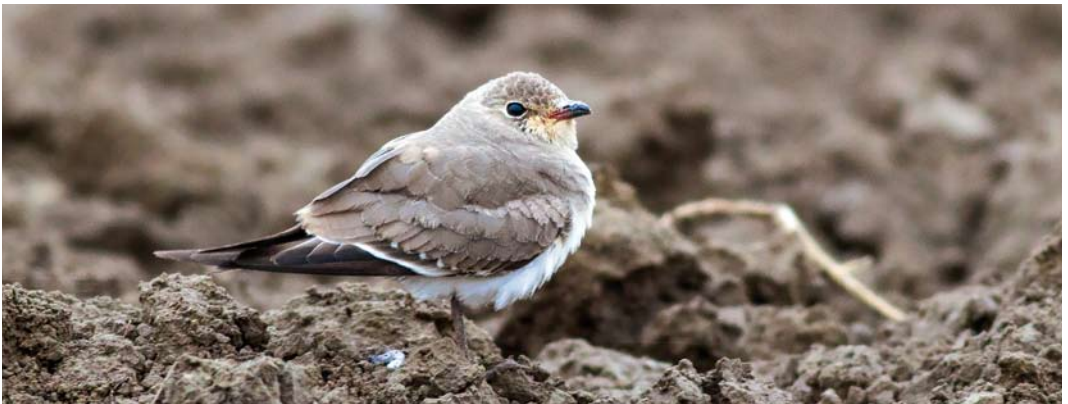
659 Zwartkeellijster / Black-throated Thrush, Turdus atrogularis , vrouwtje, Loodsmansduin, Texel, Noord-Holland, 17 oktober 2015 ( Debby Doodeman ) 660 Zwartkeellijster / Black-throated Thrush, Turdus atrogularis , vrouwtje, Loodsmansduin, Texel, Noord-Holland, 17 oktober 2015 ( Michiel Bosch ) 661 Ross' Gans / Ross's Goose Anser rossii , blauwe vorm, Milsbeek, Limburg, 21 oktober 2015 ( Ran Schols ) 662 Izabeltapuit / Isabelline Wheatear Oenanthe isabellina , Ijmuiden, Noord-Holland, 9 oktober 2015 ( Rutger Rotscheid ) 663 Vorkstaartplevier / Collared Pratincole Glareola pratincola , Westdorpe, Zeeland, 18 oktober 2015 ( Corstiaan Beeke )