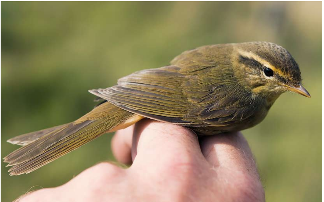
582 Radde's Warbler / Raddes Boszanger Phylloscopus schwarzi , Bloemendaal, Noord-Holland, 11 October 2014