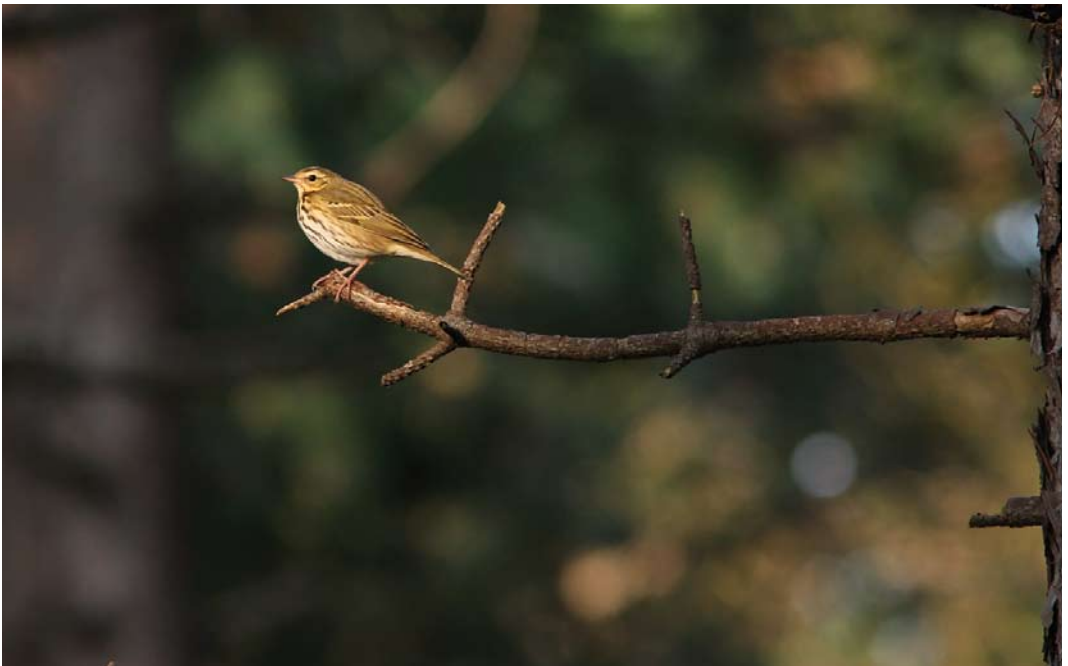
590 Olive-backed Pipit / Siberische Boompieper Anthus hodgsoni , Vlieland, Friesland, 4 October 2014