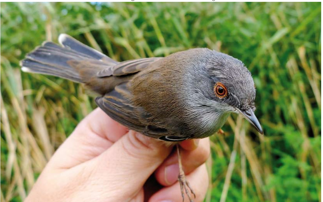
638 Sardinian Warbler / Kleine Zwartkop Sylvia melanocephala , adult female, Schlammwiss, Schuttrange, Luxembourg, 3 October 2015 (Patric Lorgé)