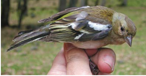
619 Atlas Chaffinch / Atlasvink Fringilla coelebs africana , breeding female, Ifrane, Middle Atlas, Morocco, 1 May 2011 (José Luis Copete). Note that this female, ringed on breeding grounds, belongs to darker variant female africana , closest to female Common Chaffinch F c coelebs . In this bird, single most reliable identification plumage character is tail pattern, in addition to calls.

proving the manuscript. AC's visit to MNHN was made possible by the Dutch Birding Fund ( www.dutchbirding.nl/page.php?page_id=38&lang=en ).