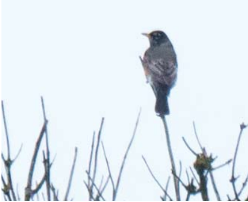
591 Roodborstlijster / American Robin Turdus migratorius , mannetje, Noordhollands Duinreservaat, Heemskerk, Noord-Holland, 27 April 2014 (Arnoud B van den Berg)