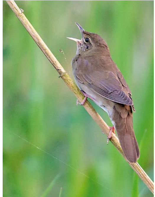
583 Booted Warbler / Kleine Spotvogel Iduna caligata , Nieuwe Stuifdijk, Maasvlakte, Zuid-Holland, 17 September 2014 ( Rob Half ) 584 River Warbler / Krezelzanger Locustella fluviatilis , Dordtse Biesbosch, Zuid-Holland, 25 May 2014 ( Hans Gebuis ) 585 African Desert Warbler / Afrikaanse Woestijngrasmus Sylvia deserti , Polder Gnephoek, Alphen aan den Rijn, Zuid-Holland, 29 November 2014 ( Michel Veldt )