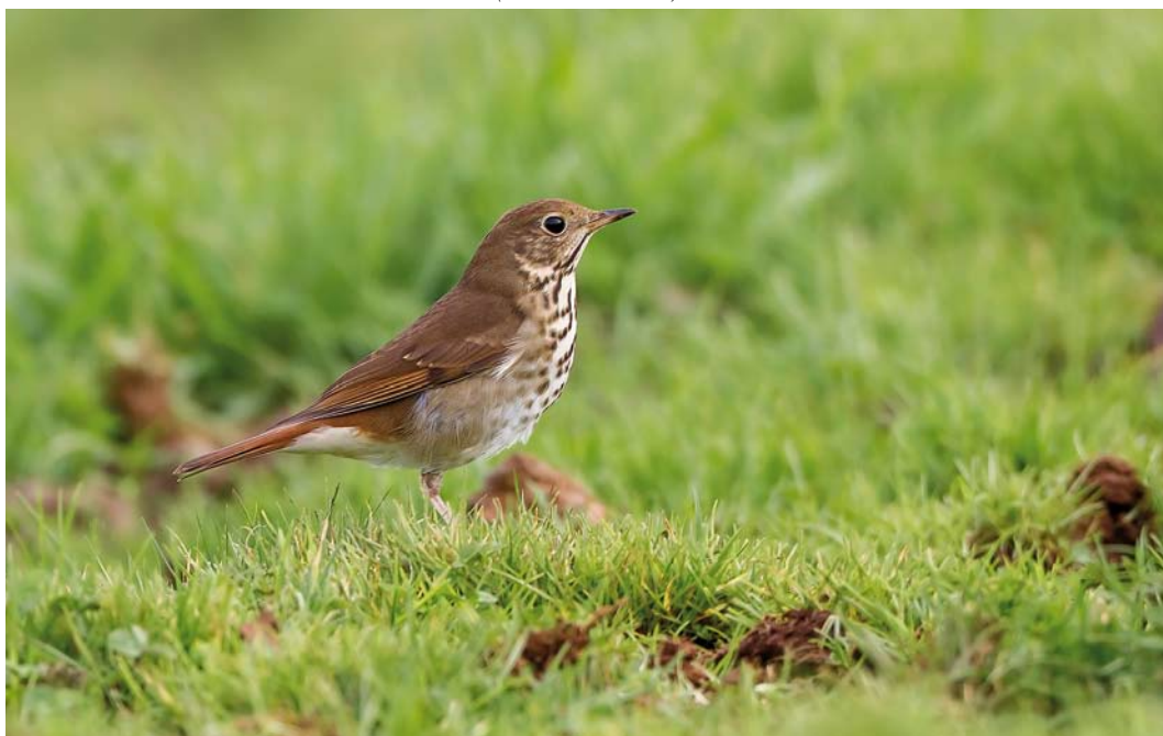
642 Hermit Thrush / Heremietlijster Catharus guttatus , first-year, Corvo, Azores, 24 October 2015