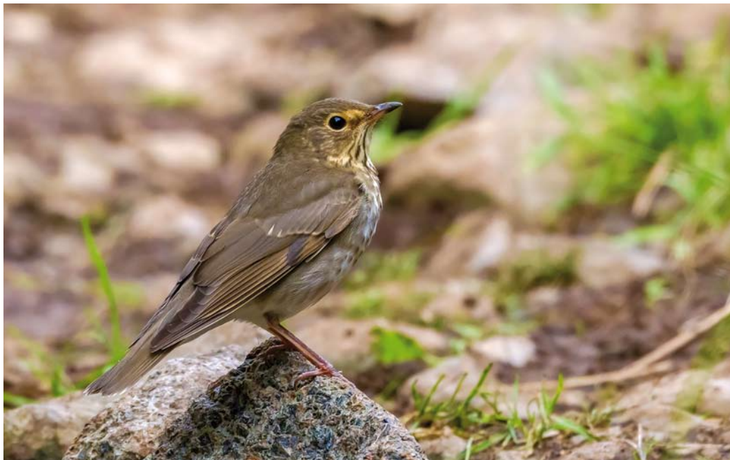
641 Swainson's Thrush / Dwerglijster Catharus ustulatus , first-year, Corvo, Azores, 20 October 2015 (Vincent Legrand)