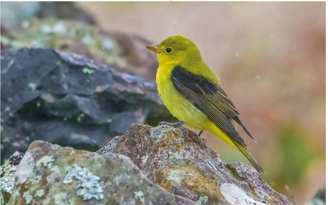
646 Scarlet Tanager / Zwartvleugeltangare Piranga olivacea , first-year male, Corvo, Azores, 17 October 2015 ( Vincent Legrand )