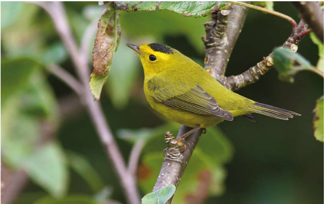
650 Wilson's Warbler / Wilsons Zanger Cardellina pusilla , male, Lewis, Outer Hebrides, Scotland, 16 October 2015