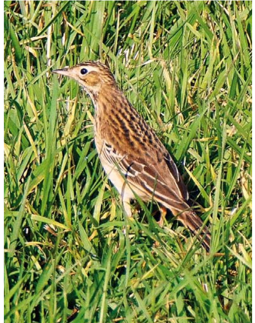
664 Woestijntapuit / Desert Wheatear Oenanthe deserti , mannetje, De Grië, Terschelling, Friesland, 9 oktober 2015 ( Arie Ouwerkerk ) 665 Mongoolse Pieper / Blyth's Pipit Anthus godlewskii , Crezéepolder, Ridderkerk, Zuid-Holland, 1 november 2015 ( Jan den Hertog ) 666 Bonte Tapuit / Pied Wheatear Oenanthe pleschanka , vrouwtje, Jachthaven, Schiermonnikoog, Friesland, 23 oktober 2015 ( Thijs Glastra )