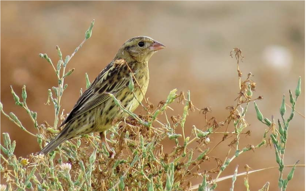
645 Bobolink / Bobolink Dolichonyx oryzivorus , adult, Puerto del Carmen, Lanzarote, Canary Islands, 1 October 2015 ( Francisco Javier García Vargas )