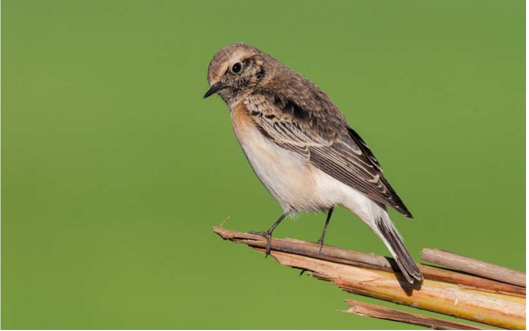
586 Pied Wheatear / Bonte Tapuit Oenanthe pleschanka , first-year male, Polder Groenendijk, Zoeterwoude, Zuid-Holland, 13 November 2014 587 Isabelline Wheatear / Izabeltapuit Oenanthe isabellina , Missouriweg, Maasvlakte, Zuid-Holland, 28 September 2014 588 Daurian Shrike / Daurische Klauwier Lanius isabellinus , first-year, Wimmenummerduinen, Egmond aan Zee, Noord-Holland, 18 October 2014