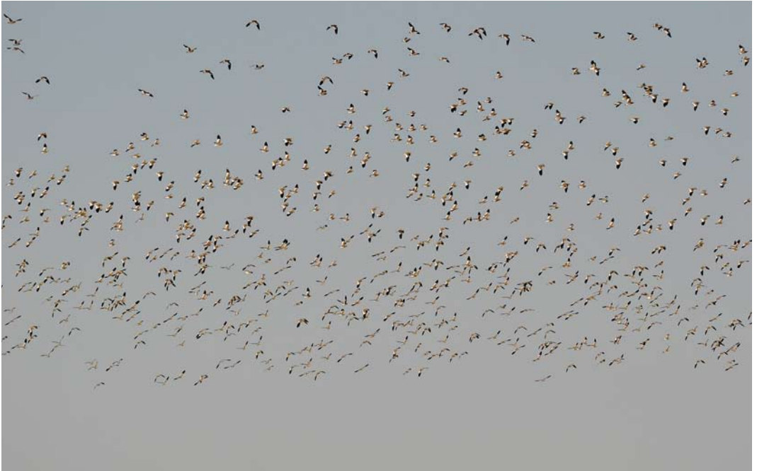
624 Sociable Lapwings / Steppiekieviten Vanellus gregarius , Talimarjan, Uzbekistan, 25 September 2015 625 Gyr Falcon / Giervalk Falco rusticolus , first-year, Rickelsbüller Koog, Schleswig-Holstein, Germany, 31 October 2015 626 Black-winged Kite / Grijsze Wouw Elanus caeruleus , Kootwijkerveld, Gelderland, Netherlands, 14 November 2015