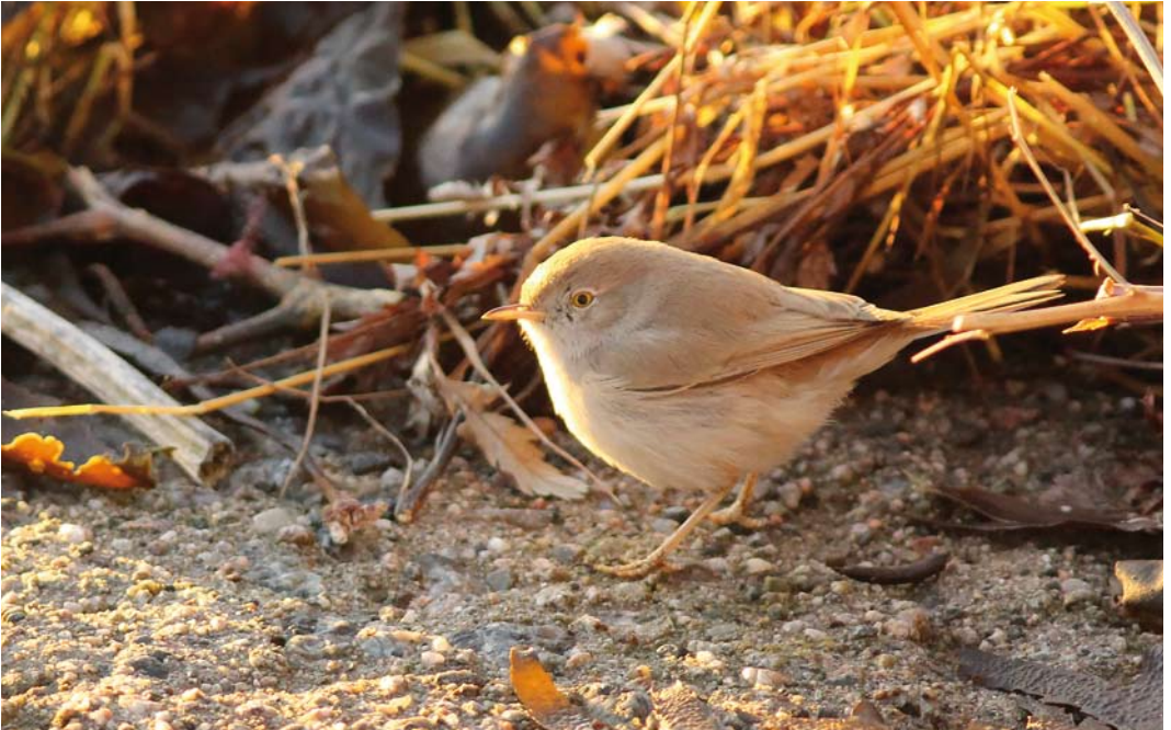
639 Asian Desert Warbler / Woestijngasmus Sylvia nana , Rakke, Vestfold, Norway, 12 November 2015