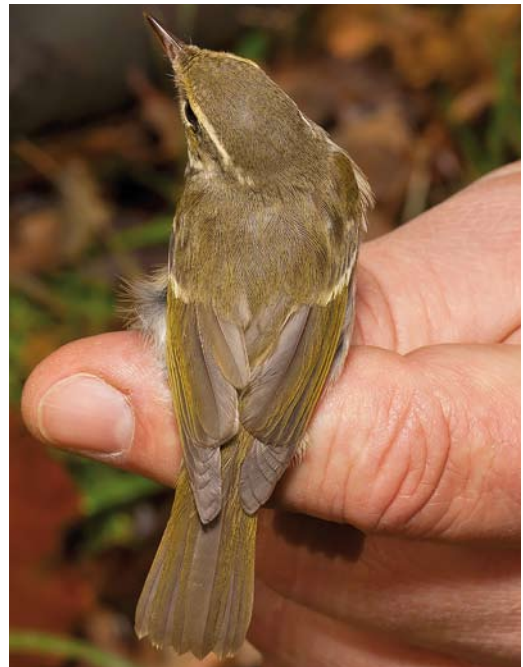
148 Swinhoes Boszanger / Two-barred Warbler Phylloscopus plumbeitarus , Kamperhoek, Flevoland, 23 november 2013 (Mervyn Roos)

STAART Staartpennen bruin. Top van t4-6 (van binnen naar buiten genummerd) op binnenvlag met smalle lich-