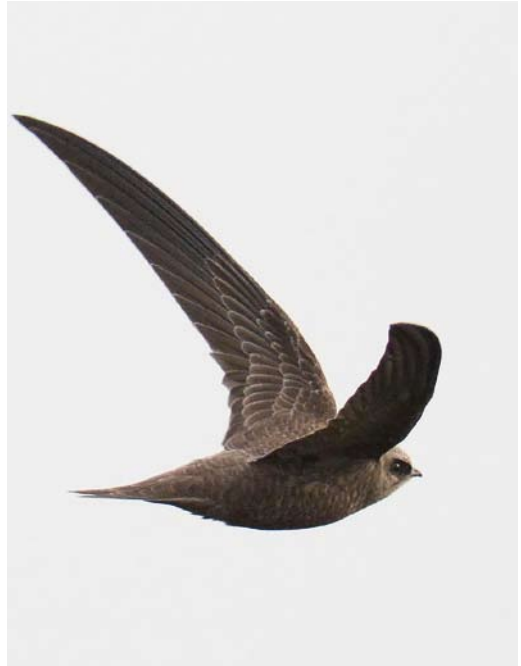
185 Grijsze Wouw / Black-winged Kite Elanus caeruleus , Kootwijkse Veld, Gelderland, 14 november 2015 ( Martin van der Schalk ) 186 Vale Gierzwaluw / Pallid Swift Apus pallidus , eerstejaars, Ijmuiden, Noord-Holland, 8 november 2015 ( Edial Dekker ) 187 Zwartbuikwaterspreeuw / Black-bellied Dipper Cinclus cinclus cinclus , Zutphen, Gelderland, 4 december 2015 ( Martin van der Schalk )