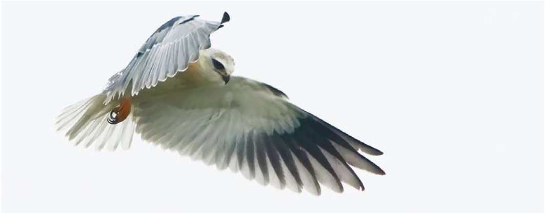
653 Black-winged Kite / Grijze Wouw Elanus caeruleus , juveniel, Maashorst, Noord-Brabant, 4 August 2015 (Michel Veldt)

ond calendar-year, photographed (M van Kleinwee). 2014 26 September, Strand Berkheide, Katwijk, Zuid-Holland, first calendar-year, wearing colour-ring, photographed (E Schouten via B van der Burg).