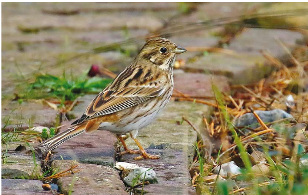
734 Witkopgors / Pine Bunting Emberiza leucocephalos , Oost-Vlieland, Vlieland, Friesland, 21 oktober 2016