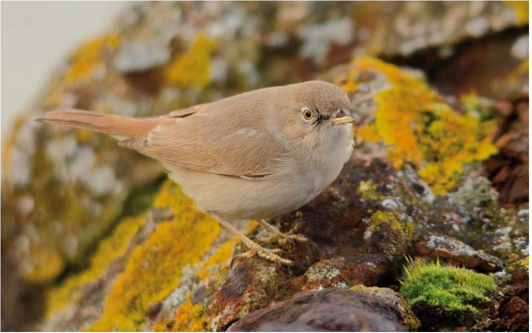
655 Asian Desert Warbler / Woestijngrasmus Sylvia nana , West-Terschelling, Terschelling, Friesland, 16 November 2015 ( John van der Graaf ) 656 Red-tailed Shrike / Turkestaanse Klauwier Lanius phoenicuroides , first-year, Noordhollands Duinreservaat, Castricum, Noord-Holland, 13 November 2014 ( Tim van der Meer ) 657 Kleine Spotvogel / Booted Warbler Iduna caligata , first-year, Noordhollands Duinreservaat, Castricum, Noord-Holland, 23 August 2015 ( Leo P Heemskerck )