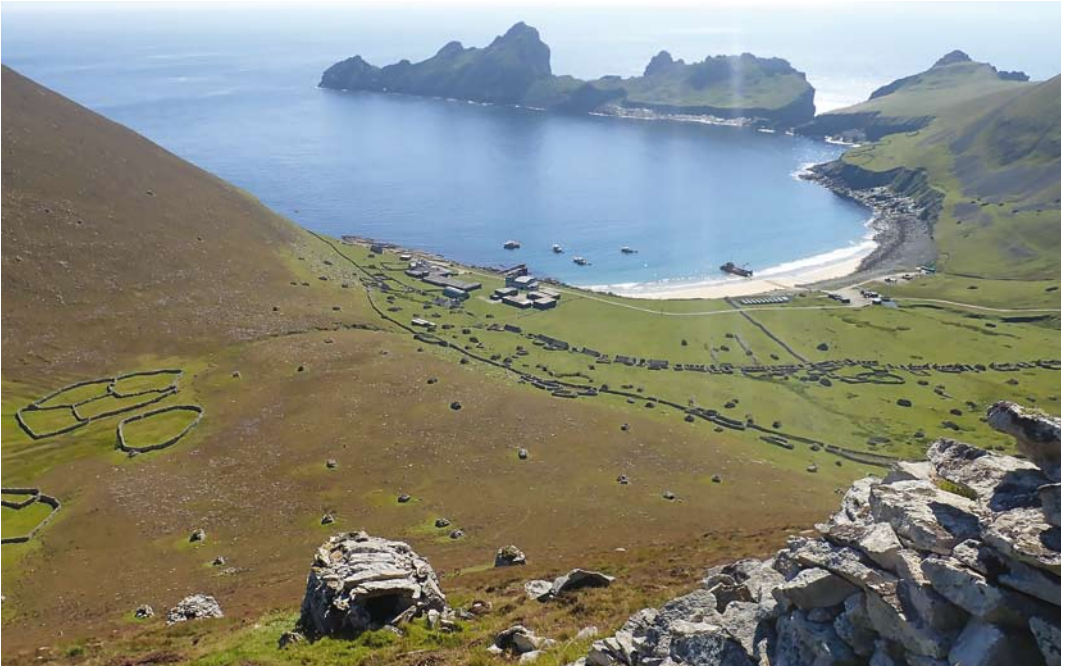
670-671 Hirta, St Kilda, Scotland, 26 August 2014 ( Peter de Vries ). St Kilda Wren Troglodytes troglodytes hirtensis breeds between the remains of the former village.