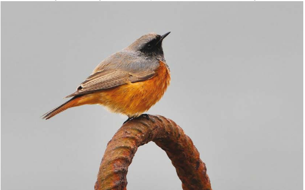
710 Eastern Black Redstart / Oosterse Zwarte Roodstaart Phoenicurus ochruros phoenicuroides , first-winter male, Helgoland, Schleswig-Holstein, Germany, 6 November 2016 ( Martin Gottschling )