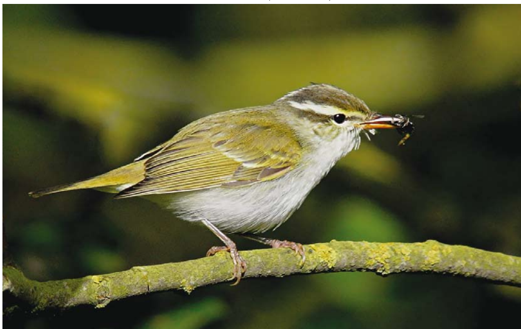
702 Eastern Crowned Warbler / Kroonboszanger Phylloscopus coronatus , Bempton Cliffs, Yorkshire, England, 6 October 2016 ( Steve Nuttall )