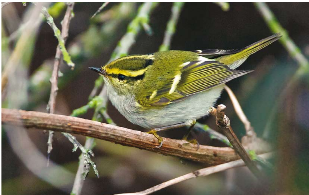
733 Pallas' Boszanger / Pallas's Leaf Warbler Phylloscopus proregulus , Maasvlakte, Zuid-Holland, 28 oktober 2016 (Martin van der Schalk)