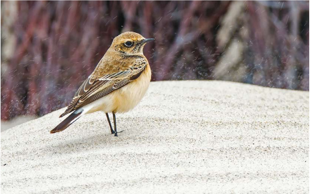
709 Pied Wheatear / Bonte Tapuit Oenanthe pleschanka , first-winter male, Düne, Helgoland, Schleswig-Holstein, Germany, 14 October ( Hans van Stijn )