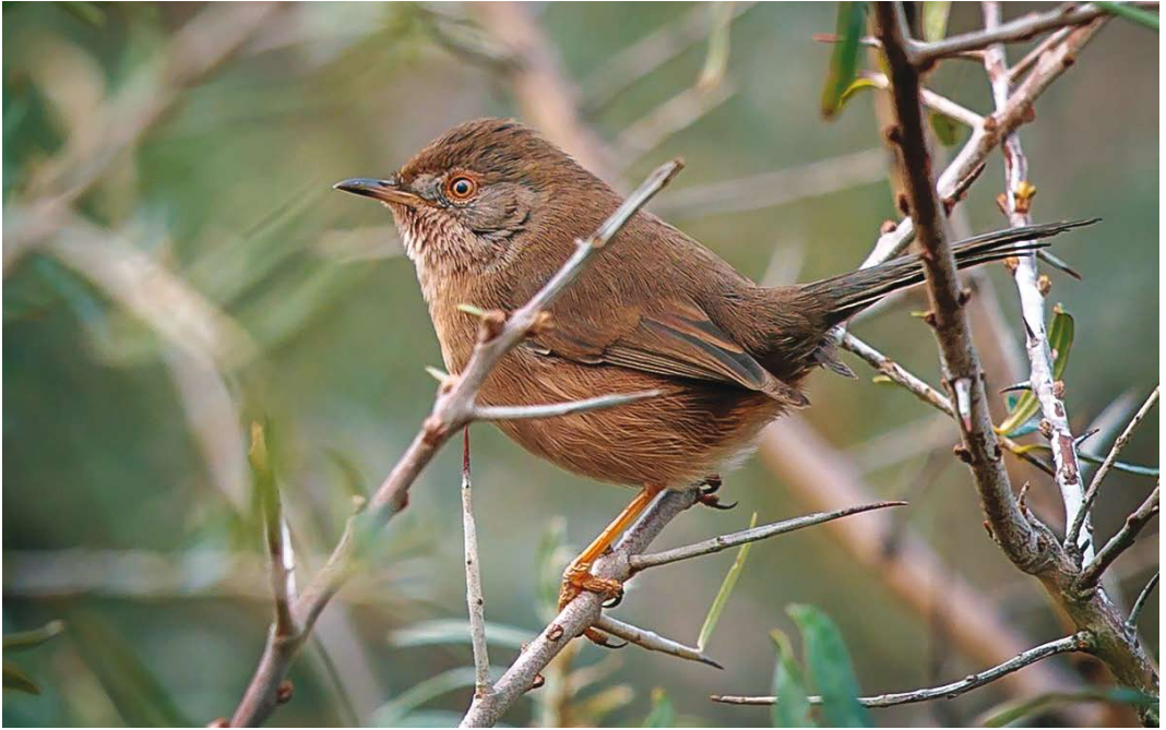
735 Provençaalse Grasmus / Dartford Warbler Sylvia undata , Tweede Maasvlakte, Zuid-Holland, 26 oktober 2016 (Toy Janssen)