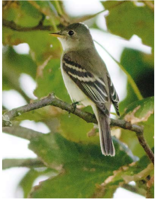
694 Turkish Fish Owl / Turkse Visuil Bubo semenowi , near Rasanjan, Kerman, Iran, 12 October 2016 ( Dorna Mojab ) 695 Alder Flycatcher / Elzenfeetiran Empidonax alnorum , Kvitsøy, Rogaland, Norway, 21 September 2016 ( Tor Olsen ) 696 Lincoln's Sparrow / Lincolns Gors Melospiza lincolni , Corvo, Azores, 30 October 2016 ( David Monticelli )