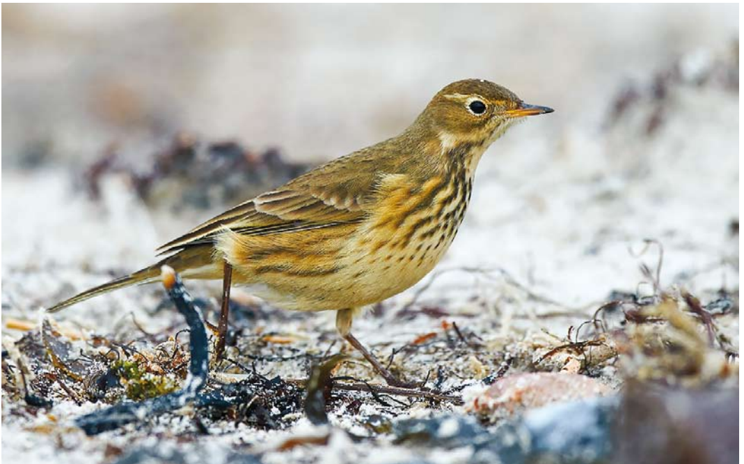
683 American Buff-bellied Pipit / Amerikaanse Waterpieper Anthus rubescens rubescens , Helgoland, Schleswig-Holstein, Germany, 6 November 2016 (Axel Halley)