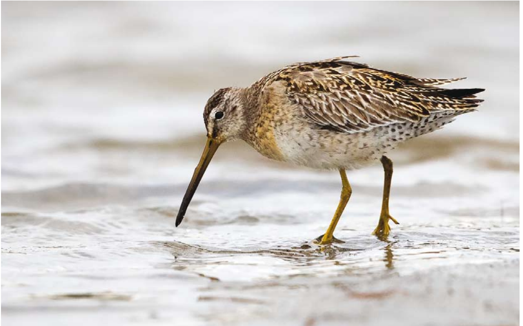
682 Short-billed Dowitcher / Kleine Grijze Snip Limnodromus griseus , juvenile, Børaunen, Rogaland, Norway, 14 October 2016