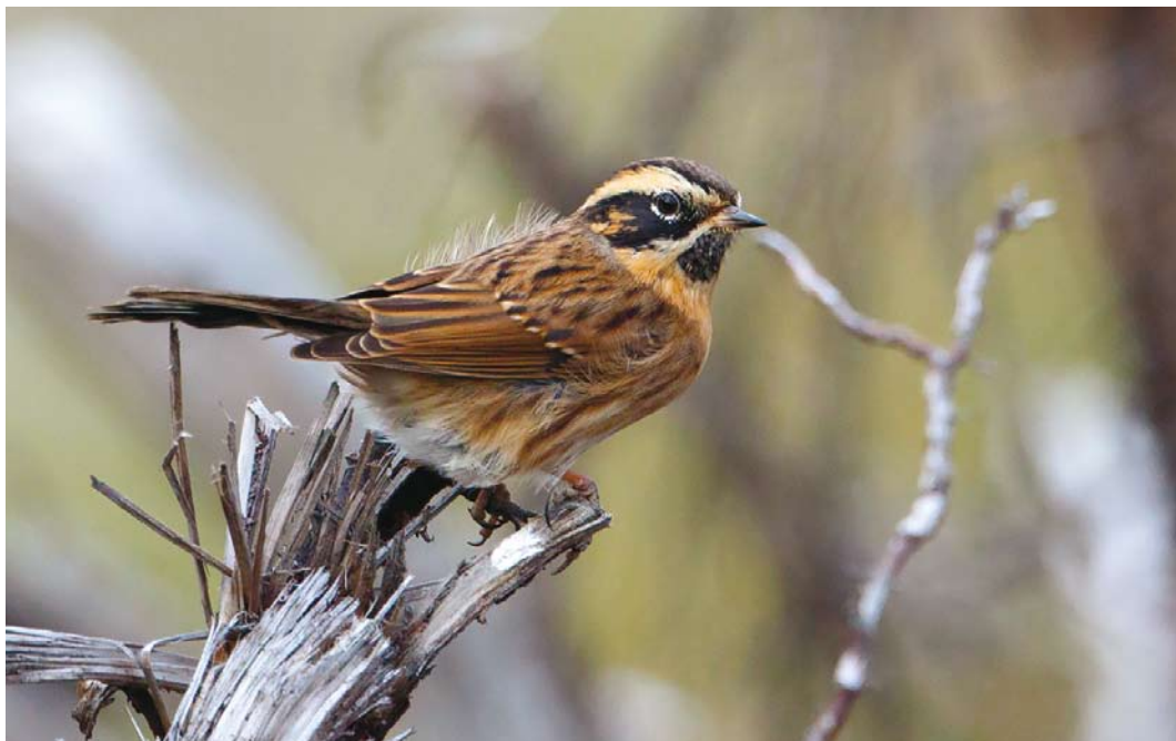
697 Black-throated Accentor / Zwartkeelheggenmus Prunella atrogularis , Vuosaari, Helsinki, Finland, 23 October 2016