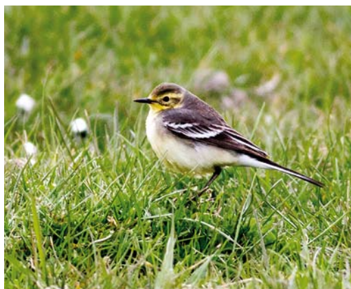
663 Blyth's Pipit / Mongoolse Pieper Anthus godlewskii , Crezéepolder, Ridderkerk, Zuid-Holland, 1 November 2015 (Karel Hoogteyling) 664 Eastern Black-eared Wheatear / Oostelijke Blonde Tapuit Oenanthe melanoleuca , male, Coepelduynen, Noordwijk, 10 June 2015 (René van Rossum) 665 Black-throated Thrush / Zwartkeellijster Turdus atrogularis , female, Loodsmansduin, Texel, Noord-Holland, 17 October 2015 (Debby Doodeman) 666 Citrine Wagtail / Citroenkwikstaart Motacilla citreola , female, Noordervroon, Westkapelle, Zeeland, 19 April 2015 (Thomas Luiten)

Holland, adult, ringed, photographed (R van der Vliet, J Valkenburg); 4 November, Kobbbeduinen, Schiermonnikoog, Friesland, photographed (W M van der Schot, F Padmos).