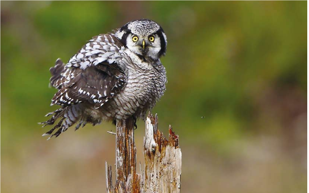
680 Northern Hawk-Owl / Sperweruil Surnia ulula , Gribskov, Nordsjælland, Denmark, 3 October 2016