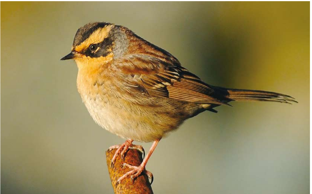
700 Siberian Accentor / Bergheggenmus Prunella montanella , Scousburgh, Mainland, Shetland, Scotland, 10 October 2016 (Rebecca Nason)