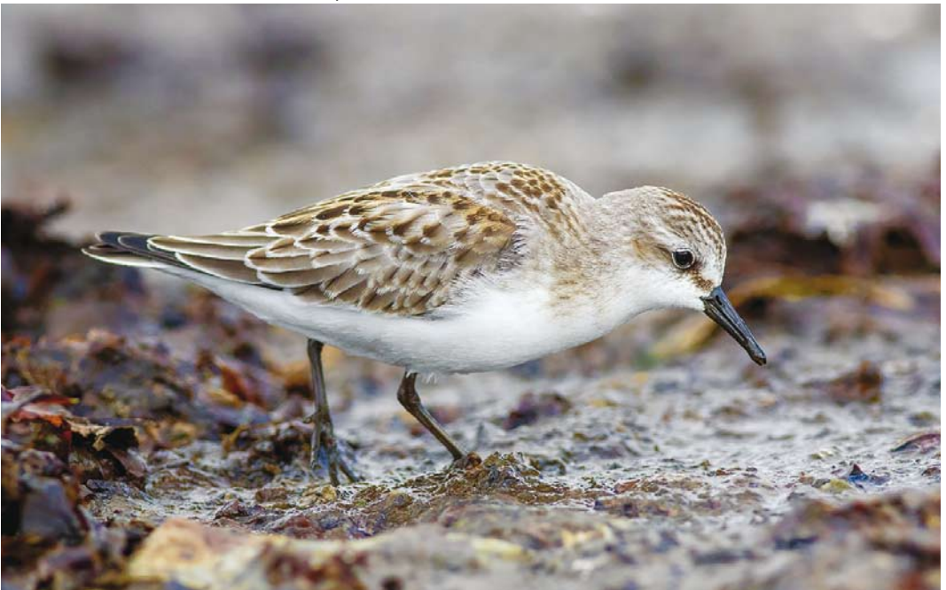
681 Red-necked Stint / Roodkeelstrandloper Calidris ruficollis , first-winter, Håstrand, Rogaland, Norway, 23 September 2016