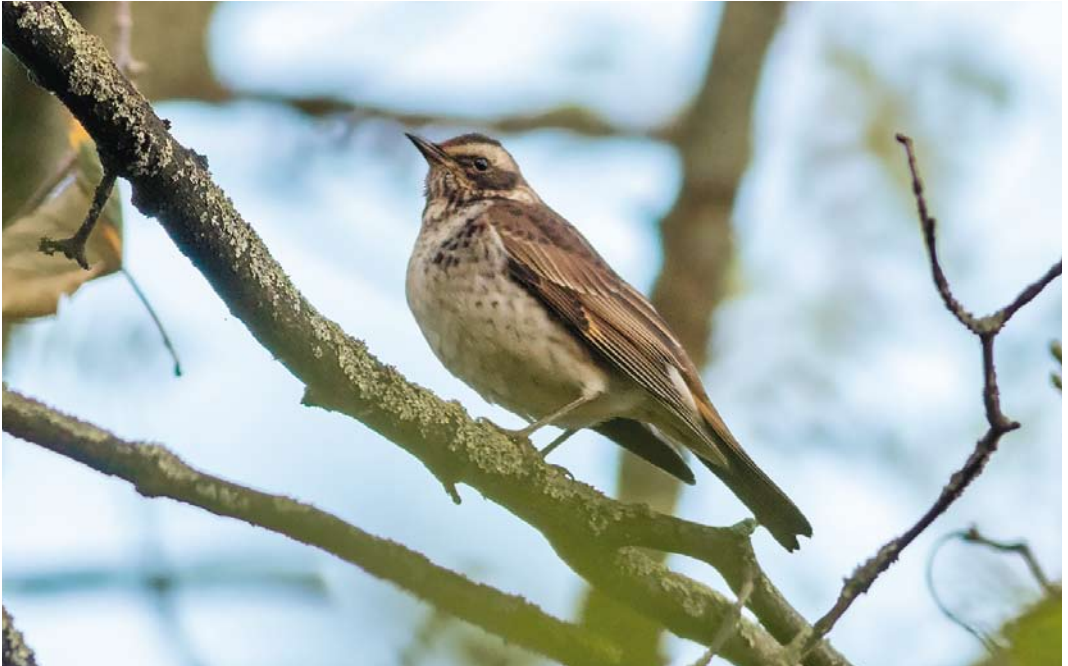
742-743 Vermoedelijke Bruine Lijster / presumed Dusky Thrush Turdus eunomus , eerstejaars vrouwtje, Beijum, Groningen, Groningen, 8 november 2016 (Jos Welbedacht)