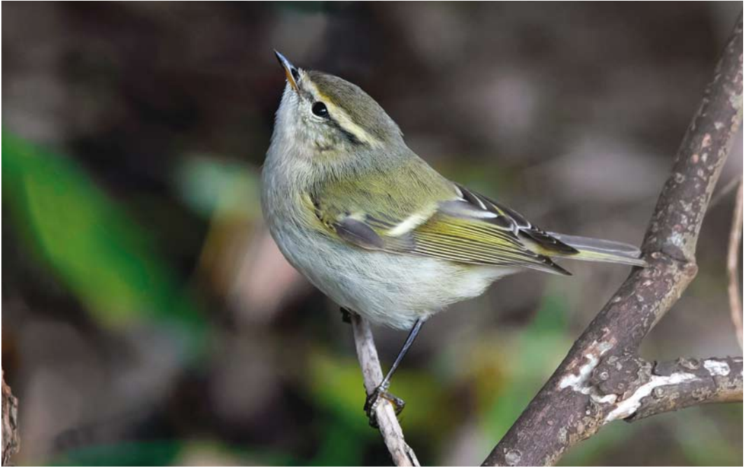
703 Hume's Leaf Warbler / Humes Bladkoning Phylloscopus humei , Blankenberge, West-Vlaanderen, Belgium, 25 October 2016 ( Filip De Ruwe )