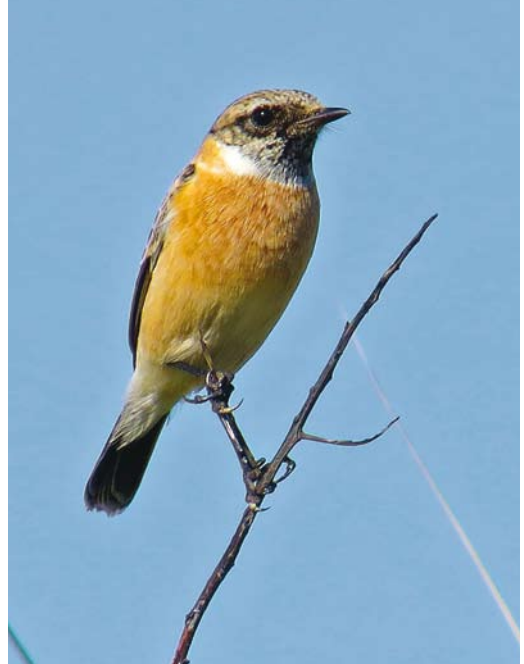
658 Arctic Warbler / Noordse Boszanger Phylloscopus borealis , Franeker, Friesland, 29 October 2015 659 Siberian Stonechat / Aziatische Roodborsttapuit Saxicola maurus maurus , first-year male, Tweede Maasvlakte, Zuid-Holland, 26 September 2015 660 Red-flanked Bluetail / Blauwstaart Tarsiger cyanurus , Coepelduynen, Noordwijk, Zuid-Holland, 10 April 2015