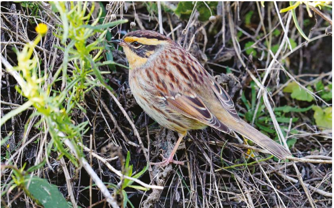
741 Bergheggenmus / Siberian Accentor Prunella montanella , Maasvlakte, Zuid-Holland, 21 oktober 2016