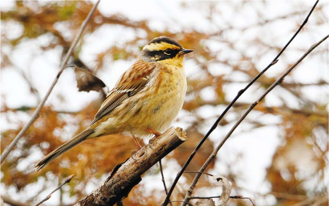
699 Siberian Accentor / Bergheggenmus Prunella montanella , Inkoo, Finland, 16 October 2016