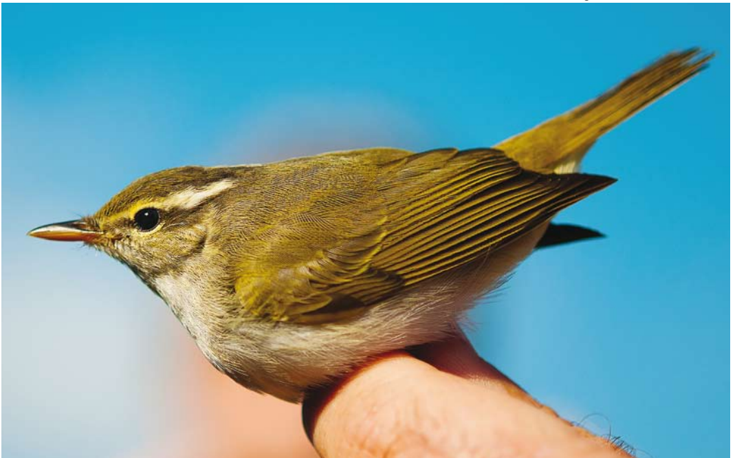
704 Eastern Crowned Warbler / Kroonboszanger Phylloscopus coronatus , Noordhollands Duinreservaat, Castricum, Noord-Holland, Netherlands, 22 October 2016 ( Arnoud B van den Berg )