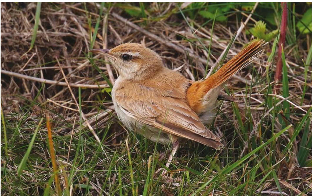
736 Rosse Waaiersstaart / Rufous-tailed Scrub Robin Cercotrichas galactotes , Maasvlakte, Zuid-Holland, 20 september 2016