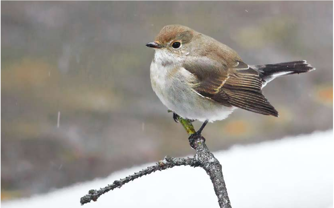
713 Taiga Flycatcher / Taigavliegenvanger Ficedula albicilla , first-winter, Seurasaari, Helsinki, Finland, 2 November 2016