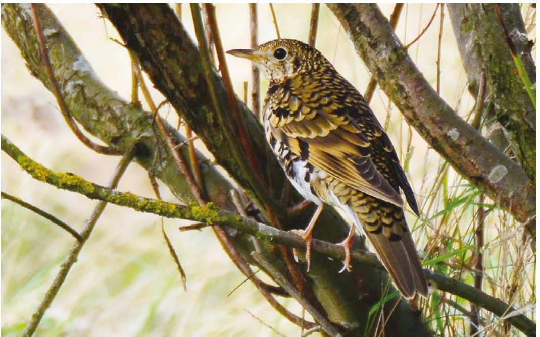
706 White's Thrush / Goudlijster Zoothera aurea , Holy Island, Northumberland, England, 5 October 2016