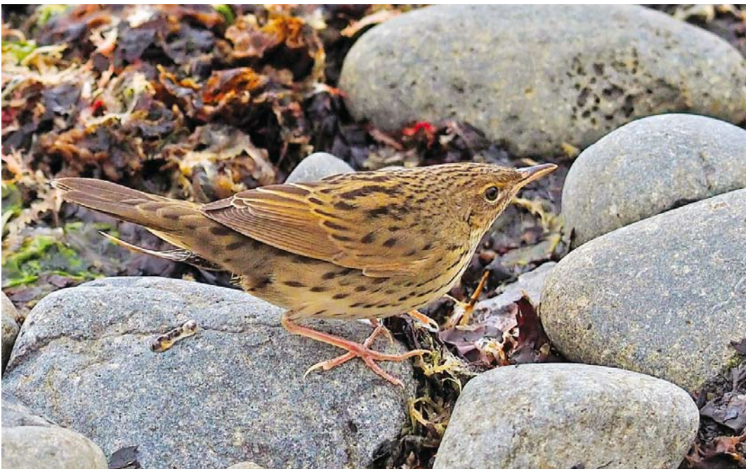
714 Lanceolated Warbler / Kleine Sprinkhaanzanger Locustella lanceolata , Famjin, Suðuroy, Faeroes, 1 October 2016 (Silas Olofson)