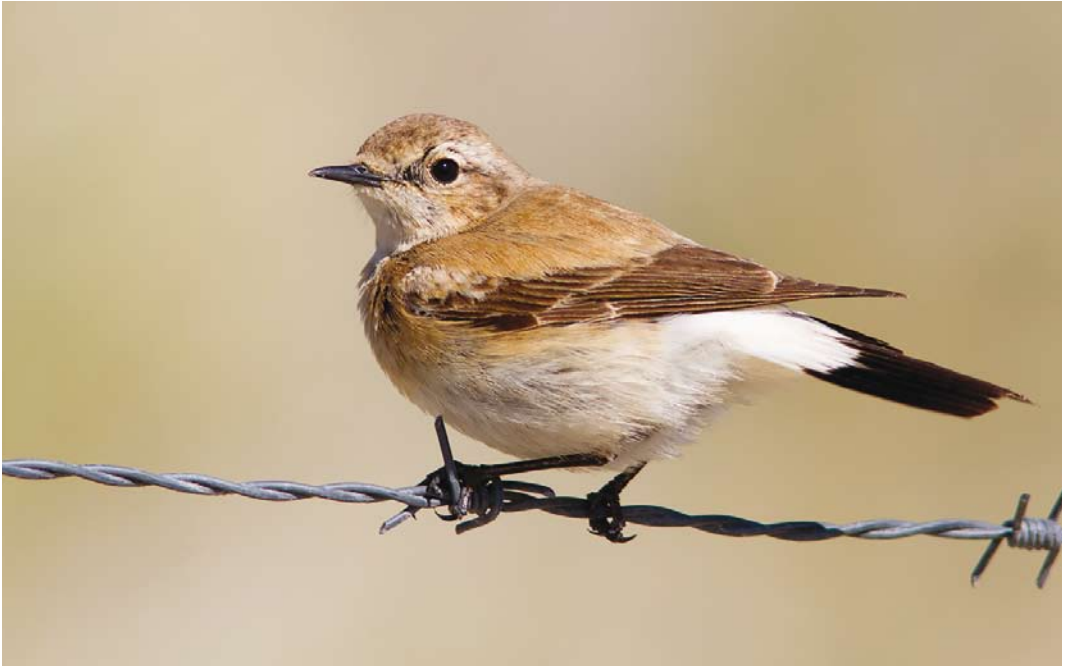
661 Desert Wheatear / Woestijntapuit Oenanthe deserti , female, IJmuiden, Noord-Holland, 27 April 2015 (Julian Bosch)