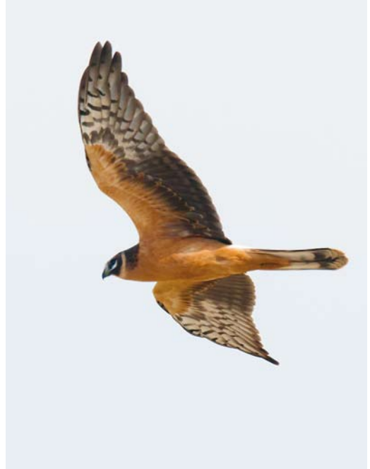
720 Kuifaalscholver / European Shag Phalacrocorax aristotelis , juveniel, Nijmegen, Gelderland, 30 oktober 2016 721 Steppiekiekendief / Pallid Harrier Circus macrourus , juveniel, Maasvlakte, Zuid-Holland, 20 september 2016 722 Oosterse Tortel / Oriental Turtle Dove Streptopelia orientalis , eerstejaars, Kroonspolders, Vlieland, Friesland, 30 oktober 2016