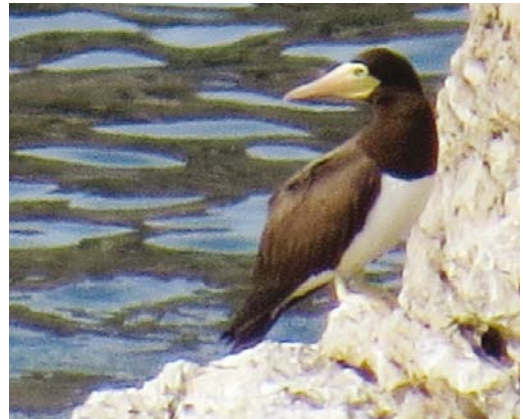
684 Pygmy Cormorant / Dwergaalscholver Phalacrocorax pygmeus , first-winter, De Blankaart, Diksmuide, West-Vlaanderen, Belgium, 20 September 2016 ( Rik Clique ) cf Dutch Birding 38: 401, 2016 685 Steppe Eagle / Stepparend Aquila nipalensis , subadult, La Janda, Cádiz, Spain, 17 October 2016 ( Javier Elorriaga/Birding The Strait ) 686 Sora Rail / Soraral Porzana carolina , first-winter, Tresco, Scilly, England, 8 October 2016 ( Mark Zekhuis ) 687 Brown Booby / Bruine Gent Sula leucogaster , adult female, Cabo de Ares, Sesimbra, Setúbal, Portugal, 25 September 2016 ( Luís Gordinho )

tween 23 September and 2 November. In Portugal, an adult female Brown Booby Sula leucogaster at Sesimbra, Setúbal, remained from 23 July to 5 October and one flew off Peniche on 12 November. In Britain, long-term population changes in 2000-15 included an increase of Northern Gannet Morus bassanus (+34%) and a decline of European Shag Phalacrocorax aristotelis (-34%).