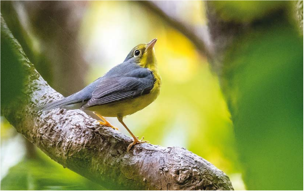
692 Canada Warbler / Canadazanger Cardellina canadensis , first-winter male, Corvo, Azores, 7 October 2016