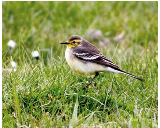
663 Blyth's Pipit / Mongoolse Pieper Anthus godlewskii , Crezéepolder, Ridderkerk, Zuid-Holland, 1 November 2015 (Karel Hoogteyling) 664 Eastern Black-eared Wheatear / Oostelijke Blonde Tapuit Oenanthe melanoleuca , male, Coepelduynen, Noordwijk, 10 June 2015 (René van Rossum) 665 Black-throated Thrush / Zwartkeellijster Turdus atrogularis , female, Loodsmansduin, Texel, Noord-Holland, 17 October 2015 (Debby Doodeman) 666 Citrine Wagtail / Citroenkwikstaart Motacilla citreola , female, Noordervroon, Westkapelle, Zeeland, 19 April 2015 (Thomas Luiten)

Holland, adult, ringed, photographed (R van der Vliet, J Valkenburg); 4 November, Kobbbeduinen, Schiermonnikoog, Friesland, photographed (W M van der Schot, F Padmos).