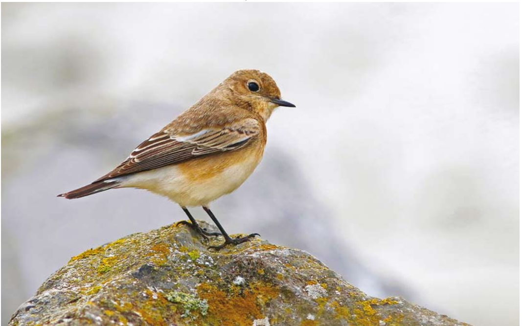
662 Pied Wheatear / Bonte Tapuit Oenanthe pleschanka , female, Schiermonnikoog, Friesland, 23 October 2015 (Thijs Glastra)