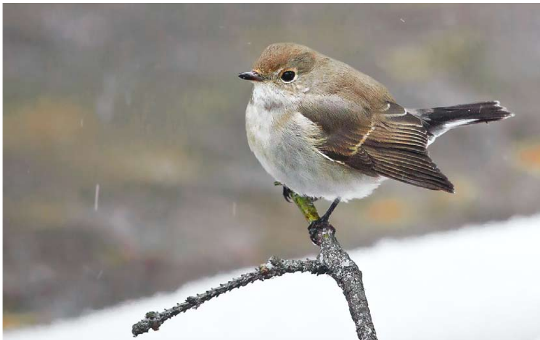
713 Taiga Flycatcher / Taigavliegenvanger Ficedula albicilla , first-winter, Seurasaari, Helsinki, Finland, 2 November 2016