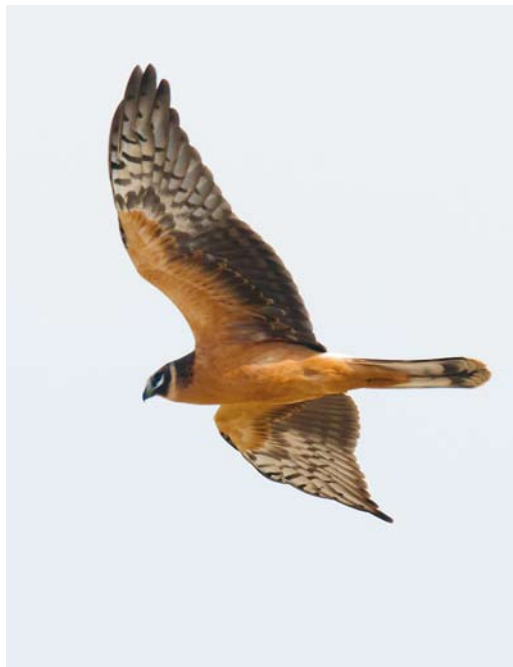
720 Kuifaalscholver / European Shag Phalacrocorax aristotelis , juveniel, Nijmegen, Gelderland, 30 oktober 2016 (Alex Bos) 721 Steppiekiekendief / Pallid Harrier Circus macrourus , juveniel, Maasvlakte, Zuid-Holland, 20 september 2016 (Arnaud B van den Berg) 722 Oosterse Tortel / Oriental Turtle Dove Streptopelia orientalis , eerstejaars, Kroonspolders, Vlieland, Friesland, 30 oktober 2016 (Frank Majoor)