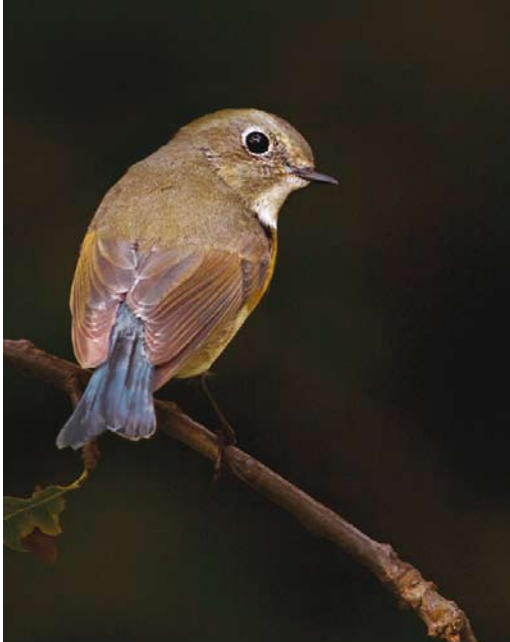
737 Blauwstaart / Red-flanked Bluetail Tarsiger cyanurus , Staatsbossen, De Koog, Texel, Noord-Holland, 16 oktober 2016