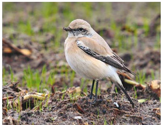
723 Raddes Boszanger / Radde's Warbler Phylloscopus schwarzi , Kobbeduinen, Schiermonnikoog, Friesland, 3 oktober 2016 724 Kleine Spotvogel / Booted Warbler Iduna caligata , eerste-winter, Maasvlakte, Zuid-Holland, 6 september 2016 725 Alpengierzwaluw / Alpine Swift Apus melba , Hazenwater, Leusden, Utrecht, 1 oktober 2016 726 Vermoedelijke Stejnegers Roodborstapuit / presumed Stejneger's Stonechat Saxicola stejnegeri , eerste-winter mannetje, Kroonspolders, Vlieland, Friesland, 9 oktober 2016 727 Daurische Klauwier / Daurian Shrike Lanius isabellinus , eerste-winter, Everdingen, Utrecht, 22 oktober 2016 728 Woestijntapuit / Desert Wheatear Oenanthe deserti , eerste-winter mannetje, Oorsprongweg, Texel, Noord-Holland, 15 oktober 2016