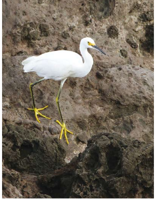
677 Levant Sparrowhawk / Balkansperwer Accipiter brevipes , juvenile, Buskett, Malta, 27 September 2016 678 Snowy Egret / Amerikaanse Kleine Zilverreiger Egretta thula , Santa Cruz da Flores, Flores, Azores, 19 October 2016 679 Thick-billed Murre / Kortbekzeekoet Uria lomvia , Anstruther, Fife, Scotland, 26 September 2016