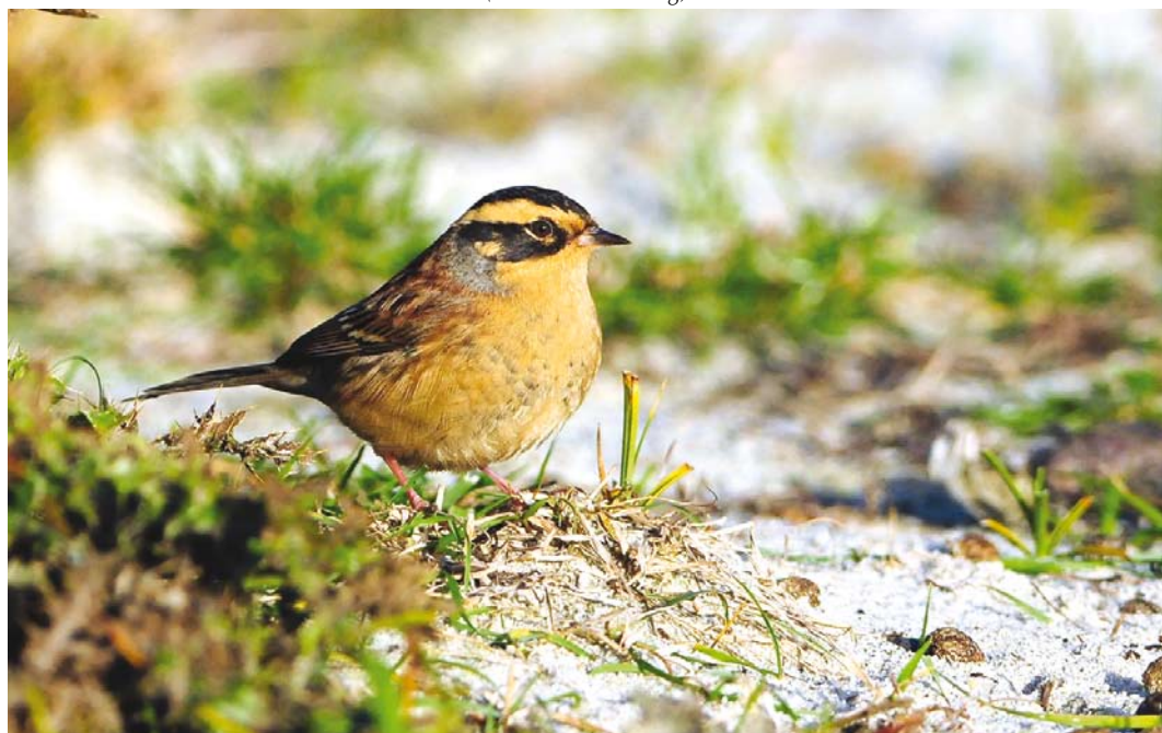
698 Siberian Accentor / Bergheggenmus Prunella montanella , Sylt, Schleswig-Holstein, Germany, 29 October 2016