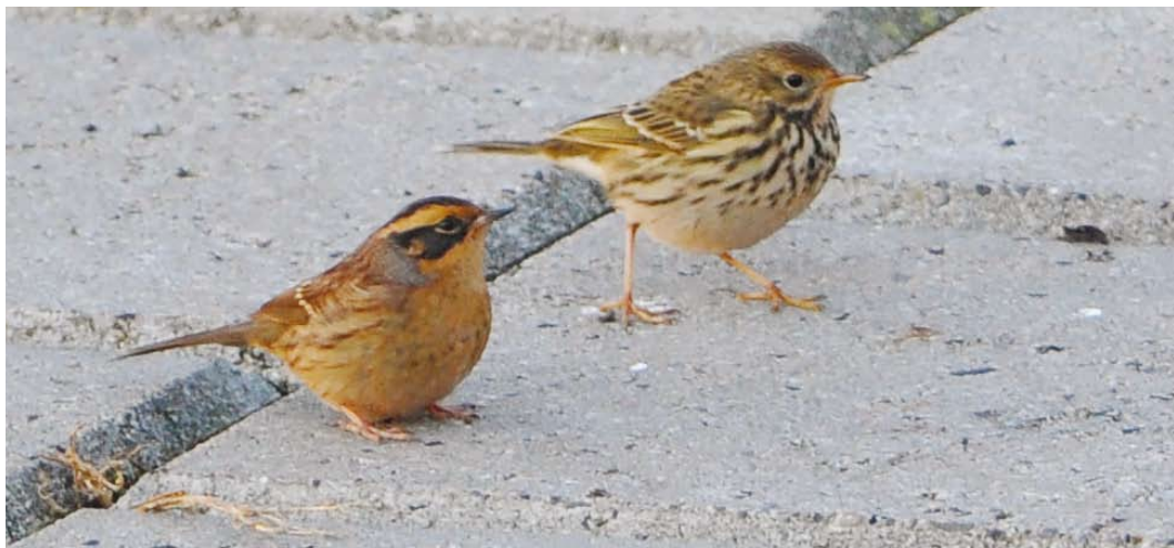
716 Siberian Accentor / Bergheggenmus Prunella montanella , with Meadow Pipit / Graspieper Anthus pratensis , Helgoland, Schleswig-Holstein, Germany, 5 November 2016 (Martin Gottschling)

morphological features supported Magnolia as its father. Up to now, at least 73 known hybrid pairings in American warblers Parulidae have been documented, ie, involving most species (Burrell et al in Wilson J Ornithol 128: 624-628, 2016). In Iceland, Myrtle Warblers S coronata were photographed at Kópavogur, Reykjavík, on 26 September and at Stöðvarfjörður on 5-7 November. A first-winter male Canada Warbler Cardelina canadensis on Corvo on 7 October was the fourth for the WP (previous ones were in Iceland in September 1973, in Ireland in October 2006 and on Corvo in October 2009).