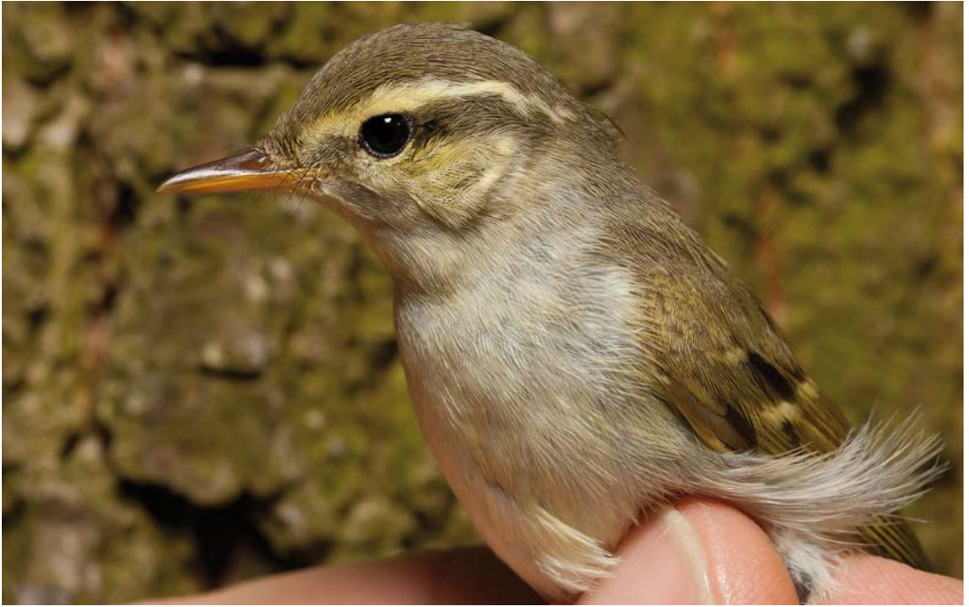
146-147 Swinhoes Boszanger / Two-barred Warbler Phylloscopus plumbeitarsus , Kamperhoek, Flevoland, 23 november 2013