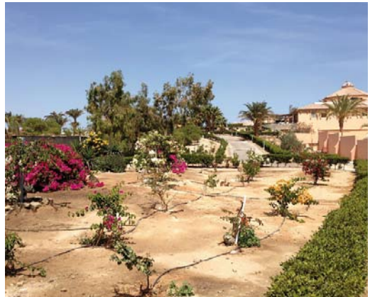
137 Oriental Skylark / Kleine Veldleeuwerik Alauda gulgula , El Gouna, Al Bahr al Ahmar, Egypt, 28 March 2012 (Edwin Winkel). Short primary projection, short tail, large unmarked loreal patch and long and slender bill typical for this species. 138 Oriental Skylark / Kleine Veldleeuwerik Alauda gulgula , El Gouna, Al Bahr al Ahmar, Egypt, 28 March 2012 (Edwin Winkel). Rufous ear-coverts and fringes of secondaries and inner primaries are normally good indications for Oriental but not very distinctive on this pale and worn bird. 139 Oriental Skylark / Kleine Veldleeuwerik Alauda gulgula , El Gouna, Al Bahr al Ahmar, Egypt, 27 March 2012 (Edwin Winkel). Nearly unmarked throat and broad supercilium fit Oriental. White belly and whitish outer tail-feathers could refer to subspecies A g ihamarum or A g inopinata . 140 Mövenpick Hotel, El Gouna, Al Bahr al Ahmar, Egypt, 22 March 2012 (Edwin Winkel). This sandy and rocky patch with flowers was exclusive habitat of Oriental Skylark Alauda gulgula in March 2012.

ish base to lower mandible. Leg fleshy-pink to yellow. MOULT & WEAR Tertiaries rather worn. SOUND Not registered.