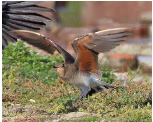
103 Oosterse Vorkstaartplevier / Oriental Pratincole Glaucophaea maldivarum , adult, Stinkgat, Sint Philipsland, Zeeland, 8 september 2014 104-105 Oosterse Vorkstaartplevier / Oriental Pratincole Glaucophaea maldivarum , adult, Stinkgat, Sint Philipsland, Zeeland, 7 september 2014 106 Oosterse Vorkstaartplevier / Oriental Pratincole Glaucophaea maldivarum , adult, Stinkgat, Sint Philipsland, Zeeland, 8 september 2014

plaat 488-489, 2014; www.dutchbirding.nl , www.waarneming.nl ) en geluidsopnamen van Dick Groenendijk, Thomas Luiten en George Tanis ( www.waarneming.nl ).