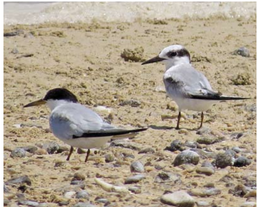
122 Saunders's Tern / Saunders' Dwergstern Sternula saundersi , Ras Sudr, South Sinai Governorate, Egypt, 22 June 2014 ( Mohamed I Habib ). Newly hatched young. 123 Saunders's Tern / Saunders' Dwergstern Sternula saundersi , Ras Sudr, South Sinai Governorate, Egypt, 5 July 2014 ( Mohamed I Habib ). Three week old juvenile. 124 Saunders's Terns / Saunders' Dwergsterns Sternula saundersi , Ras Sudr, South Sinai Governorate, Egypt, 6 July 2014 ( Mohamed I Habib ). Parent (front) with c three week old juvenile. 125 Saunders's Terns / Saunders' Dwergsterns Sternula saundersi , Ras Sudr, South Sinai Governorate, Egypt, 23 August 2014 ( Mohamed I Habib ). Parent (left) with five week old juvenile.

In 2015, on 11 June (11:00), only three pairs were found; one pair was displaying with small fish and one pair attended a nest with two eggs. On 26 June (07:30), c 35 adults were found, as well as one fledgling and four nests. Finally, on 8 August (11:30), at least c 140 and possibly more than c 60 adults and fledglings were counted, including c 50 fledglings, the highest count to date at Ras Sudr.