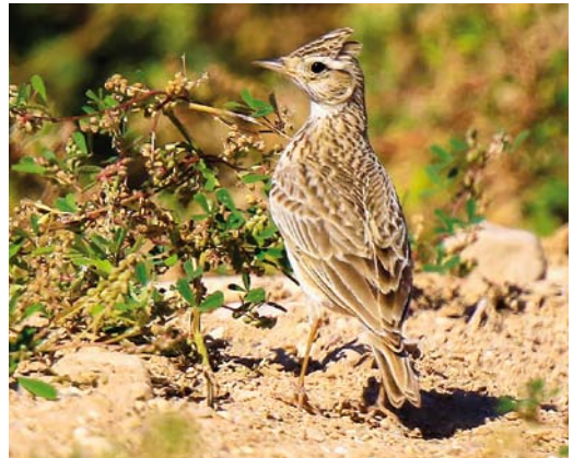
141-144 Oriental Skylark / Kleine Veldleeuwerik Alauda gulgula , Eilat, Israel, March 2015 ( Hadoram Shirihai ). Note overall greyish plumage with limited rufous on ear-coverts and fringes of visible primaries.

the distinctive supercilium, creating a unique front view. Another character is the rufous trailing edge to the wing, visible in flight. In Eurasian, this edge is white and, in Crested, it is not distinguishable from the colour of the rest of the wing but this character is not visible in the photographs. The rufous ear-coverts and fringes to the secondaries and inner primaries are generally also distinctive characteristics for Oriental but on the pale and worn El Gouna bird this was not very obvious. The bird flew up a few times but I did not register a sound (a buzzing call described as bzruu or bazterr is unique to Oriental ( Shirihai 1986 )).