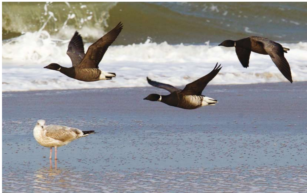
183 Zwarte Rotgans / Black Brant Branta nigricans , adult, met Rotganzen / Black-bellied Brent Geese B. bernicla , Katwijk aan Zee, Zuid-Holland, 18 november 2015