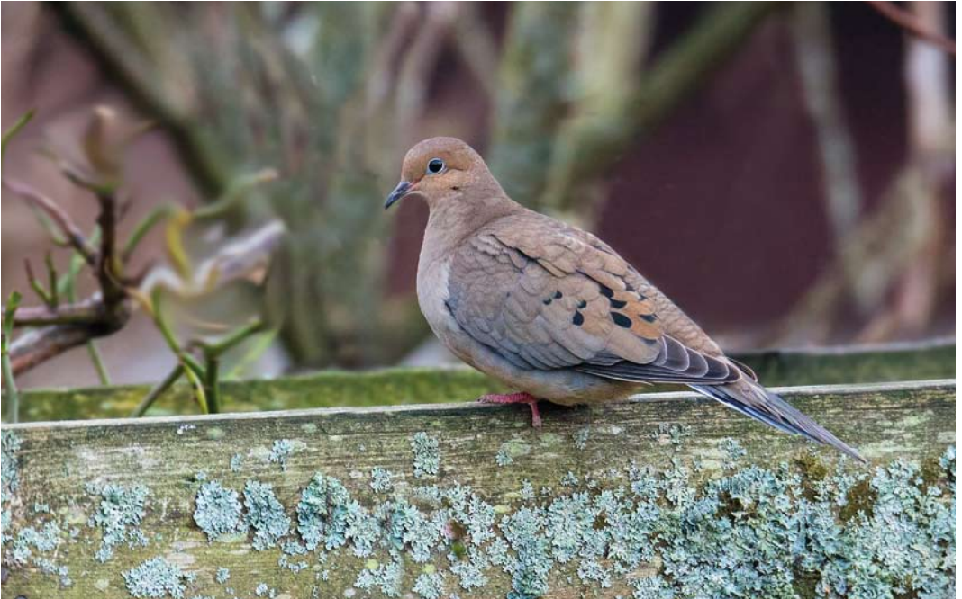
160 Mourning Dove / Treurduif Zenaida macroura , Lerwick, Mainland, Shetland, Scotland, 29 December 2015 (Hugh Harrop)