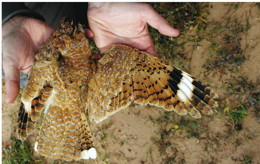
130 Golden Nightjar / Goudgele Nachtzwaluw Caprimulgus eximius , between Dakhla and Aousserd, Western Sahara, Morocco, 3 May 2015 (Jurek Dyczkowski)

HEAD White patch on throat and throat side, poorly to prominently visible depending on position of feathers; with ruffled feathers, shape of patch not well visible. White patch divided into central patch and two side patches.