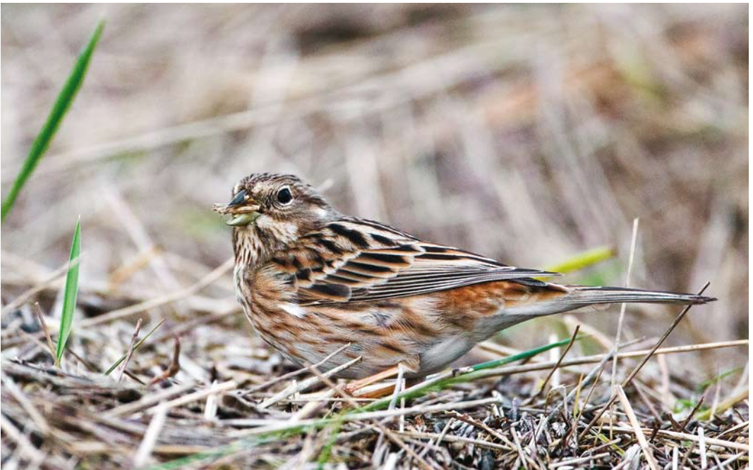
180 Pine Bunting / Witkopgors Emberiza leucocephalos , first-year female, Wilhelminadorp, Zeeland, Netherlands, 17 December 2015 ( Co van der Wardt )