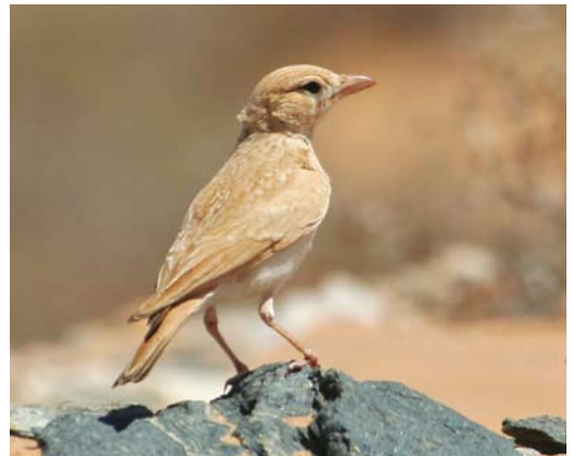
134 Desert Sparrows / Woestijnmussen Passer simplex , Oued Gtta Dwiyaite, Western Sahara, Morocco, May 2015 (Jurek Dyczkowski) 135 Cricket Warbler / Krekelprinia Spiloptila clamans , c 70 km west of Oued Jenna, Western Sahara, Morocco, May 2015 (Jurek Dyczkowski) 136 African Dunn's Lark / Afrikaanse Dunns Leeuwerik Eremophila dunnii dunnii , between Dakhla and Aousserd, Western Sahara, Morocco, May 2015 (Jurek Dyczkowski)

is also the area where the first White-throated Bee-eater Merops albicollis for the WP ('sensu BWP') was recorded in December 2013 (Bergier et al 2015). It is likely that more discoveries will follow; the Sahara desert is not a barrier of lifeless dunes but is dotted with vegetated wadis. Birds move between these patches of habitat, and it is possible that other sub-Saharan species appear