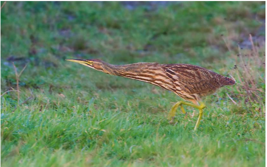
159 American Bittern / Noord-Amerikaanse Roerdomp Botaurus lentiginosus , first-year, Castlefreke, Cork, Ireland, 8 December 2015 ( David Monticelli )