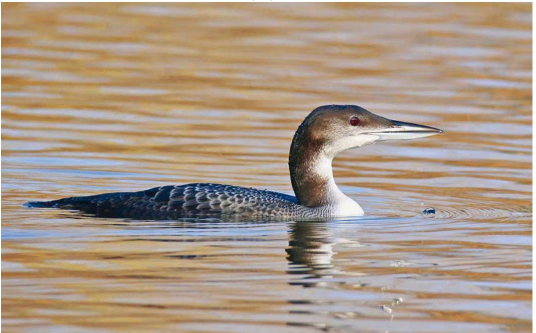
153 Great Northern Loon / IJsduiker Gavia immer , first-winter, Drava river, Otok, Croatia, 28 November 2015 (Maciej Szymański)