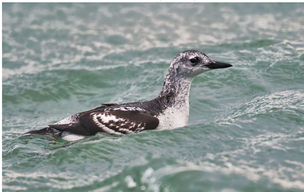
184 Zwarte Zeekoet / Black Guillemot Cephus grylle , eerstejaars, Vluchthaven Neeltje Jans, Zeeland, 6 december 2015 ( Paul van Tuil )