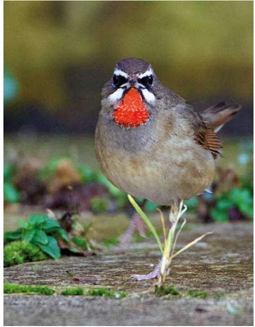
176 Arabian Golden-winged Grosbeak / Arabische Goudvleugelvink Rhynchostruthus percivali , male, Dhofar mountains, Oman, 17 November 2015 ( Tobias Epple/birdingtours.de ) 177 Siberian Rubythroat / Roodkeelnachtegaal Calliope calliope , second calendar-year male, Hoogwoud, Noord-Holland, Netherlands, 16 January 2016 ( Martin van der Schalk ) 178 Black-throated Accentor / Zwartkeelheggenmus Prunella atrogularis , Ventės Ragas, Šilutė, Lithuania, 24 December 2015 ( Vytautas Eigirdas )