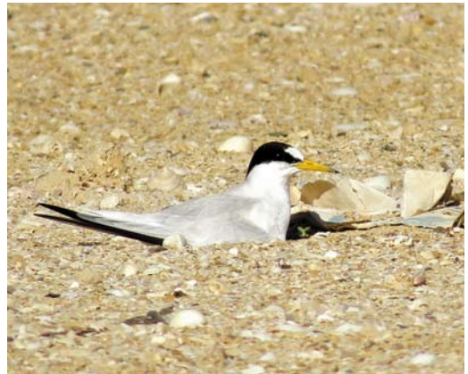
118 Saunders's Terns / Saunders' Dwergsterns Sternula saundersi , Ras Sudr, South Sinai Governorate, Egypt, 1 June 2014 (Mohamed I Habib). Male offering fish to female before mating. 119 Saunders's Terns / Saunders' Dwergsterns Sternula saundersi , Ras Sudr, South Sinai Governorate, Egypt, 1 June 2014 (Mohamed I Habib). Adults encircling each other during display. 120 Nest of Saunders's Tern Sternula saundersi , Ras Sudr, South Sinai Governorate, Egypt, 22 June 2014 (Mohamed I Habib) 121 Saunders's Tern / Saunders' Dwergstern Sternula saundersi , Ras Sudr, South Sinai Governorate, Egypt, 23 June 2014 (Mohamed I Habib). Adult on nest.