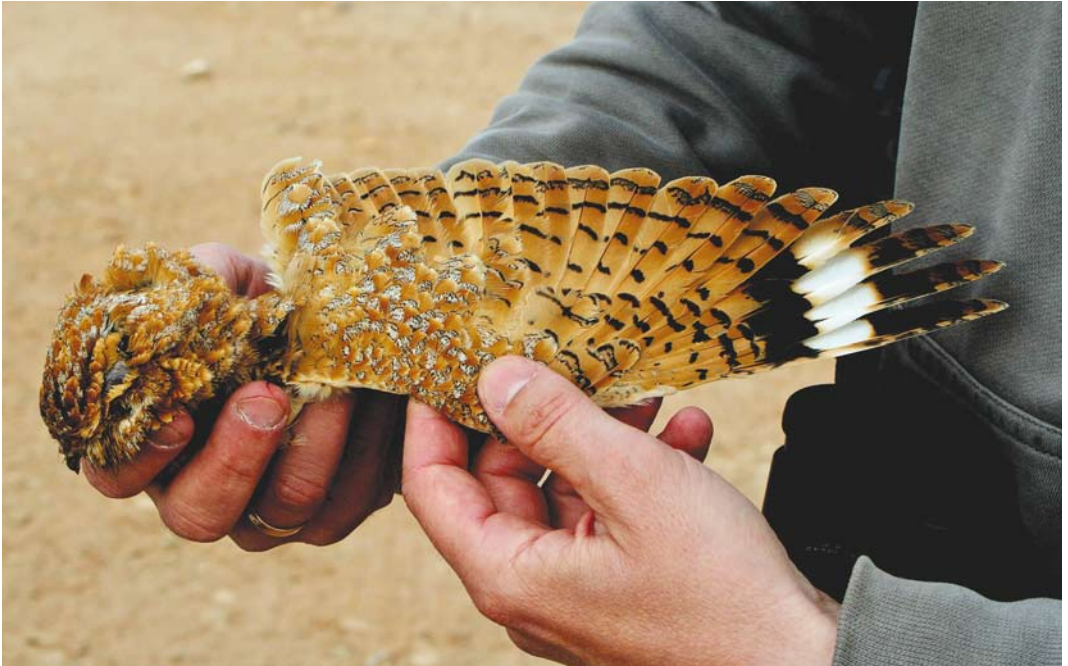
131-132 Golden Nightjar / Goudgele Nachtzwaluw Caprimulgus eximius , between Dakhla and Aousserd, Western Sahara, Morocco, 3 May 2015 (Jurek Dyczkowski)