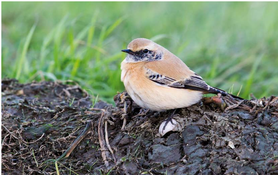
190 Woestijntapuit / Desert Wheatear Oenanthe deserti , eerstejaars mannetje, Elsgeesterpolder, Voorhout, Zuid-Holland, 20 november 2015