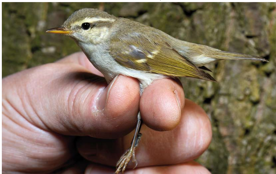
145 Swinhoes Boszanger / Two-barred Warbler Phylloscopus plumbeitarsus , Kamperhoek, Flevoland, 23 november 2013 (Mervyn Roos)

Thuisgekomen wierp MR een snelle blik in Svensson et al (2012); het eerste wat hem opviel waren de bij de gevangen vogel ontbrekende wit-