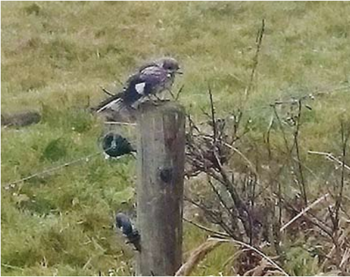
192 Maskerklauwier / Masked Shrike Lanius nubicus , first-winter, Hoorn, Terschelling, Friesland, 2 november 2015 (Peter Johan Rutgers)