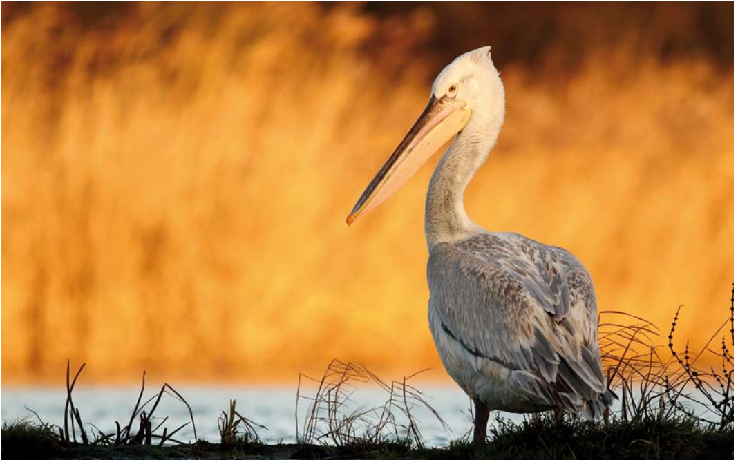
158 Dalmatian Pelican / Kroeskoppelikaan Pelecanus crispus , second calendar-year, Wierzbiczany, Kujawsko-Pomorskie, Poland, 22 December 2015