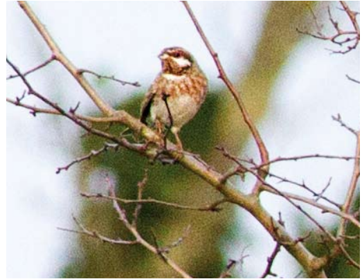
193 Witkopgors / Pine Bunting Emberiza leucocephalos , mannetje, Broekhuizen, Limburg, 2 december 2015

22 november tot in januari in en rond Amsterdam, Noord-Holland. Ook werden ten minste 10 Grote Burge-meesters L hyperboreus gemeld; een vogel vanaf 15 december in Scheveningen, Zuid-Holland, trok de meeste bekijks. Een eerstejaars Witwangstern Chlidonias hybrida werd tussen 30 november en 14 december af en toe opgemerkt langs de IJmeerdijk bij Almere, Flevoland.