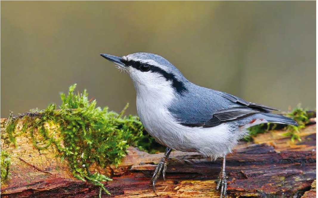
179 Asian Nuthatch / Aziatische Boomklever Sitta europaea asiatica , male, Augustów, Podlaskie, Poland, 18 November 2015