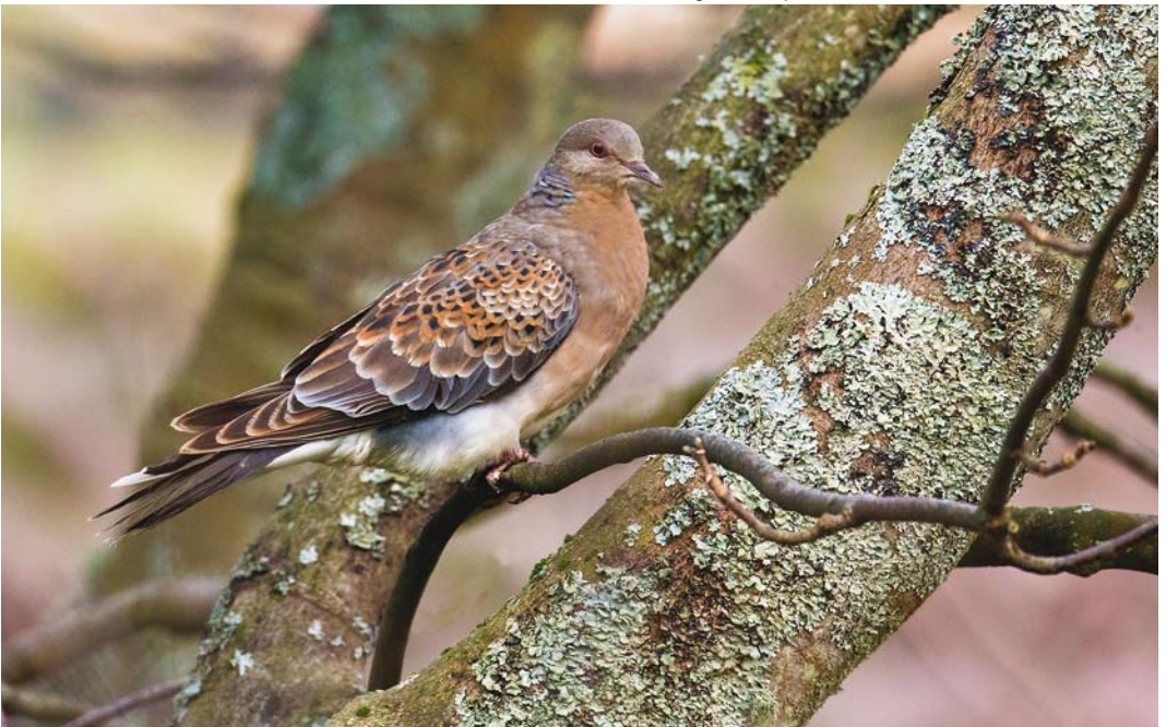
161 Rufous Turtle Dove / Meenatortel Streptopelia orientalis meena , first-winter, Scalloway, Mainland, Shetland, Scotland, 30 November 2015