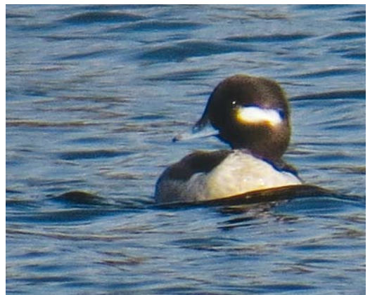
162 Hybrid Greater Spotted x Lesser Spotted Eagle / hybride Bastaardarend x Schreeuwarend Aquila clanga x pomarina , juvenile, La Janda, Cadíz, Spain, 20 December 2015 ( Javier Elorriaga ) 163 Rufous Turtle Dove / Meenatortel Streptopelia orientalis meena , Espeland, Bergen, Hordaland, Norway, 17 January 2016 ( Bert de Bruin ) 164 Striped Crake / Afrikaans Porseleinhoen Aenigmatolimnas marginalis , Córdoba, Spain, 13 January 2016 ( Diego Peinazo Amo ) 165 Great Bustard / Grote Trap Otis tarda , Hayogev, Jizreel valley, Israel, 12 December 2015 ( Barak Granit ) 166 Long-tailed Duck / IJseend Clangula hyemalis , female, Essaouira, Morocco, 4 January 2016 ( Brahim Bakass ) 167 Bufflehead / Buffelkoepeend Bucephala albeola , female, Aldeia Nova, Altura, Algarve, Portugal, 10 January 2016 ( Luís Gordinho )