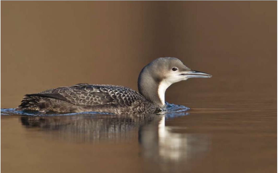
152 Pacific Loon / Pacifische Parelduiker Gavia pacifica , first-winter, Silvaplannersee, Graubünden, Switzerland, 22 December 2015 (Stefan Wassmer)