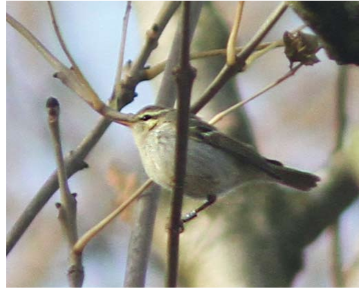
150 Swinhoes Boszanger / Two-barred Warbler Phylloscopus plumbeitarus , Kamperhoek, Flevoland, 2 december 2013 (Marten Miske)

te zoom. Top van staartpennen spits, met name t3-6. NAAKTE DELEN Iris zeer donker. Bovensnavel hoornkleurig, ondersnavel heldergeel. Poot grijsbruin, tenen geelbruin met roze tinten, nagels geelachtig grijsbruin. SLEET Geheel verenkleed vers en ongesleten, inclusief hand-, arm- en staartpennen. BIOMETRIE Vleugellengte 54.5 mm. Staartlengte 37 mm. P7 (van binnen naar buiten genummerd) 43 mm, p8 41 mm. Buitenvlag van p5-8 versmald. Handpenprojectie 60% van zichtbaar deel tertials. Tarsusdikte 1.5 mm. Gewicht 7.3 g. Vetgraad 3 (Busse & Kania 1970). GELUID Twee roepjes: scherp oplopend enkellettergrepig tsiek en tweelettergrepig tju-liep , met dalende eerste lettergreep en stijgende tweede lettergreep.