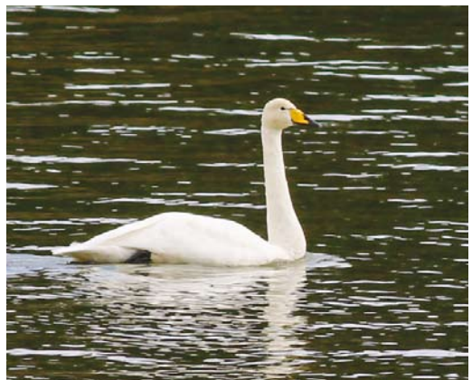
168 Naumann's Thrush / Naumanns Lijster Turdus naumanni , Budapest, Hungary, 31 December 2015 169 Eurasian Blue Tit / Pimpelmees Cyanistes caeruleus , Buskett, Malta, 11 December 2015 170 Asian Dowitcher / Aziatische Grijze Snip Limnodromus semipalmatus , with Ruffs / Kemphanen Calidris pugnax , Al Ansab lagoons, Muscat, Oman, 3 November 2015 171 Black Drongo / Koningsdrongo Dicrurus macrocercus , Salmi, Kuwait, 21 November 2015 172 American Coot / Amerikaanse Meerkoet Fulica americana , adult, Lambhagi, Reykjavík, Iceland, 5 January 2016 173 Whooper Swan / Wilde Zwaan Cygnus cygnus , adult, São Miguel, Azores, 5 December 2015