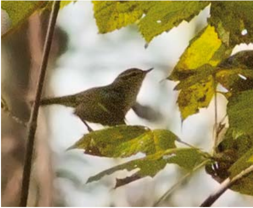
149 Swinhoes Boszanger / Two-barred Warbler Phylloscopus plumbeitarus , Kamperhoek, Flevoland, 30 november 2013 (Herman Bouman)