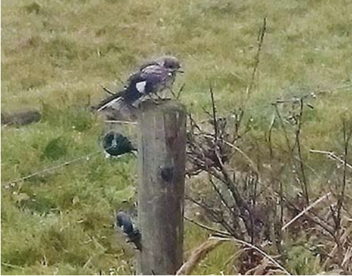
192 Maskerklauwier / Masked Shrike Lanius nubicus , first-winter, Hoorn, Terschelling, Friesland, 2 november 2015