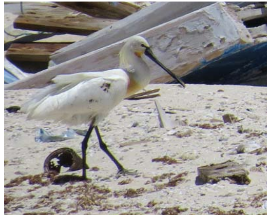
113 Red Sea Spoonbills / Rode-Zeelepelaars Platalea leucorodia archeri and Indian Reef Herons / Rode-Zeerifreigers Egretta gularis schistacea , Ashrafi, Red Sea Governorate, Egypt, 12 June 2014 (Mohamed I Habib). Mixed colony. 114 Red Sea Spoonbill / Rode-Zeelepelaar Platalea leucorodia archeri , adult, Ashrafi, Red Sea Governorate, Egypt, 19 June 2013 (Mohamed I Habib). Bird trying to remove oil contamination during preening. 115 Red Sea Spoonbill / Rode-Zeelepelaar Platalea leucorodia archeri , adult, Big Magawish Island, Red Sea Governorate, Egypt, 18 June 2013 (Mohamed I Habib). Note garbage on island and oil staining on bird.

In 2013, we (re)visited three islands (Abu Mingar, Ashrafi and Big Magawish). On 18 June, one pair with a nest and a nestling of three weeks old was seen on Big Magawish. On 19 June, four pairs incubating four nests were found on Ashrafi.