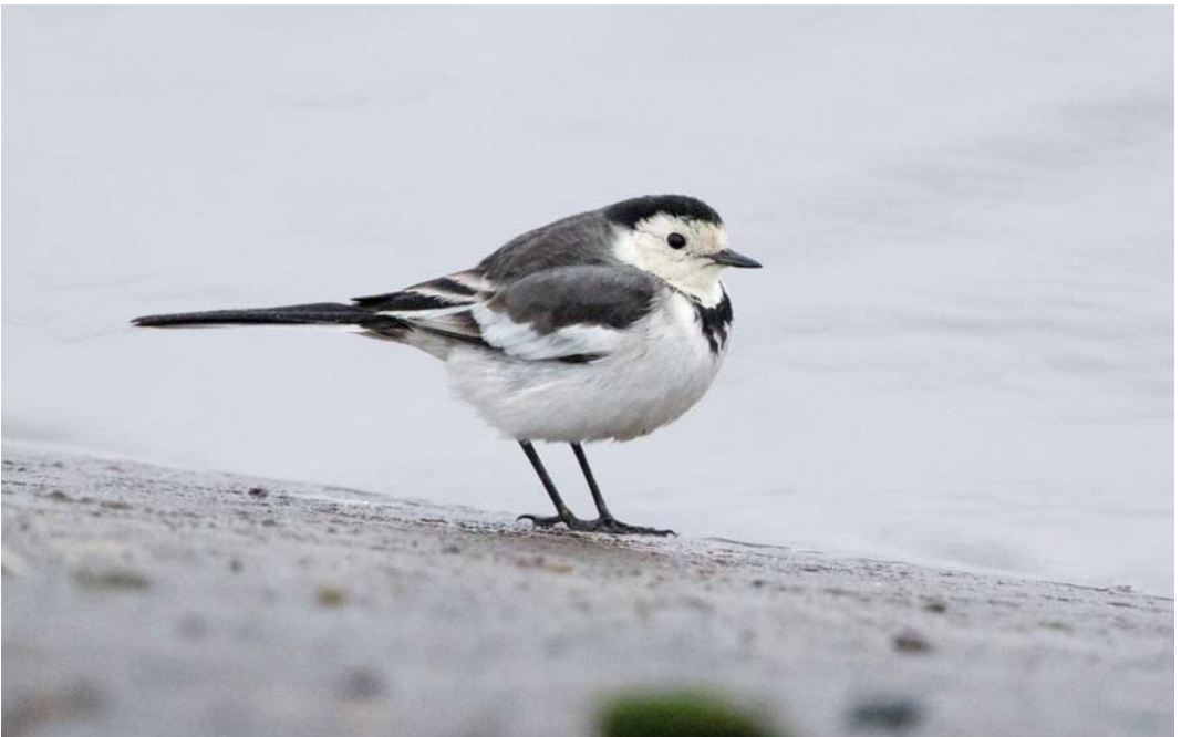
175 Amur Wagtail / Amoerkwikstaart Motacilla leucopsis , first-winter male, Kujala, Päijät-Häme, Finland, 27 November 2015 (Petri Koivisto)