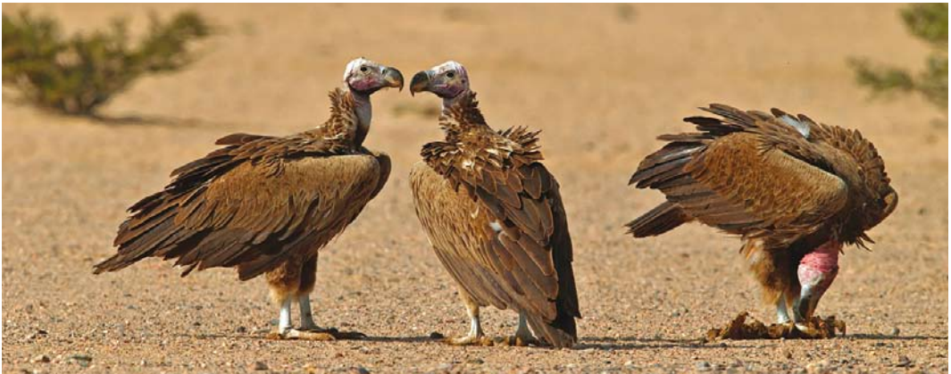
181 Brown-necked Raven / Bruinnekraaf Corvus ruficollis , Pantelleria, Italy, 2 March 2017 182 Brown-necked Raven / Bruinnekraaf Corvus ruficollis , Teguise, Lanzarote, Canary Islands, 5 February 2017 183 Lappet-faced Vultures / Oorgieren Torgos tracheliotos , Bir Shalatayn, Egypt, 14 February 2017

Hungary, a total of 1555 individuals was estimated to be present at nine sites situated in six national parks (Aquila 121: 37-63, 2014). In Central Asia, remnant populations were small and isolated in the beginning of the 21st century, the species being rare or almost extinct in former Soviet republics and provinces in Russia, except for Saratov (but 'population requires continued monitoring' here after a decline from 3000 to 900 individuals in 1998-2013) and perhaps Samara ('rare') (Aquila 121: 107-132, 2014).