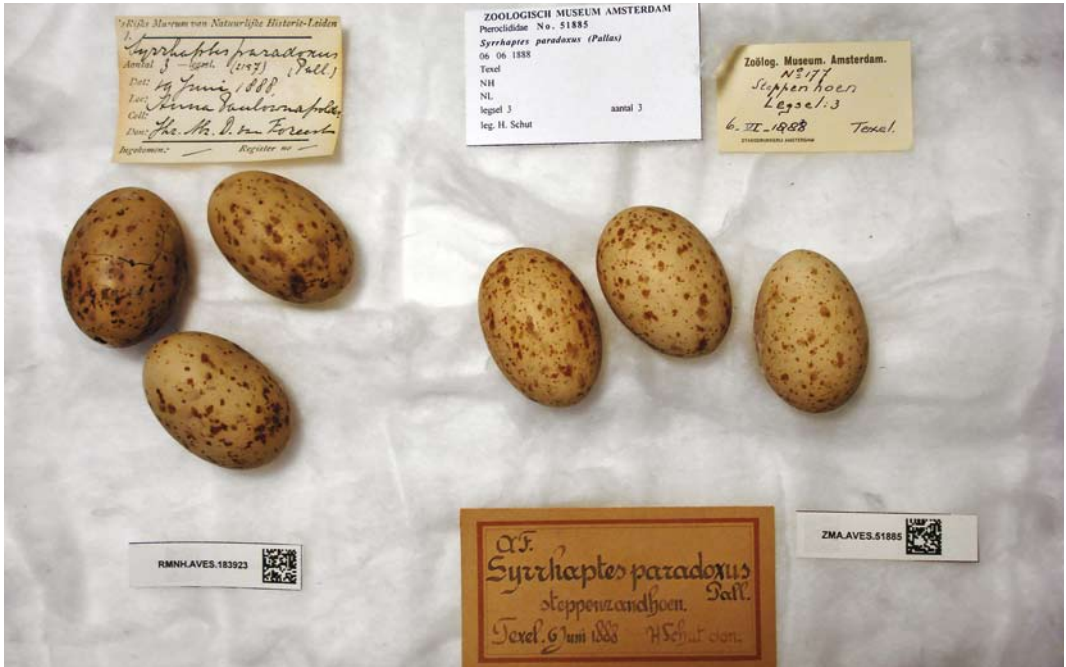
107 Legsels van Steppenhoen / Pallas's Sandgrouse Syrnhaptes paradoxus (verzameld op Texel, Noord-Holland, op 6 juni 1888 (rechts) en te Anna-Paulownapolder, Noord-Holland, op 19 juni 1888), Naturalis Biodiversity Center, Leiden, Zuid-Holland, 13 november 2013