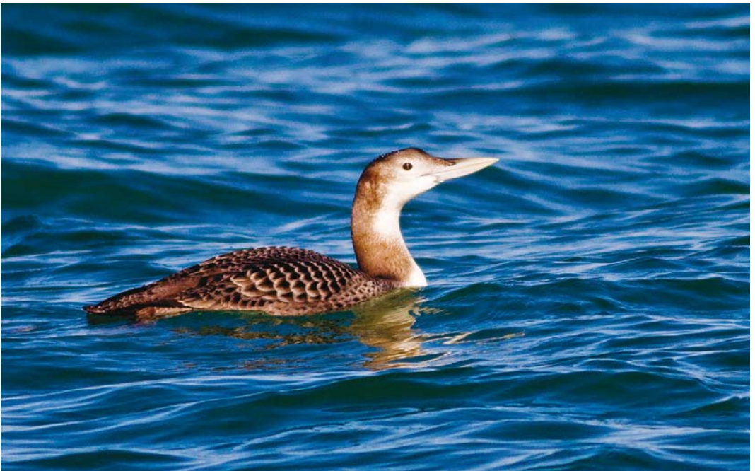
55 Yellow-billed Loon / Geelsnavelduiker Gavia adamsii , first-winter, Balatonföldvár, Balaton lake, Hungary, 3 December 2016 (József Mészáros)