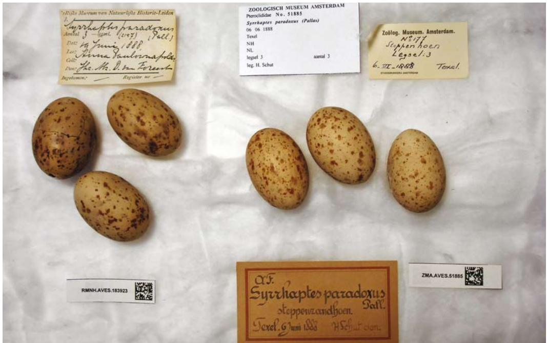
107 Legsels van Steppenhoer / Pallas's Sandgrouse Syrnhaptes paradoxus (verzameld op Texel, Noord-Holland, op 6 juni 1888 (rechts) en te Anna-Paulownapolder, Noord-Holland, op 19 juni 1888), Naturalis Biodiversity Center, Leiden, Zuid-Holland, 13 november 2013