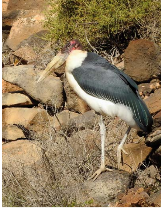
184 Long-billed Dowitcher / Grote Grijsze Snip Limnodromus scolopaceus , Narimanabad, Kizil Agach, Azerbaijan, 31 January 2017 ( Jos van Oostveen/Kaukasus Plus Reizen ) 185 Marabou Stork / Afrikaanse Maraboe Leptoptilos crumenifer , Puerto del Rosario, Fuerteventura, Canary Islands, 24 January 2017 ( Guus van Duin ) cf Dutch Birding 39: 44, 2017 186 Sora / Sorral Porzana carolina , Silves, Algarve, Portugal, 26 January 2017 ( Nigel Genn )