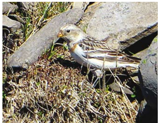
277 Common Rock Thrush / Rode Rotslijster Monticola saxatilis , adult male, St Martin's, Scilly, England, 15 April 2017 ( Brian Harrison ) 278 Black-throated Thrush / Zwartkeellijster Turdus atrogularis , adult male, Wadi Lahami, Egypt, 25 April 2017 ( Mattias Nilsson ) 279 White-crowned Wheatear / Witkruintapuit Oenanthe leucopyga , first-summer, Campo Gallo, Viterbo, Italy, 26 March 2017 ( Angelo Meschini ) 280 Blue-naped Mousebird / Blauwnekmuisvogel Urocolius macrourus , Choum, Adrar, Mauritania, 19 April 2017 ( Claes Wikström/bigyearwp.com ) 281 Little Bunting / Dwerggors Emberiza pusilla , adult, Drăușeni, Brașov, Romania, 27 March 2017 ( József Szabó ) 282 Snow Bunting / Sneeuwgors Plectrophenax nivalis , female, Pico do Areiro, Madeira, 3 April 2017 ( Han Buckx )