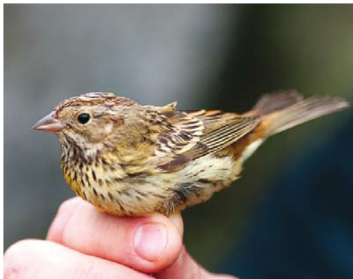
244 Chestnut Bunting / Rosse Gors Emberiza rutila , first-winter, Merkeskogen, Utsira, Rogaland, Norway, 5 October 2010

4# 31 October 2016, Corvo (Ławicki & van den Berg 2016f; Dutch Birding 38: 457, plate 696, 2016)