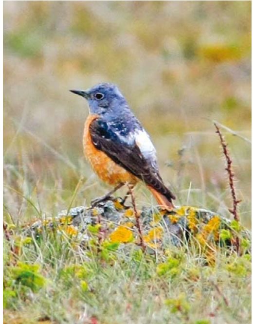
289 Blue Rock Thrush / Blauwe Rotslijster Monticola solitarius , male, Beachy Head, Sussex, England, 6 April 2017 290 Common Rock Thrush / Rode Rotslijster Monticola saxatilis , first-summer male, Den Helder, Noord-Holland, Netherlands, 3 May 2017 291 Hermit Thrush / Heremietlijster Catharus guttatus , Noss, Shetland, Scotland, 19 April 2017