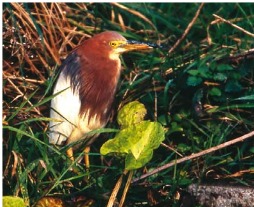
233 Chinese Pond Heron / Chinese Ralreiger Ardeola bacchus , adult, Eccles-on-Sea, Norfolk, England, 31 October 2004 (Neil Bowman)