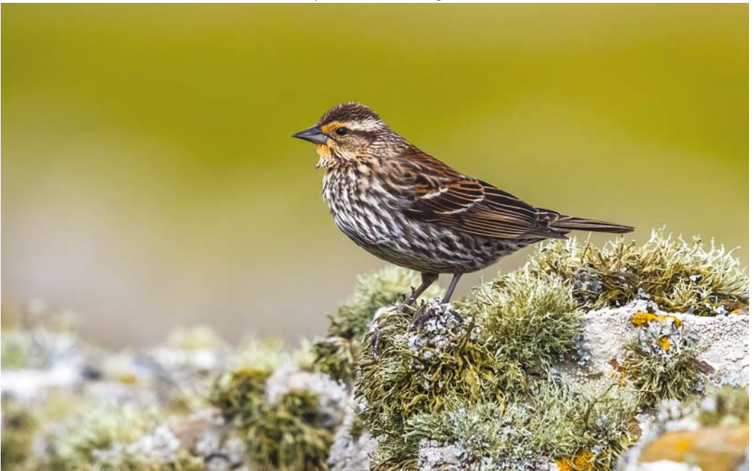
264 Red-winged Blackbird / Epauletspreeuw Agelaius phoeniceus , female, North Ronaldsay, Orkney, Scotland, 14 May 2017