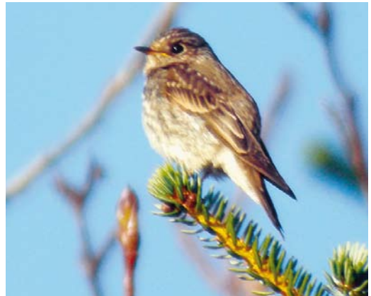
236 Yellow-throated Vireo / Geelkeelvireo Vireo flavifrons , Corvo, Azores, 11 October 2008 237 Eastern Crowned Warbler / Kroonboszanger Phylloscopus coronatus , Ingooigem, West-Vlaanderen, Belgium, 24 October 2016 238 Thick-billed Warbler / Diksnavelrietzanger Arundinax aedon , Geosetter, Mainland, Shetland, Scotland, 5 October 2013 239 Dark-sided Flycatcher / Roetvliegenvanger Muscicapa sibirica , first-winter, Höfn, Austur-Skaftafellssýsla, Iceland, 5 October 2012

two juveniles (van den Berg & Haas 2013d, Isenmann et al 2016)