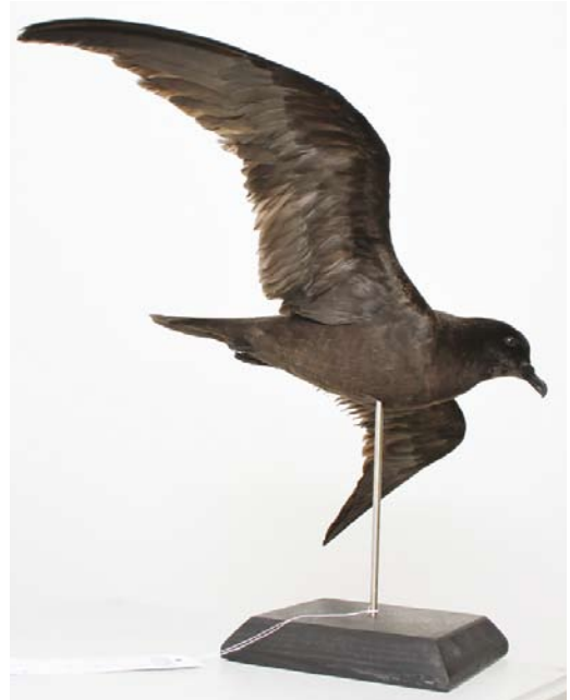
253 Bulwer's Petrel / Bulwers Stormvogel Bulweria bulwerii (picked up alive at Kressbachsee, Baden-Württemberg, Germany, on 20 July 2015), Staatliches Museum für Naturkunde, Stuttgart, Baden-Württemberg, Germany, 16 October 2016