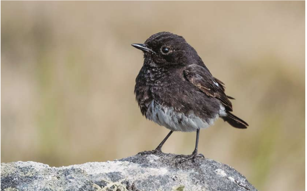
263 Pied Bush Chat / Zwarte Roodborsttapuit Saxicola caprata , first-summer male, Utö, Korppoo, Finland, 19 May 2017