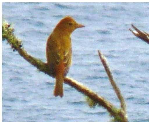
241 Stejneger's Stonechat / Stejnegers Roodborsttapuit Saxicola stejnegeri , first-winter male, Orivesi, Pappilanniemi, Finland, 7 November 2013 ( Jani Vastamäki ) 242 Variable Wheatear / Picatatapuit Oenanthe picata , Liyah Reserve, Jahra, Kuwait, 24 March 2014 ( Abdulrahman Al-Sirhan ) 243 Summer Tanager / Zomertangare Piranga rubra , Ribeira da Lapa, Corvo, Azores, 14 October 2010 ( Hugues Dufourny )

2#9-11 October 2015, Ottenby, Öland (Magnus Hellström in litt)